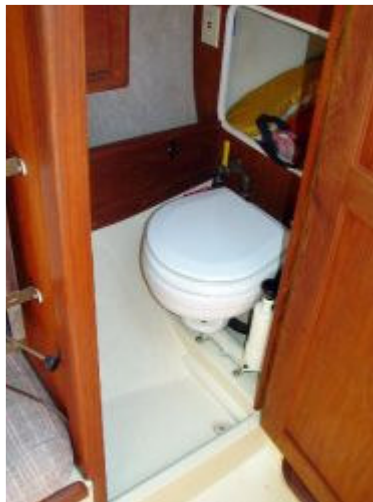
Head with wet locker behind