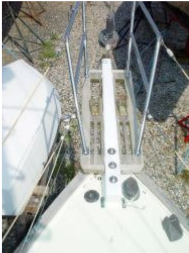
Bowsprit w/double rollers