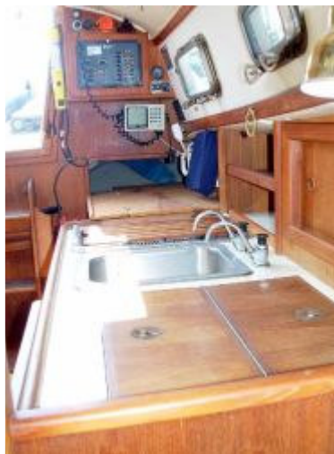
Looking aft on port side