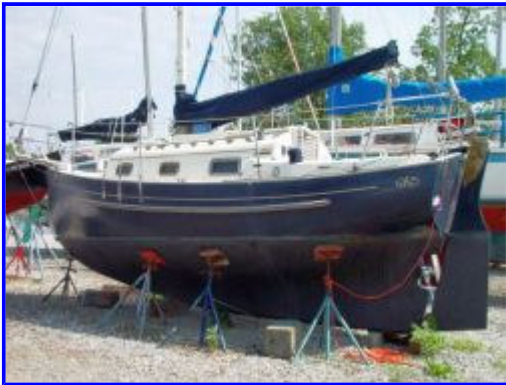
Ready for a new name!