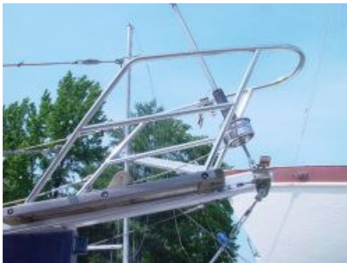
Harken roller furling

On starboard behind the V berth is a straight settee. There is storage beneath it, behind it and an open shelf above and behind. A Force 10 kerosene cabin heater is on the bulkhead between the settee and the head. Continuing aft into the head, there is a port light and overhead light for ventilation and light, a wet locker behind the head and a teak drop front cabinet along the hullside.