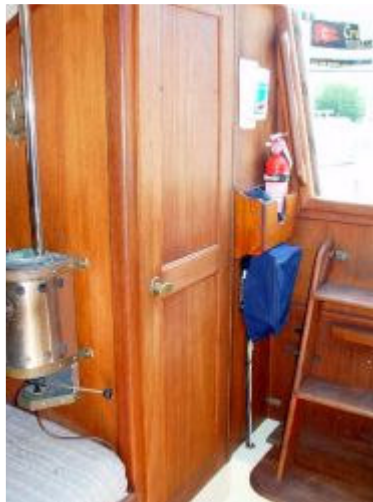
Bulkhead heater and head door