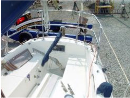
Nice, lengthy cockpit