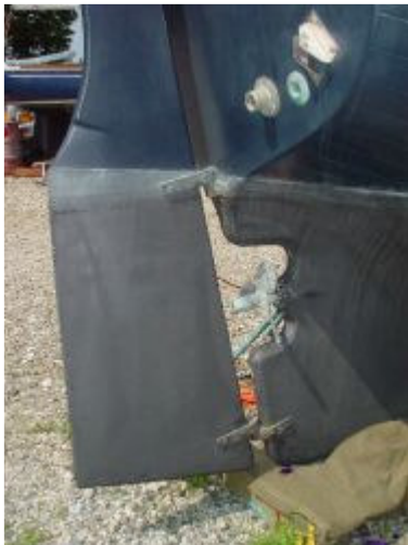
Beefy rudder and protected prop