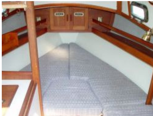
V berth with the insert in