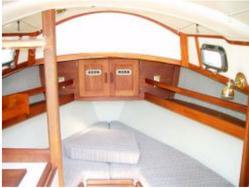
A cozy berth