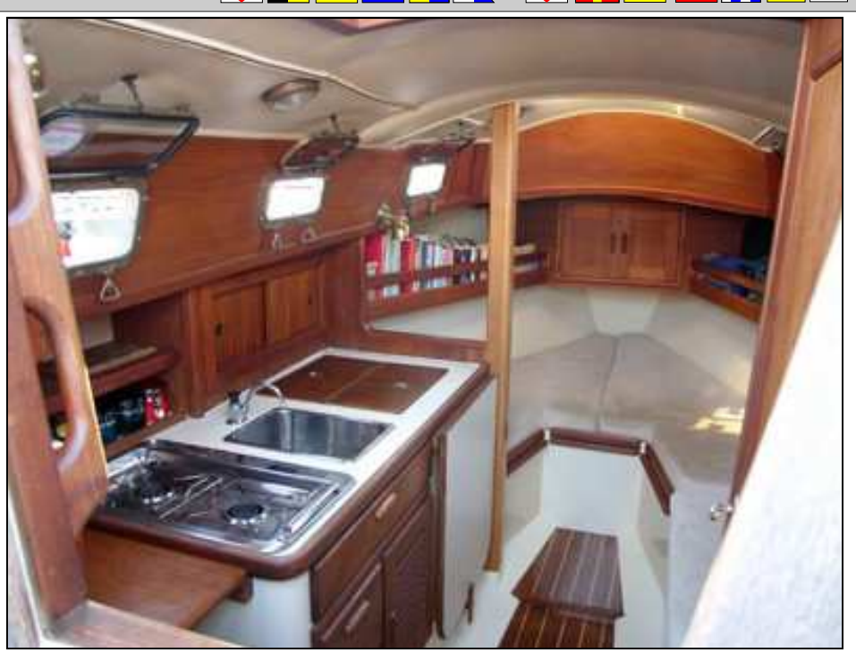
Something about a cozy teak lined cabin! Small sailboat interiors need not be cramped and shoddily fitted out. Don't small boats deserve a bit of craftsmanship too?

But what it's really all about is fun . Small boats are more fun. Small boats are a joy to sail. You can anchor under sail with ease and in the morning, without even starting the engine, you can slip out respectfully leaving your neighbors surprised to see you gone. You can sneak into