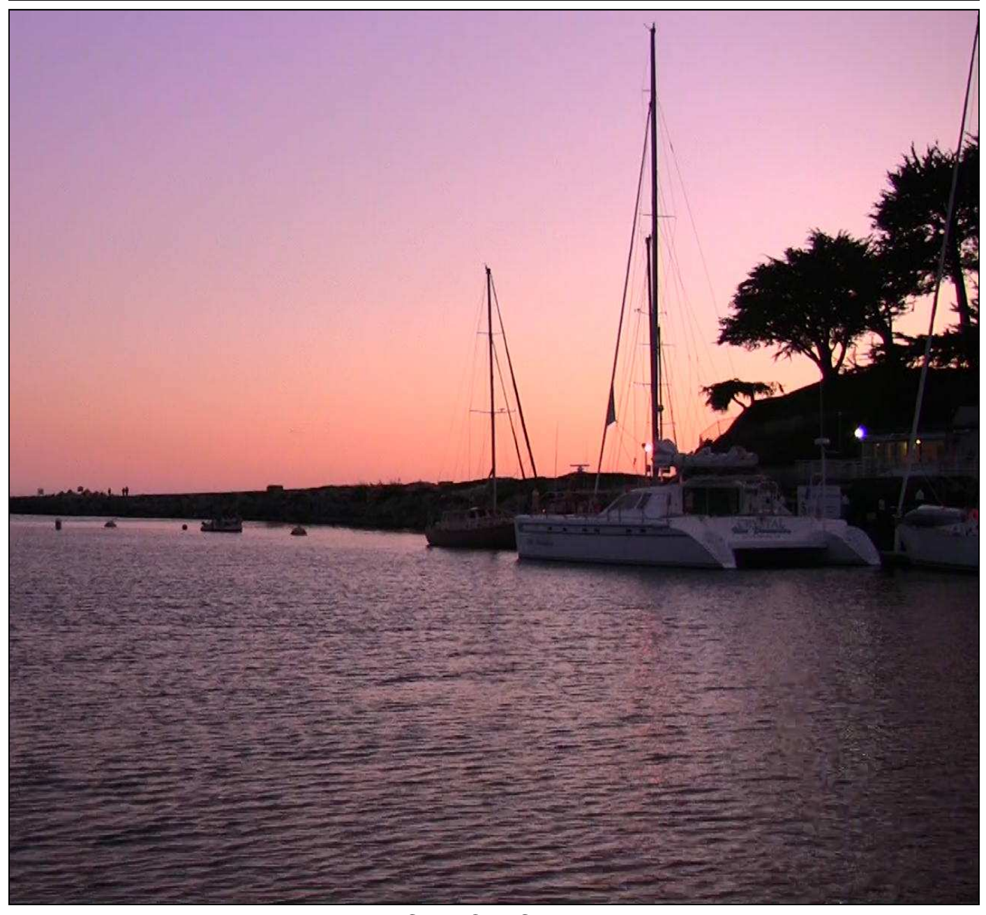
Santa Cruz Sunset

mum speed recorded on the GPS was 11.8 mph. The afternoon brought very strong winds and the tops of the waves were blowing off in an impressive spray. These conditions finally forced me to drop the main sail I was running on and motor the last few miles to the protection of Monterey Bay.