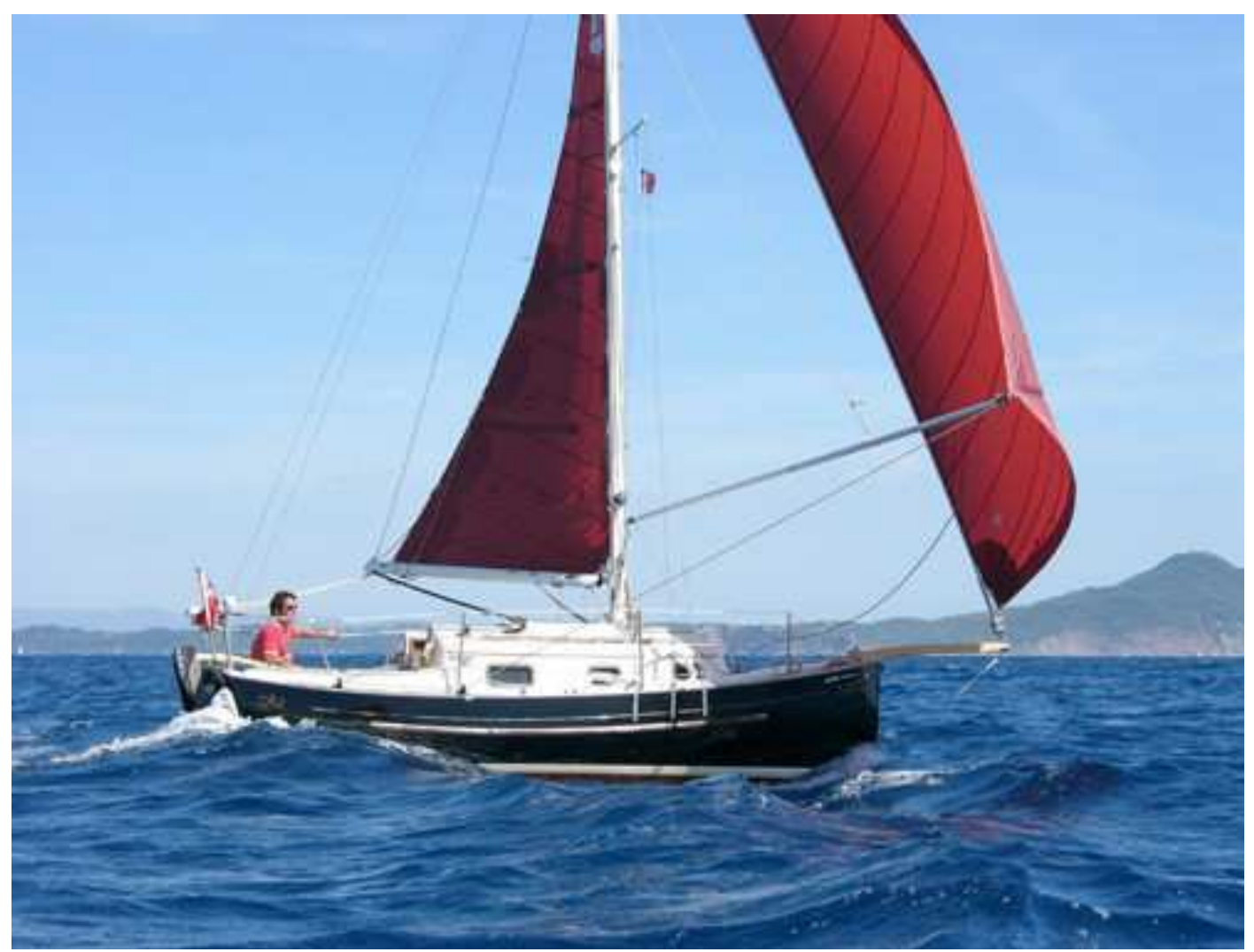
Finally in the Mediterranean running under full sail off the French coast.