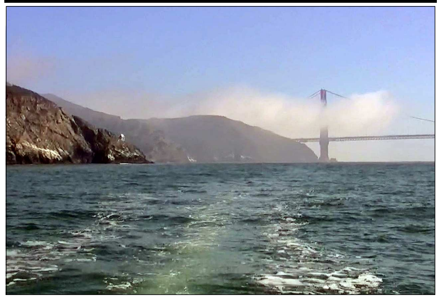
Fog continues to dissipate as Lil'Toot approaches the Golden Gate Bridge

Since I live in Reno, it was fairly easy to fly to Oakland, California and take their rapid transit train to Berkeley. But, the challenge then was to walk through downtown Berkeley with a back pack and guitar (another late life commitment...guitar lessons) without assaulting my 63 year old conservative ego. In the 1960's I worked in the Berkeley area and was not sympathetic to the cultural changes taking place. I was not the only one with a backpack and guitar that afternoon, but certainly the oldest .