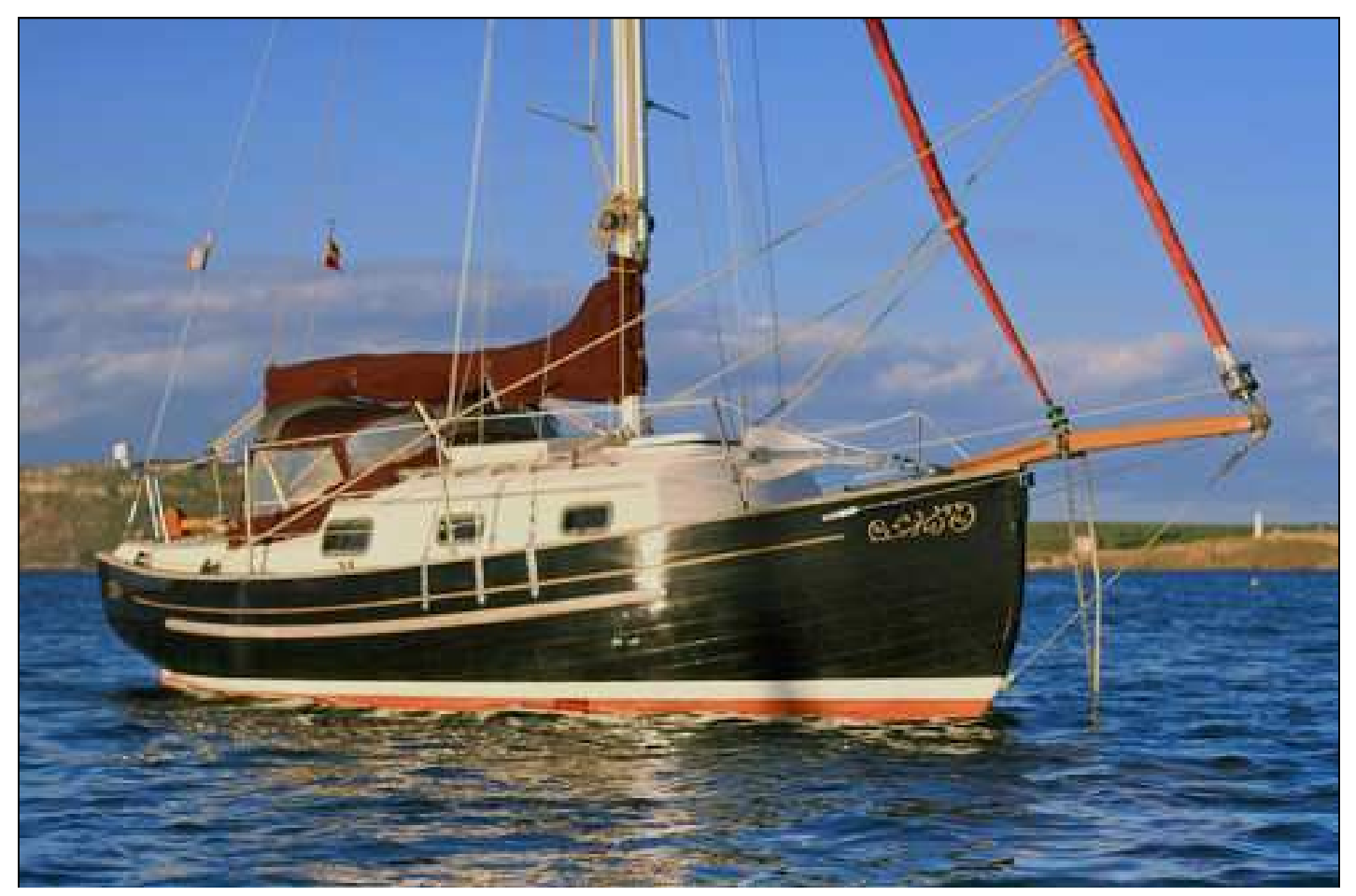
Flicka Caraway at anchor—Fornells Bays, Minorca

Behind me were years in small fishing boats gill-netting and lobster potting. I even knew roughly how to sail. I had done my homework on Caraway and I had a very experienced friend guiding me.