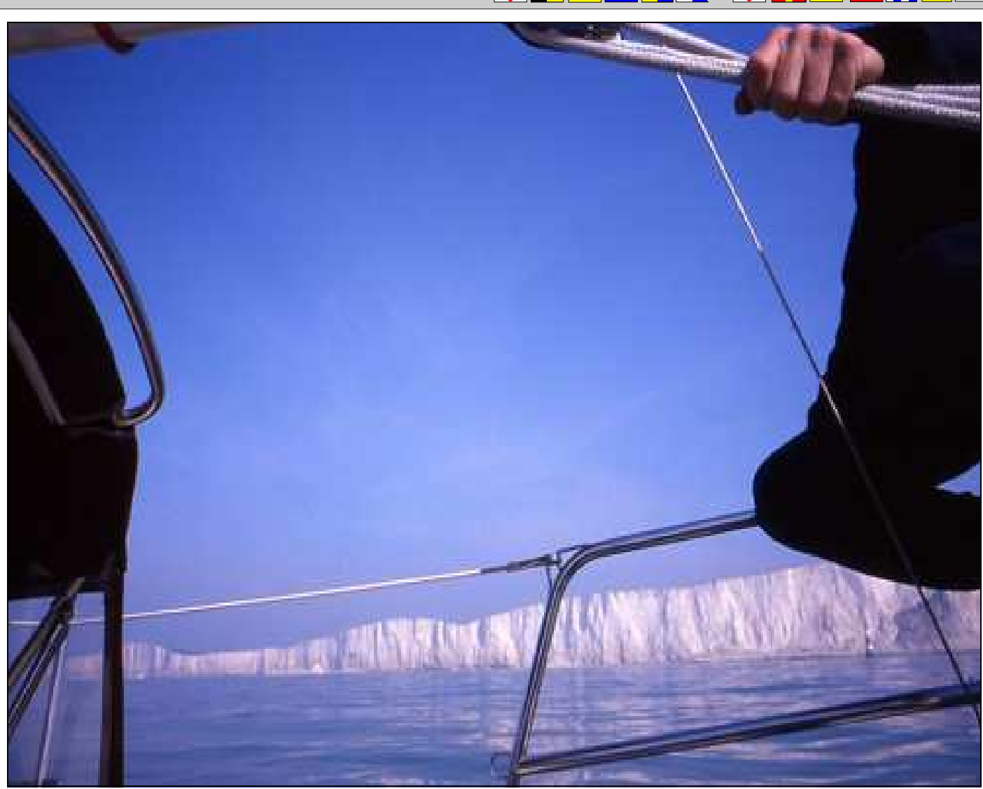
White cliffs of Dover on the way home to Chichester after buying Caraway in Burnham, 2002.

I have heard the Flicka compared to the Contessa 26 or Folkboat. But the Contessa is 6 feet longer which makes her a much bigger boat. Does anyone compare the Contessa 26 to the Contessa 32? No, because that would be silly. Get my point?