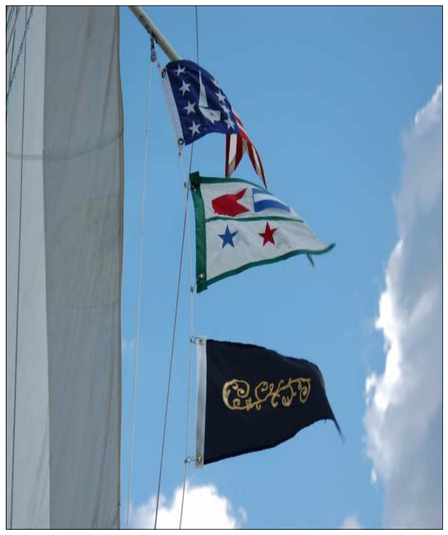
S/Y Elise—Flicka 420—Flying Flicka Burgee