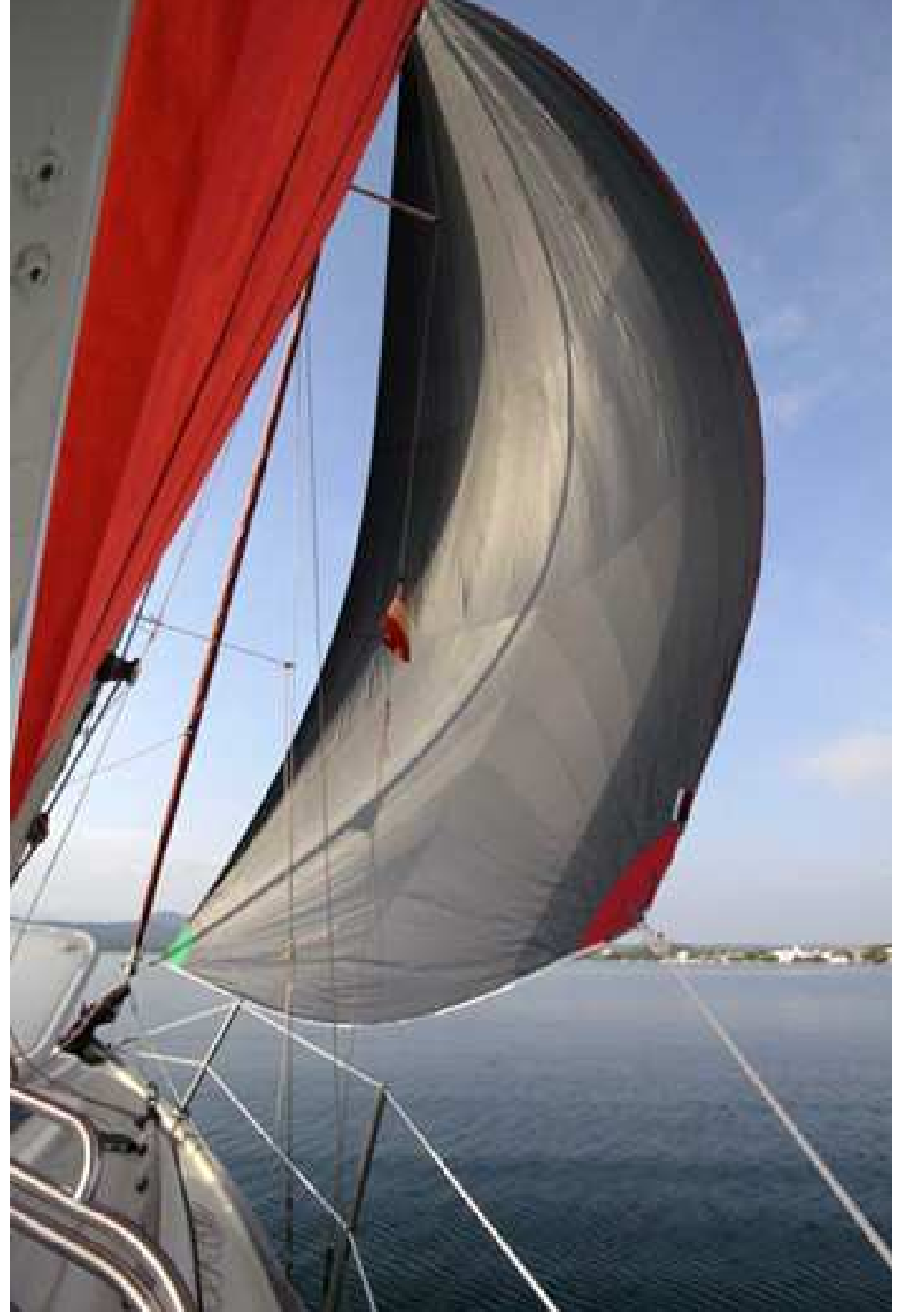
Why not buy a small boat and spend all that spare cash on a good set of sails and other quality items like high tech rope and latex cushions!

Well, let me make clear at the start of this reflection that I am talking about the Pacific Seacraft Flicka (PSC) and not just any Flicka. It's the PSC Flickas that created the reputation based on legendary PSC construction quality.