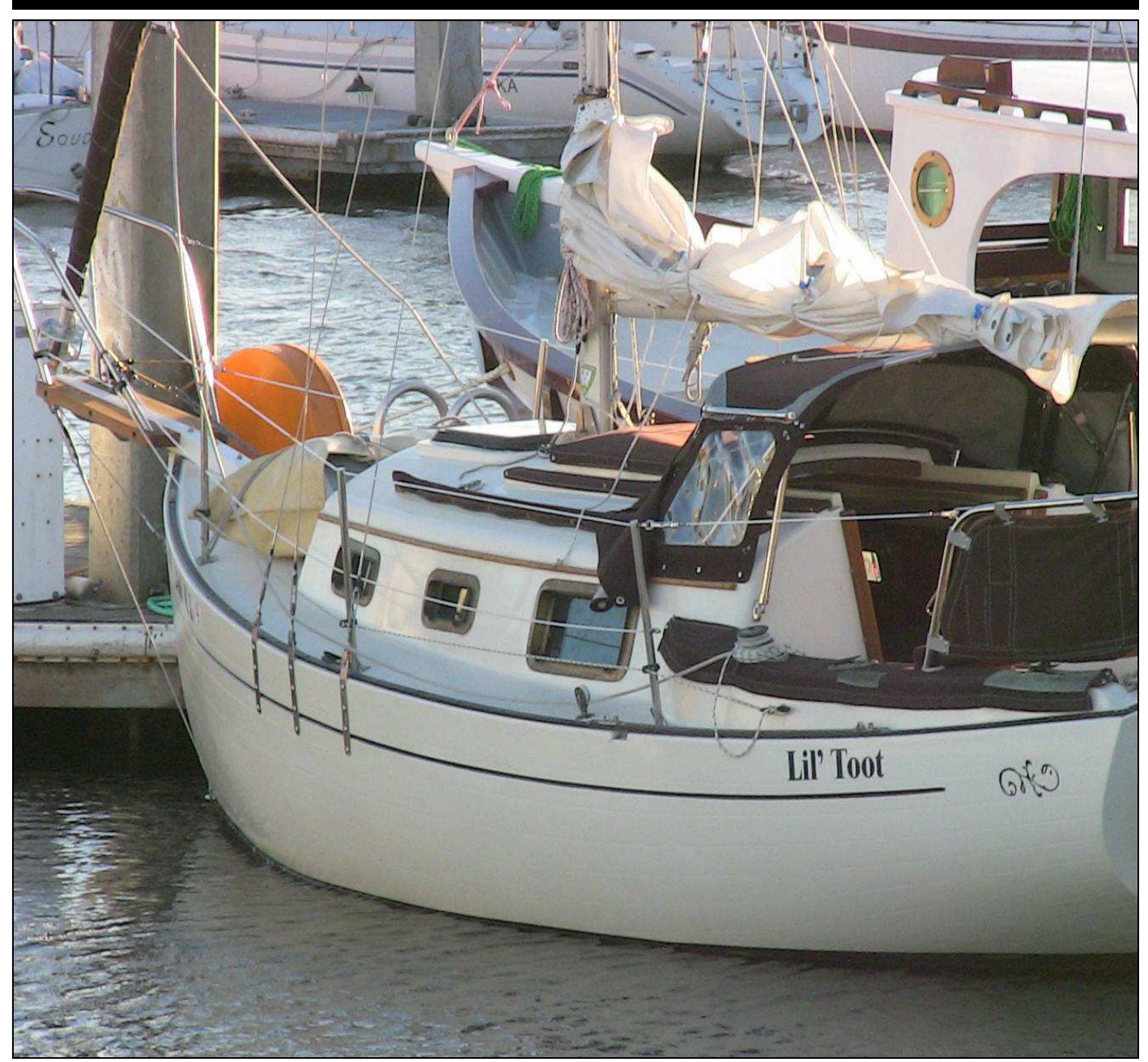
s/y Lil'Toot—Flicka #53 Docked in Half Moon Bay

hours at the helm and over 38 miles traveled. The Marina offered a very well protected harbor and a convenient stop for the night with several restaurants right at the dock.