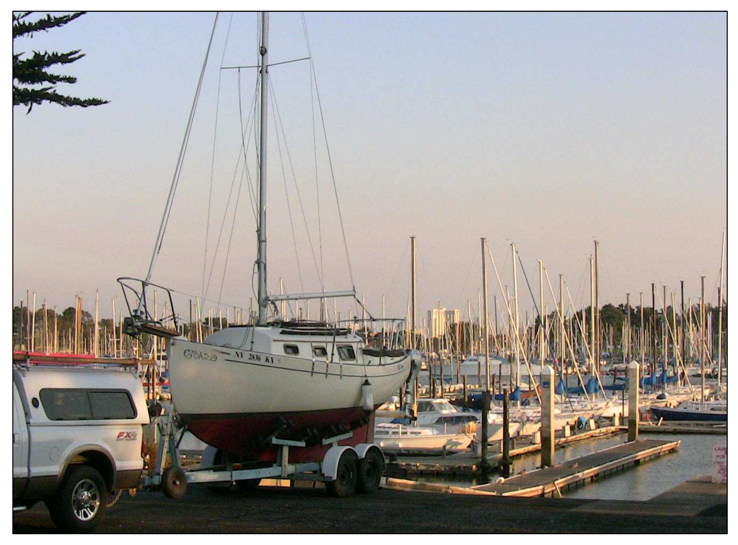
Launching s/y Lil'Toot—Flicka #53 at Berkley Marina

Launching by myself has never been much of a problem, until it comes to lifting that 95 pound outboard to its mounting bracket. Fortunately, the Flicka always draws attention wherever she goes and I was able to get a volunteer to help with the outboard. I use the bridal system to raise and lower the mast and a large cradle support that rests on the rear bumper of my truck to position the mast before raising it. The weather in Berkeley was perfect for a departure, but I needed to wait about a week to take care of some personal business. So I left Lil' Toot in very secure slip for a week.