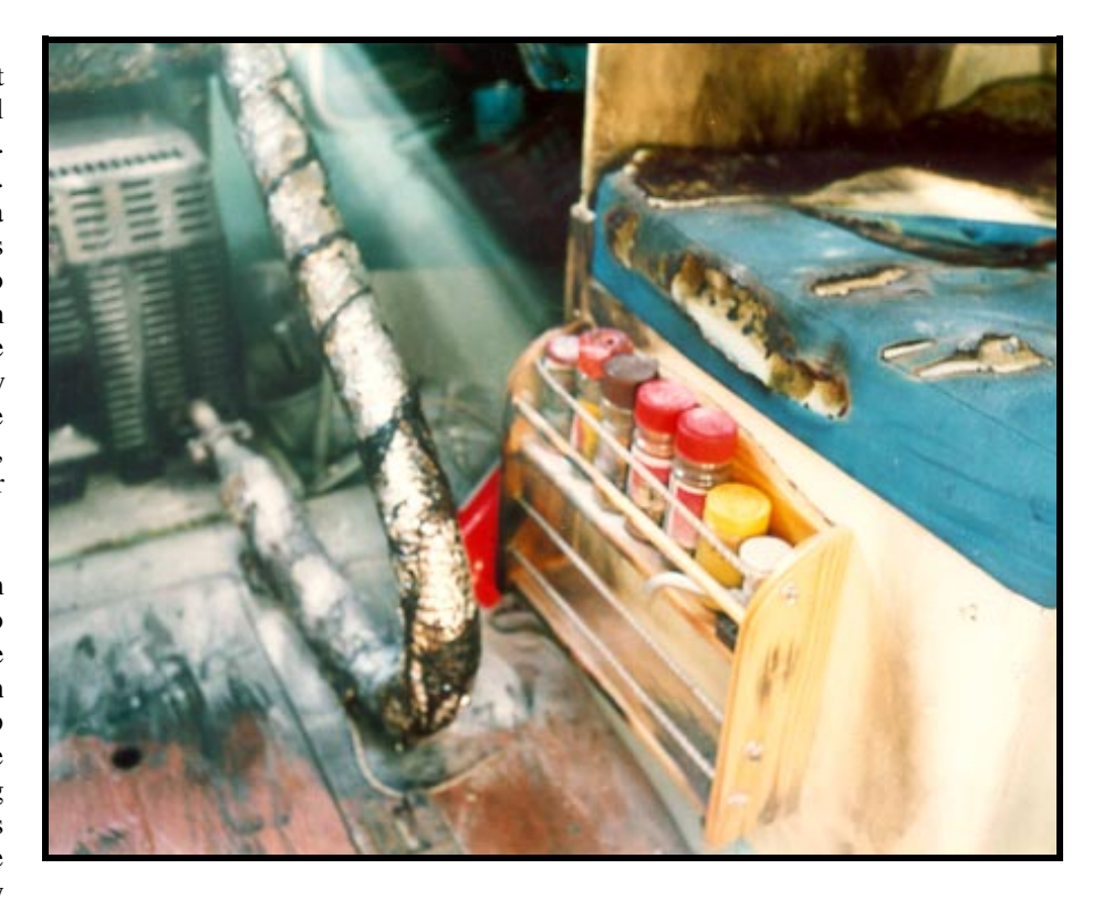
Fire and Smoke damage to the interior of Anthony Steward's Durban Built Flicka - s/v SELECTED RISKS

The easterly prevailed with a maximum of 25 knots. The Flicka revelled in these conditions even though fully laden.