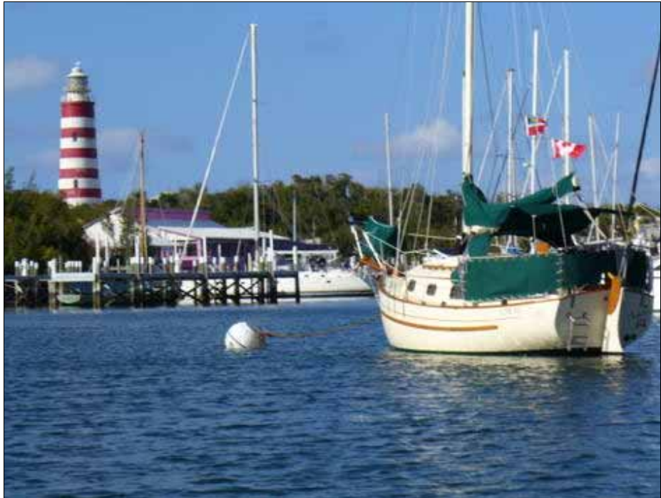
The lighthouse at Hope Town can be seen for miles.

The Hope Town lighthouse can be seen for miles with its red and white stripes towering over one hundred feet. The entrance to this well protected harbour is properly marked. Once inside, you are treated to one of the most magical places I have had the pleasure of exploring. It is small with no real anchoring available. An abundance of mooring balls are to be had at $15 per night.