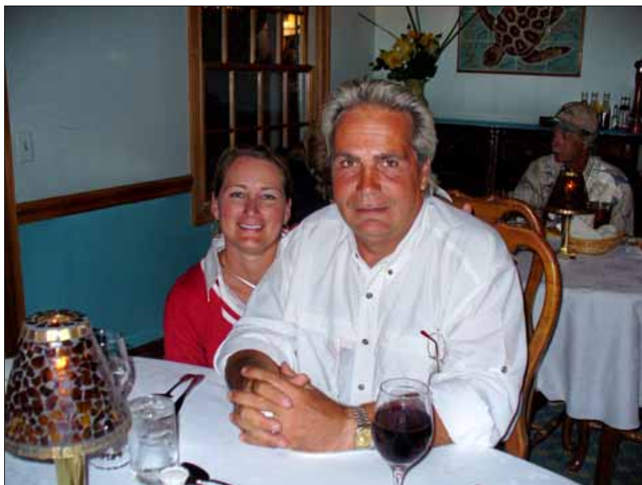
Enjoying my fiftieth birthday at the Green Turtle Club.