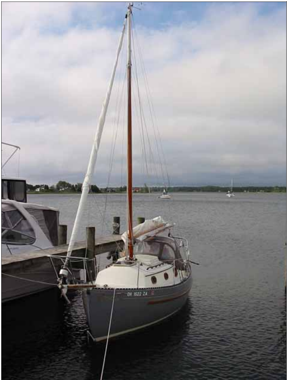
BEN MAIN, Jr. docked at the Beaver Island Marina.