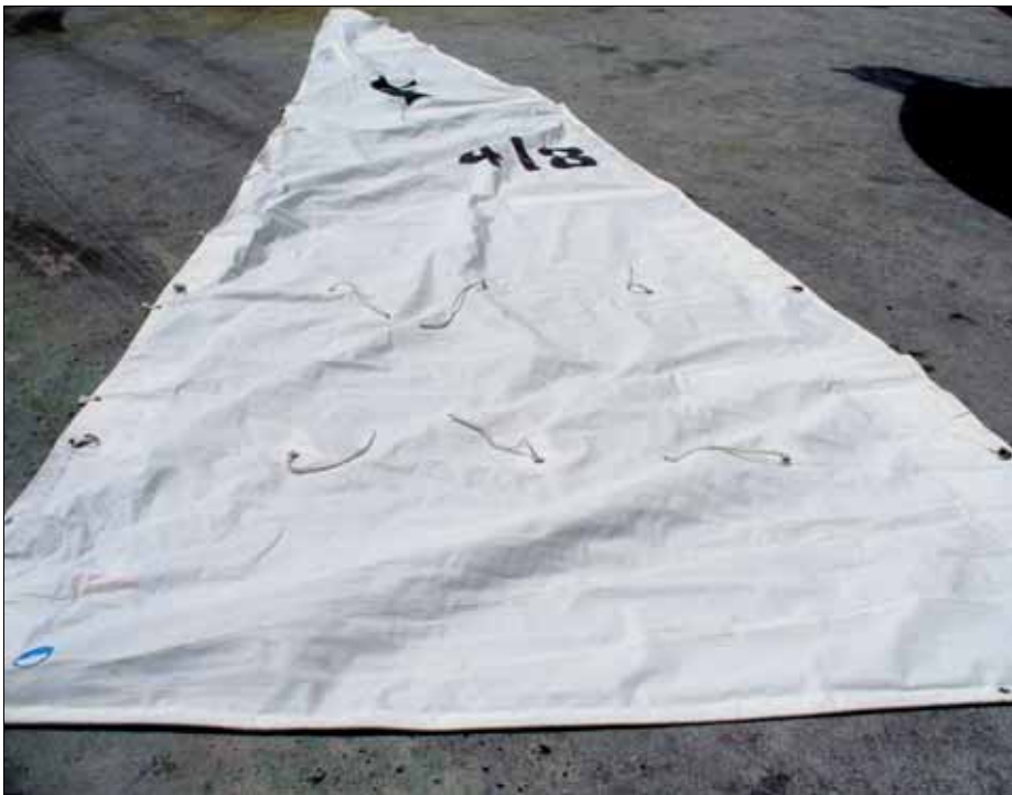
Each sail was cleaned to remove salt and dried in the sun.