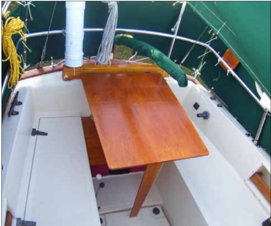
A table converts the cockpit into a dining room.