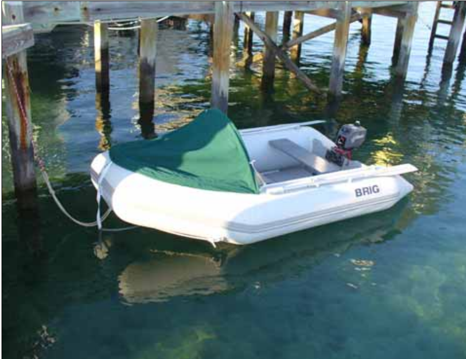
My dodger for the new dinghy.