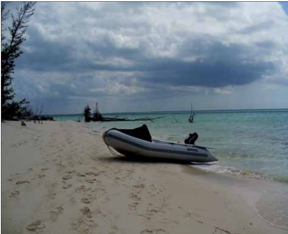
Exploring Manjack with the new dinghy and engine.

The vegetation took a bad hit that year as the last hurricane blew salt water across the island but had very little rain with it to wash off the salt. It was nice to see things so vibrant again. We snorkeled the two wrecks in the bay and I put two rays up without realizing I had swam over them. After the crocodile hunter’s death, it felt a bit uneasy to say the least. There were two more in a short distance, but we gave them a wide berth as we swam around.