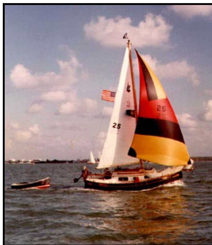
s/v SABRINA on a beam reach with a Trinkia dinghy.

Flicka was chosen as the design's name, because it seemed to reflect the personality of the boat. The word is Swedish; it translates as a happy, vivacious little girl.