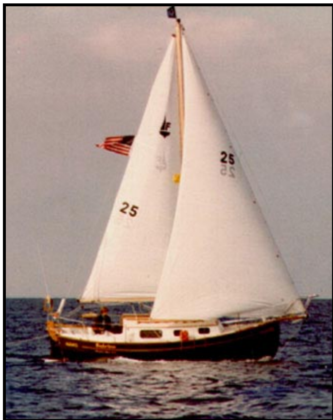
s/v SABRINA sailing beam to weather.

pressures kept us from finishing the work, however, so the plug was sold to a group of builders in Santa Barbara, CA. Unfortunately for the Flicka, they were bankrupt within a year.