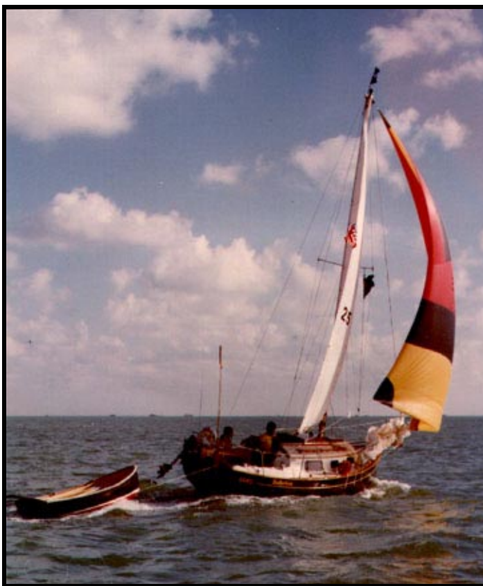
s/v SABRINA on a broad reach with a Trinkia dinghy in tow.

In practice, we've found both the deck and cabin top quite comfortable to walk around on, particularly when the boat is heeled.