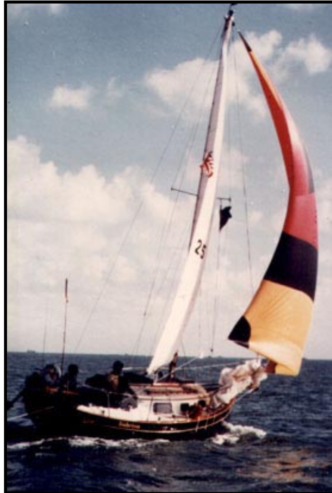
Bruce Bingham sailing s/v SABRINA on a Quarter broad reach.

My curiosity was aroused. Farther up the river, I was lucky enough to find a couple of old lobstermen who could tell me more about my discovery. They said the boats were all that were left of a fleet of over 100 that had sailed out of Wickford, Jamestown, Point Judith and Newport around the turn of the century. Newport boats were used primarily to tend lobster pots on Block Island Sound. A few had been fitted with engines and were still operating during the 1930's.