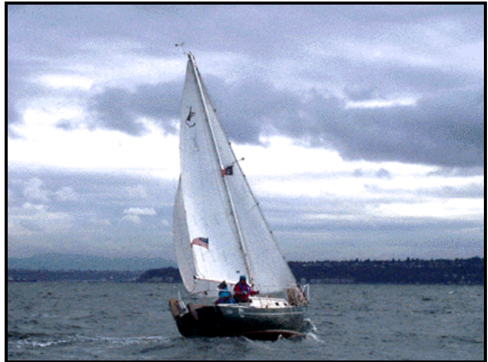
1983 Pacific Seacraft Flicka s/v KIRI, Hull #241 Home Port; Shilshole Bay Marina, Seattle, Washington

The key to working a Flicka to weather in winds equal to or greater than 20 knots is to set enough canvas aloft so she heels to 20 degrees. As she heels,