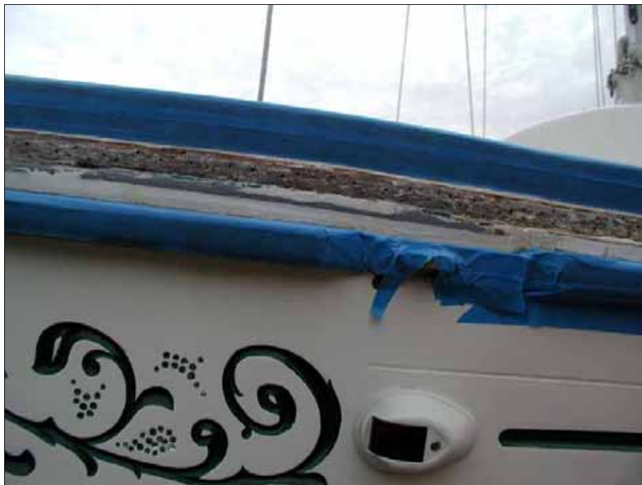
Another unexpected project. Fiberglass was missing over port bow area.

With aging, duct-taped mainsail and staysail, we learned how to make her move in the lightest of winds. By the third summer we'd found other Flicka owners and would join in on weekend rendezvous where others wondered how we got her to move so fast with such sad, undersized sails. I recommend everyone learn to sail this way.