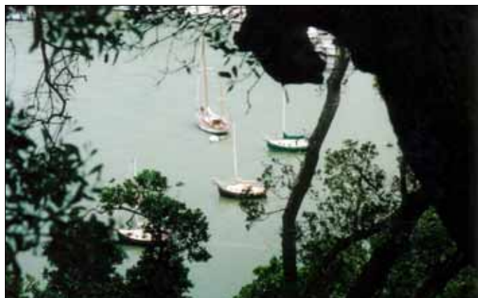
Intrepid hikers had another view of the harbor.