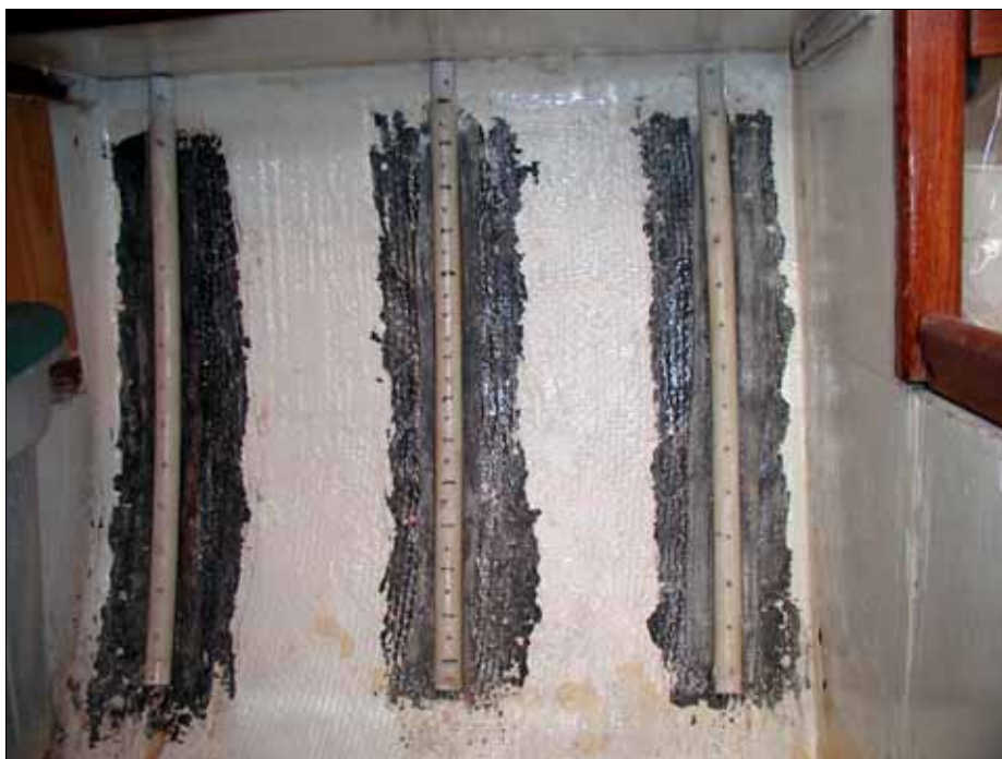
Quarterberth wood ceiling. Scrape off old paint, fiberglass, drill wood in place, remove, paint, varnish wood and reinstall.