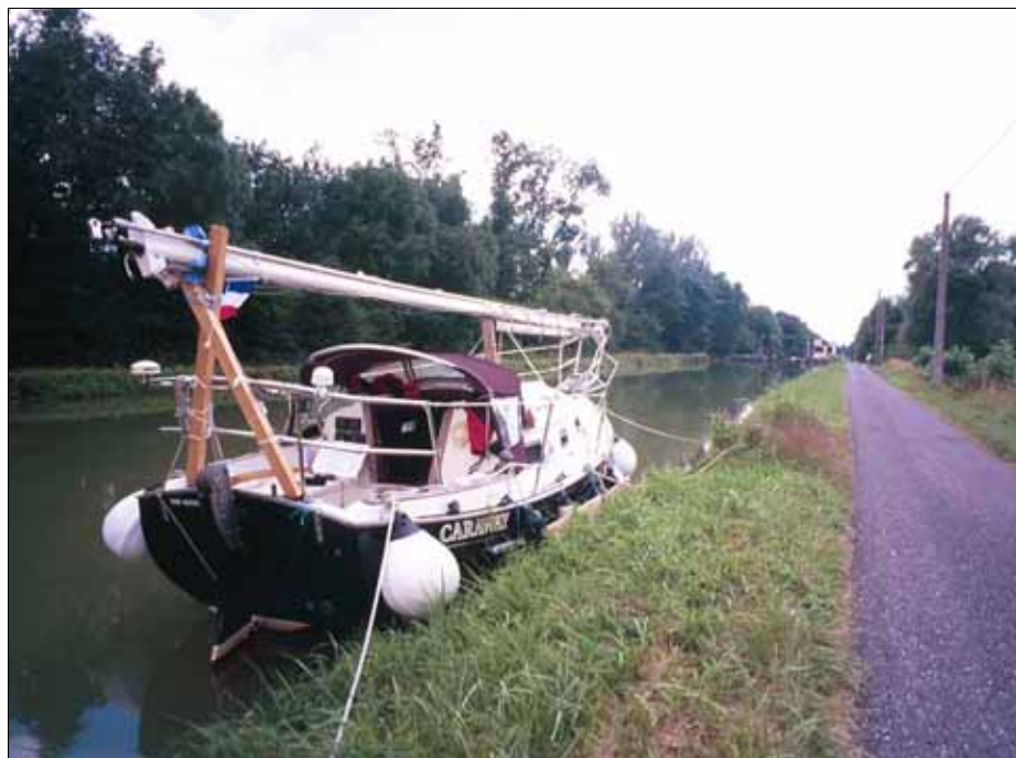
With the locks shut down after 4:00 PM, stopping was as simple as pulling along the side of the canals

Maximum craft dimensions through France from Channel to Med are: