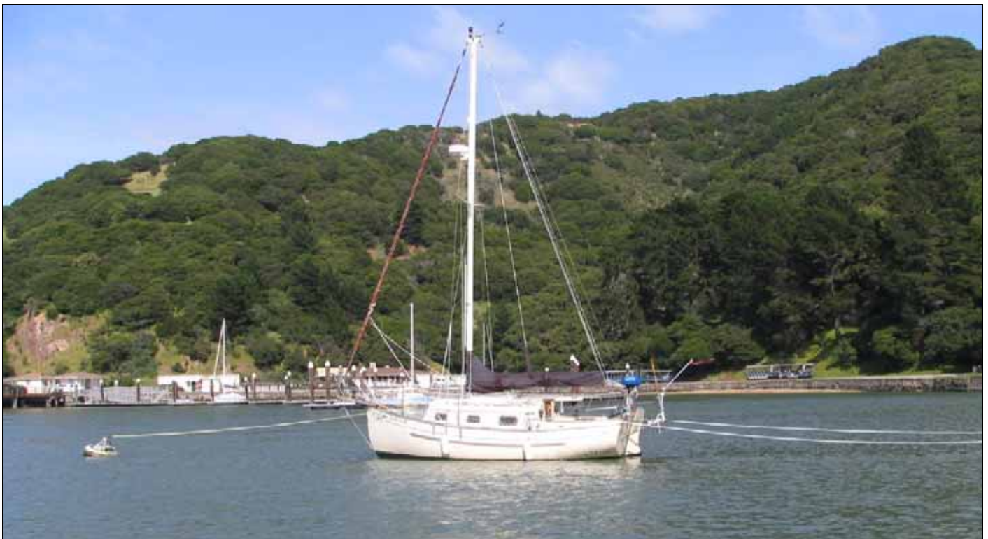
DULCINEA on a mooring at Angel Island.