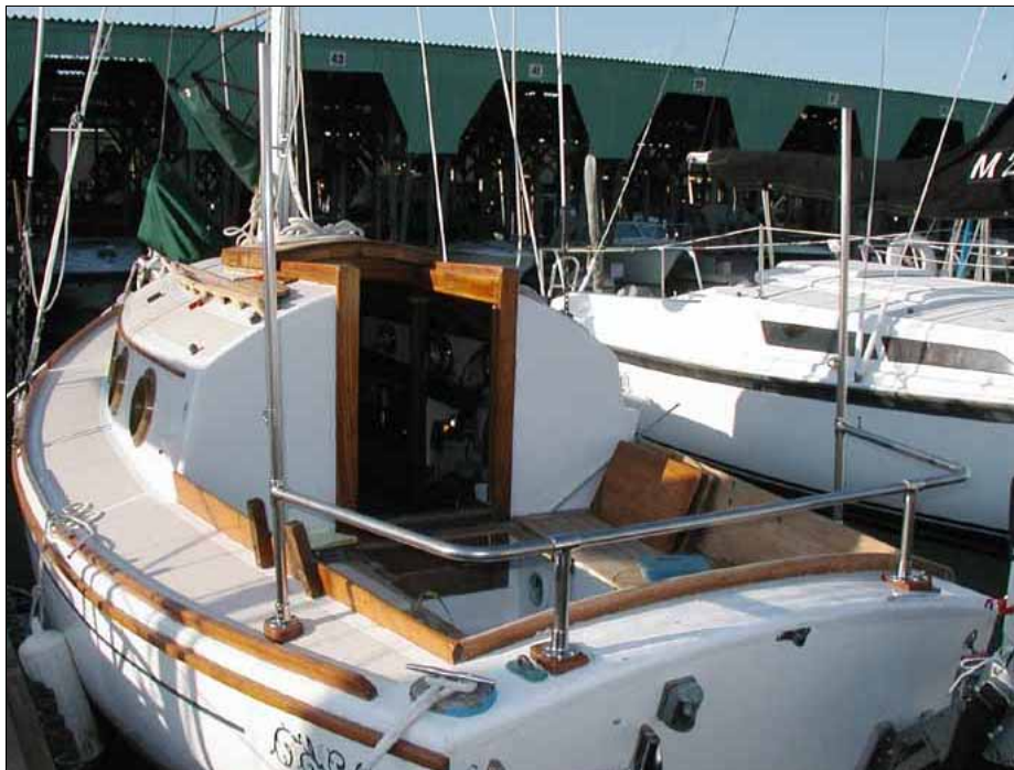
Just before we add the teak boom gallows. One of the best additions for offshore.