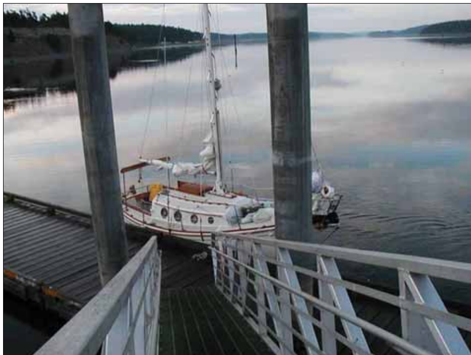
Ready to see the world-Fort Flagler, WA.