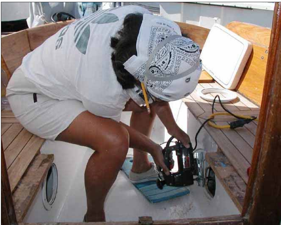
A second port was added for ventilation and lighting to the quarterberth area.