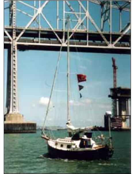
HOTSPUR on the way to the Flicka Rendezvous. Will the mast fit under the Bay Bridge?