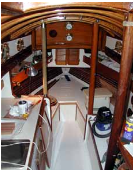
Beaded paneling, wood ceiling, new galley, removable hinged table...she'll never look this good again!