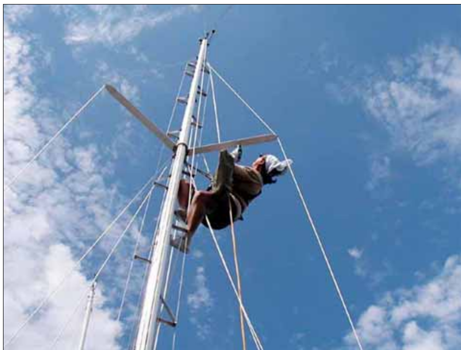
This harness system allowed us to drill at odd angles. Second tether was looped thru mast steps as backup to halyard breaking.