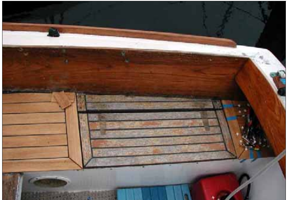
This time 1/4" teak over 1/2" marine ply as we rebuild the entire cockpit seating.