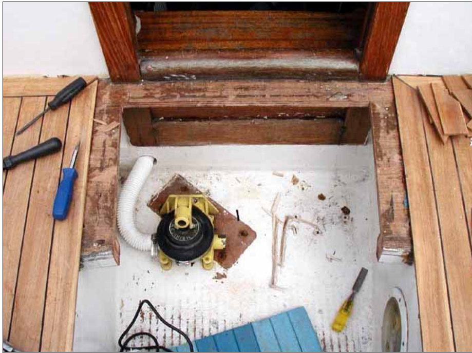
We modified bridge deck from solid to hinged for easier access to Whale Gusher and spare gas tank.