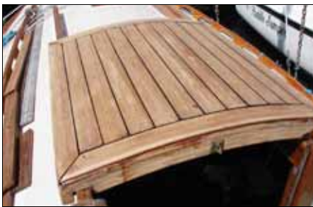
Real teak this time. Epoxied and held in place with copper nails.