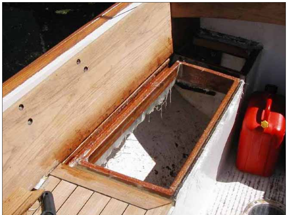
Deb designed (courtesy of endless administrative meetings) and built the missing lazarette drain system. Teak coamings get a much needed sanding.