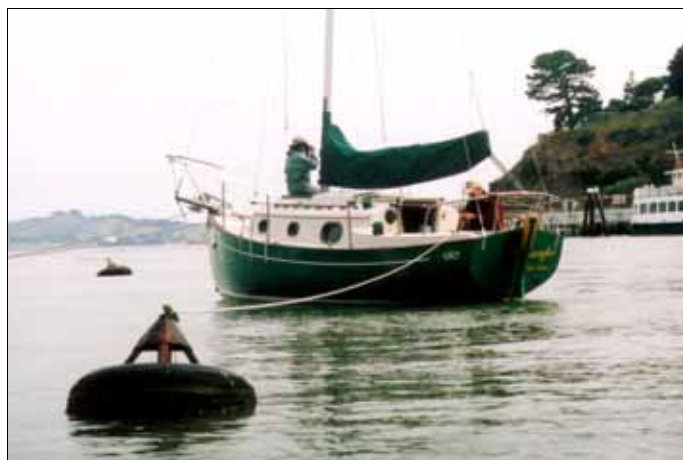
ESCAPE on an Angel Island mooring.