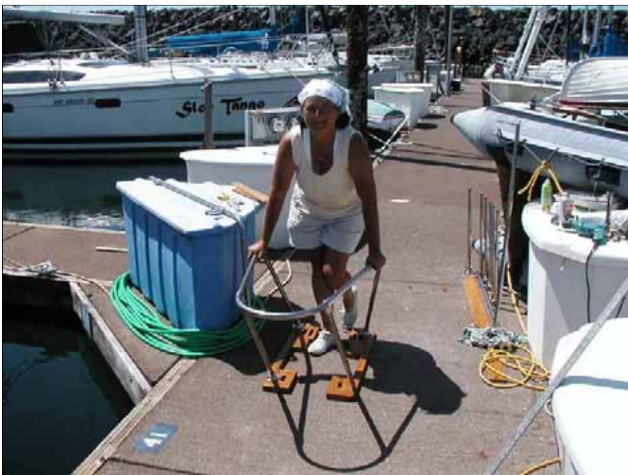
Scrap stainless steel was bent to Deb's design. The use of 'T' fittings ended up being expensive and not as shipshape as welding.

What follows is the stem to stern list of projects eventually completed, but not exactly before we left. Almost all items were designed, made or installed by us. Most materials were gathered from every metal scrap yard and second hand marine store in the greater Puget Sound area.