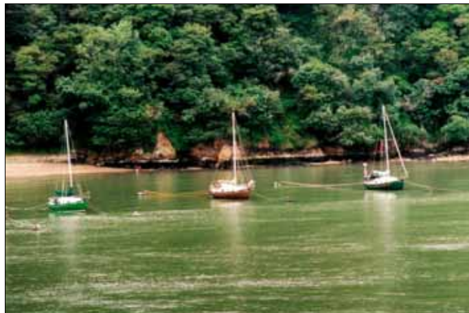
ESCAPE, DREAM CATCHER and HOTSPUR.