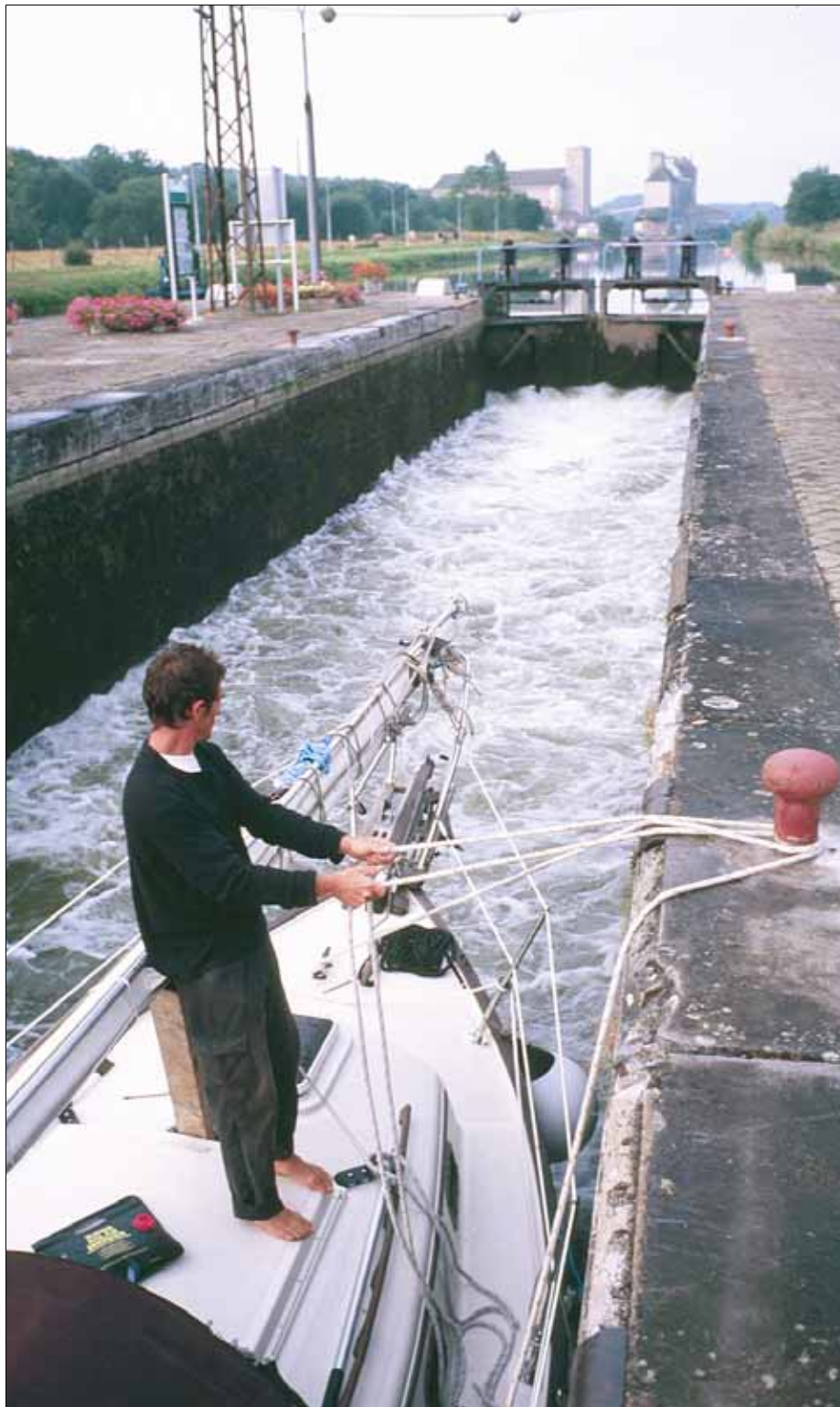
Locking through one of the many locks aboard s/y CARAWAY.