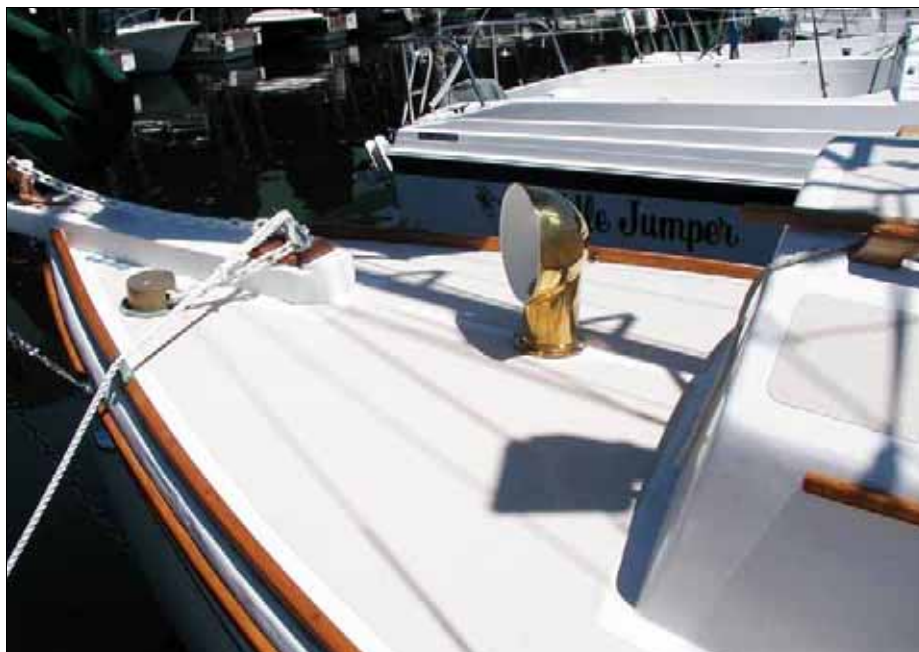
Chain plate led to bucket below. Deck plate sealed it at sea. In San Diego we added manual windlass and had to add second chain plate on starboard side of bowsprit.

The first hole for Number 4 resulted in wood 'pudding' oozing out. That newly birthed project then resulted in the unplanned results of infusing acetone into the plywood on the outside when there was no one in the inside to point out that the newly revarnished six coats on the interior mahogany did not seem to be reacting well to numerous rivulets of acetone. Which led to the total removal of the varnish on the port side. You get the picture.