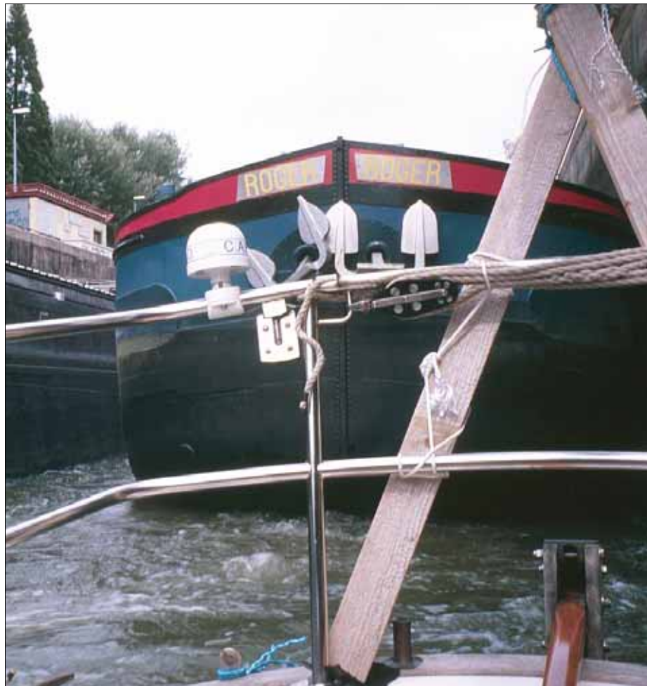
Locking through with two large barges including the "ROGER."