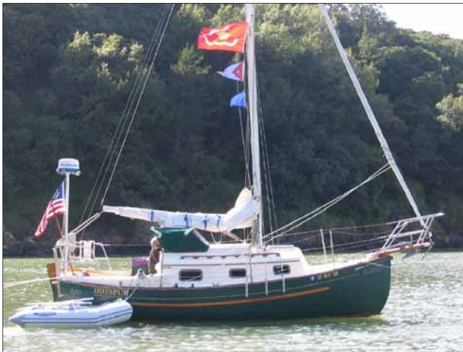
Hotspur on a mooring at Angel Island.