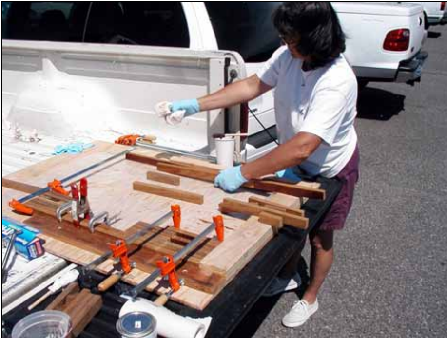
Once house was sold, the marina parking lot and the back of 'Bob' became our workshop. Bowsprit cheeks under construction.