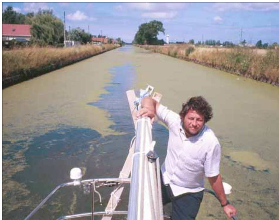
The water was cleaner away from towns and cities.

All you need is a license (vignette) from the VNF that can be bought from France Afloat by post or at a VNF office in France. It costs about £70 Sterling and lasts for a year. That means you can live on your boat in the canals very cheaply. There are some places that have free showers and electricity so you can really take your time. There are also several pleasure boat marinas where you can leave a boat safely and obtain all the usual amenities for a reasonable charge. But generally, one just finds a nice spot and moors up for the night. There are many retired couples from all over Europe who have spent months loafing on their boats some-