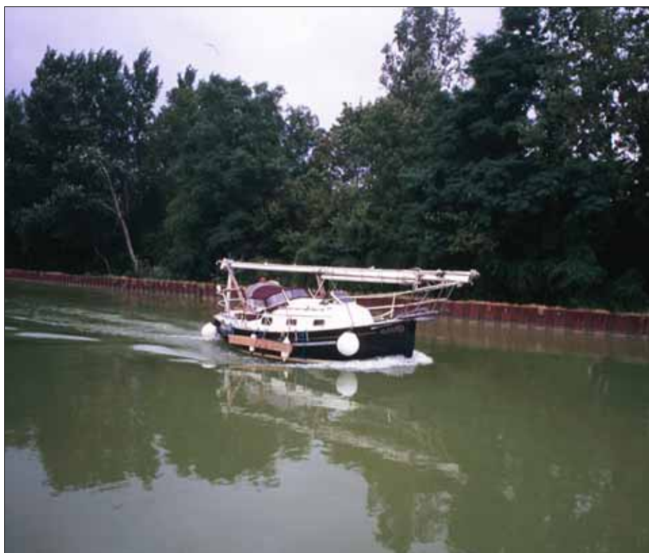
Large fenders and a board help protect s/y CARAWAY from the canal walls.