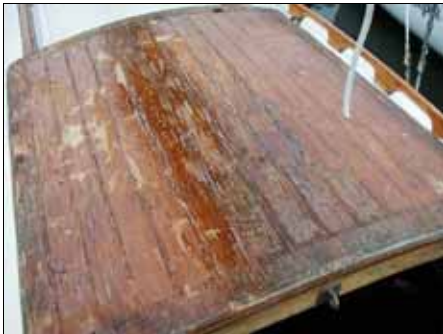
Old teak veneer ply (our first bad idea) was chiseled off.