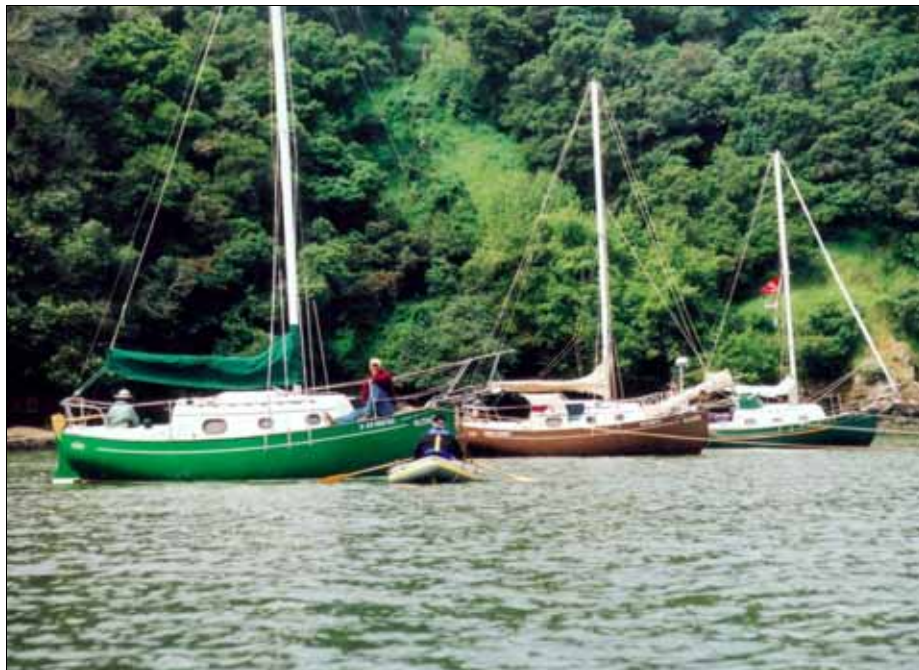
ESCAPE, DREAM CATCHER and HOTSPUR moored at Angel Island.

http://homepage.mac.com/ericjungemann/PhotoAlbum8.html