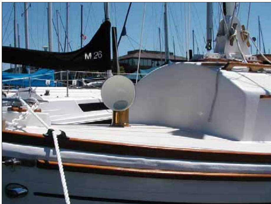
Our compromise to a hatch. We installed a low watt fan below to pull in cool air. Again deck plate sealed with silicone at sea.