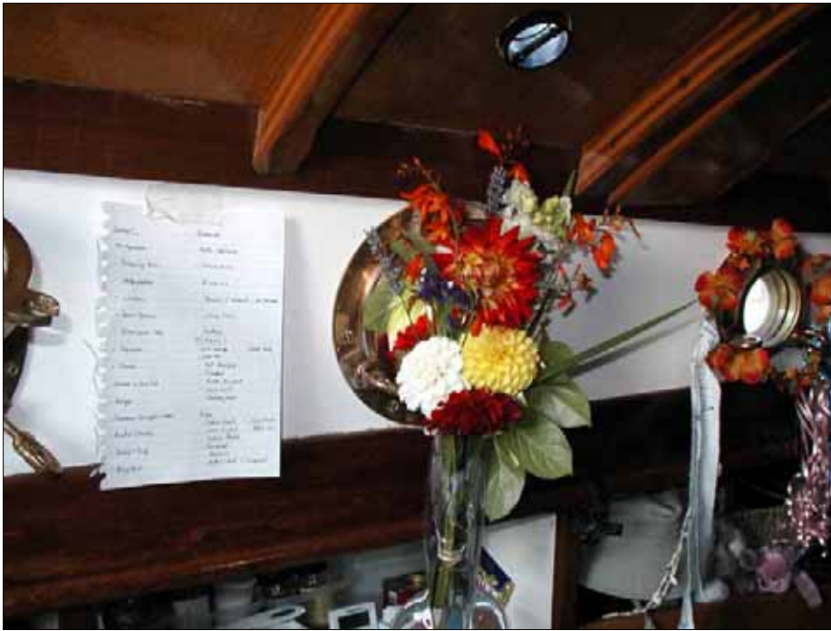
Our Final List. Without it we would never had accomplished it all in under six months.