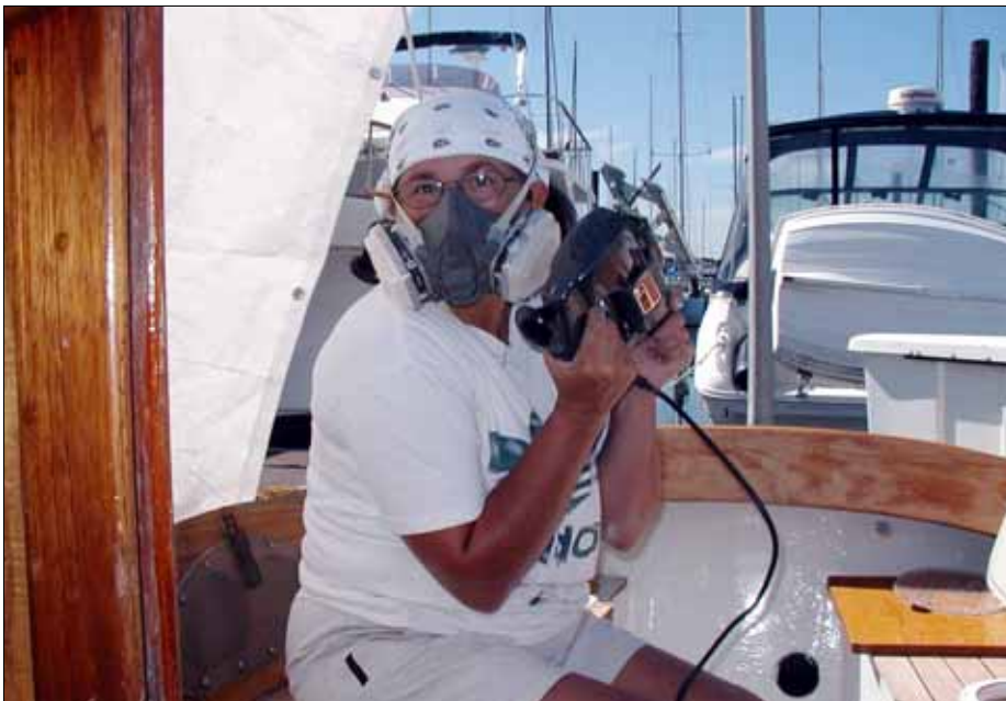
Using a true mask was worth the money for all of the fiberglass and epoxy work, especially below.