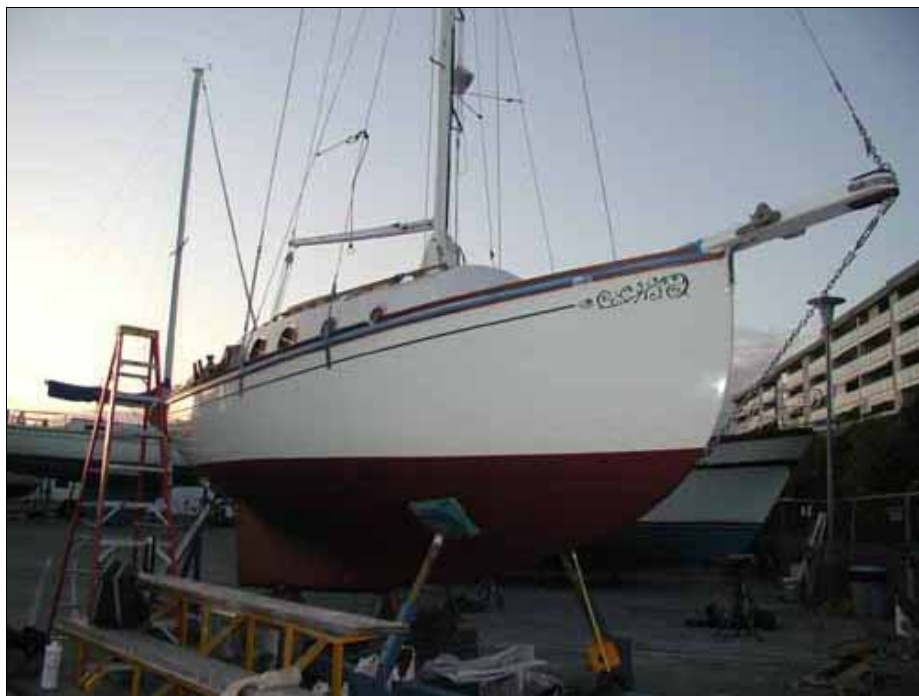
Spring Break Haulout. Still 'au naturel' with no stanchions or pulpits.

Hrai Roo was birthed by many dreams, but it was the hard work of a young