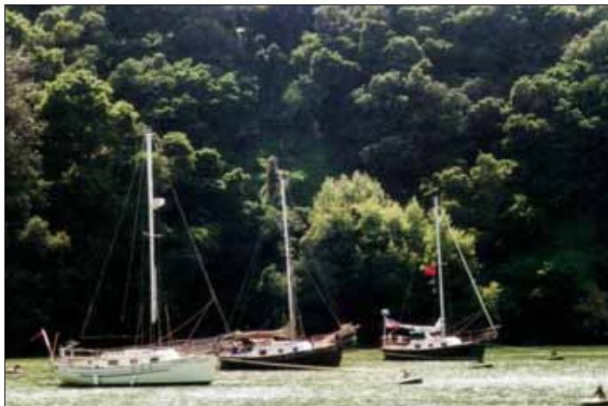
DULCINEA, DREAM CATCHER and HOTSPUR.