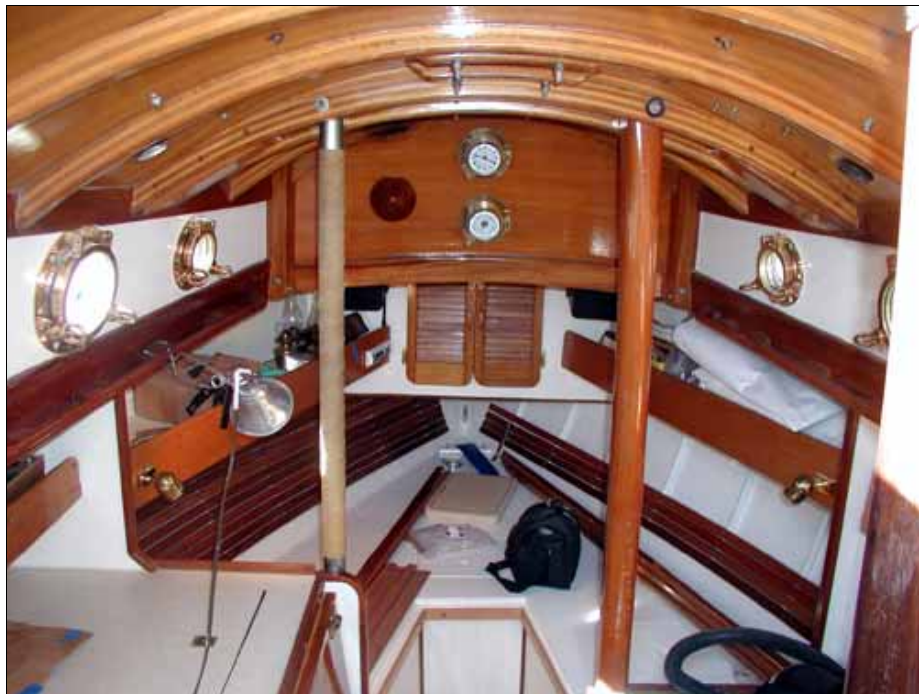
Rudder post and scrap mahogany poles were used in place of hanging knees in original build. Provided great handholds at sea.