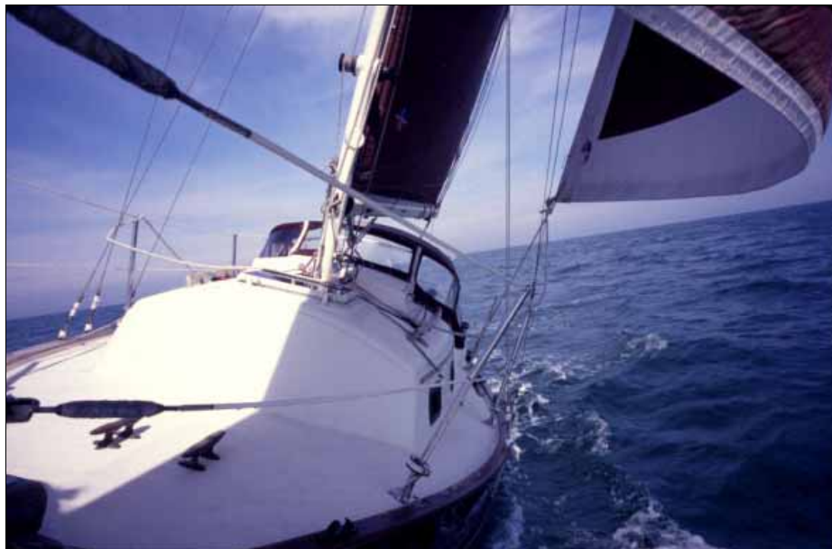
Crossing the English Channel aboard s/y CARAWAY.

The VNF website ( www.vnf.fr ) has recently been improved, and now offers much more timely and up to date information. The home page is switchable between French and English, although the English translations are occasionally eccentric.