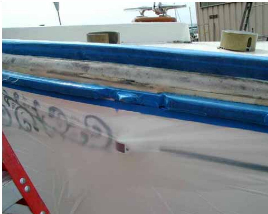
More drilling and acetone before refiberglassing area.