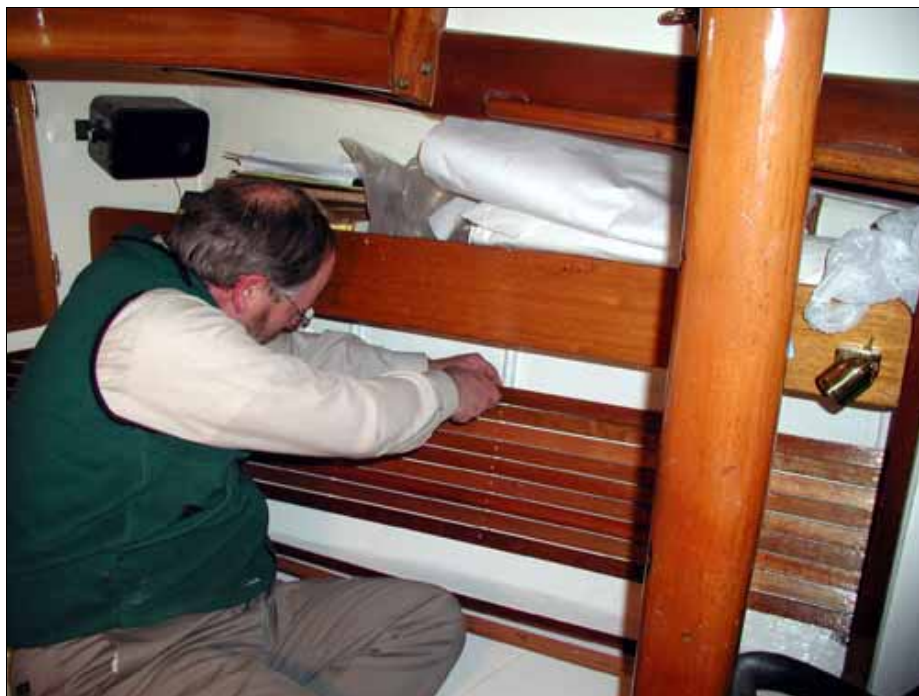
PVC, fiberglass, mahogany door stops, varnish and bronze wood screws...voila wood ceiling!