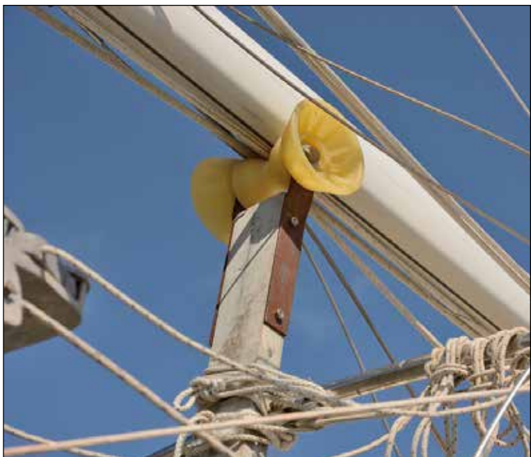
Detail of the aft mast support.