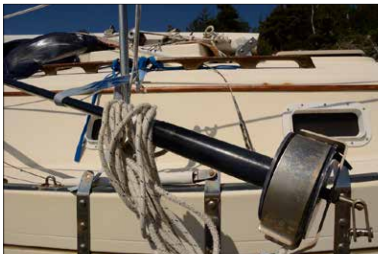
The furler is secure to prevent damaged during the process.