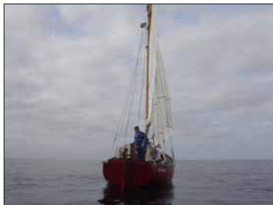
Out in the Pacific Ocean.