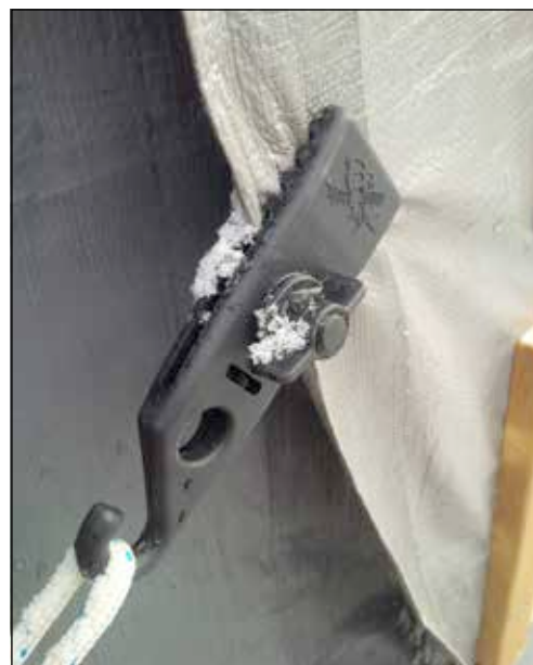
Plastic clips secure the tarp.