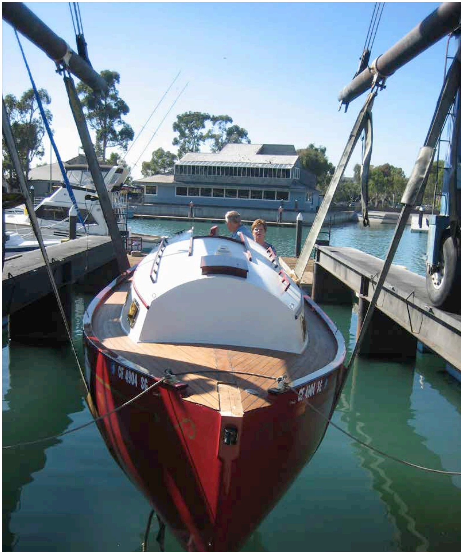
After eleven years of construction, s/y RED RASCAL is launched at Dana Point Shipyard.