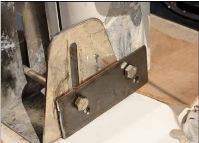
Two brackets are added to allow clearing the sea hood.