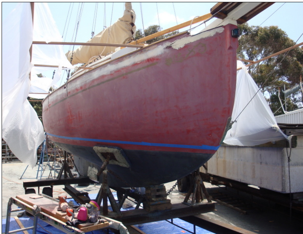
Adjusting the waterline four years after the initial launching.