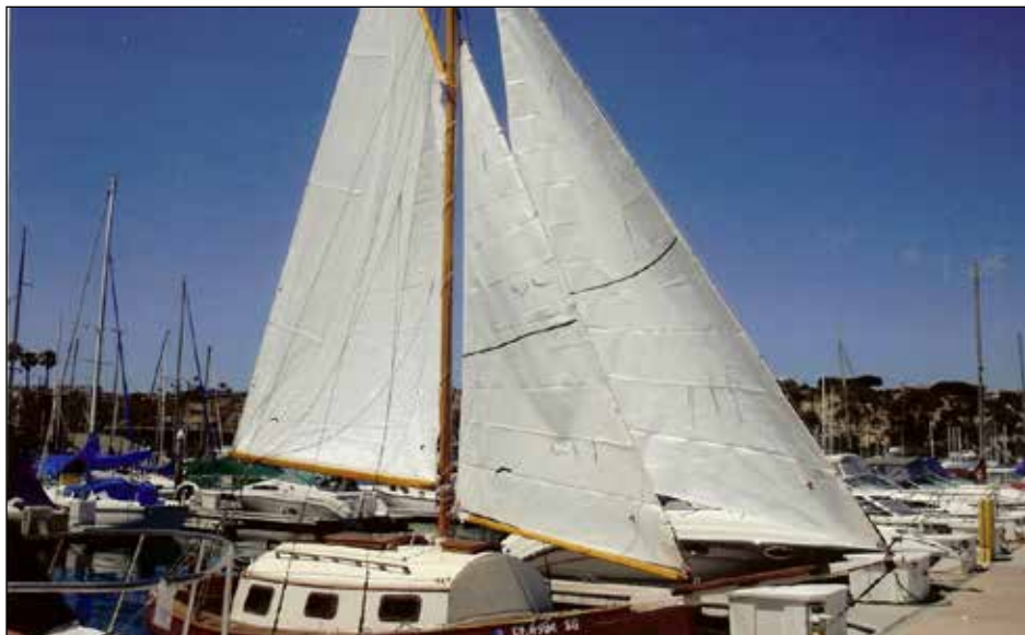
New sails for s/y RED RASCAL . Photo: Bob Collier © 2018