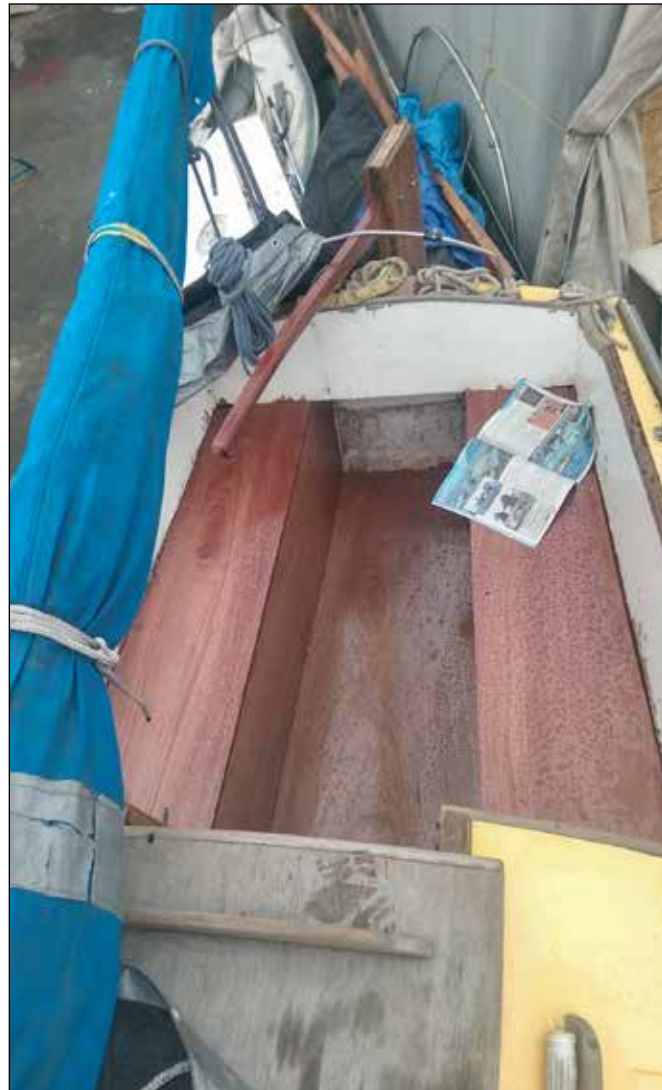
The finished cockpit of s/y GOLDFINCH .