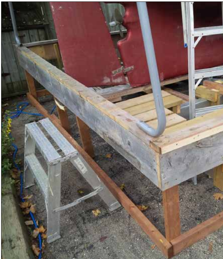
The supports are secured to the wooden framework.