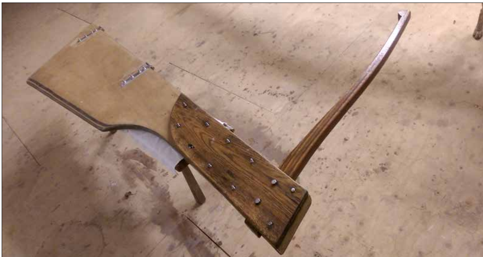
A new rudder for s/y GOLDFINCH .