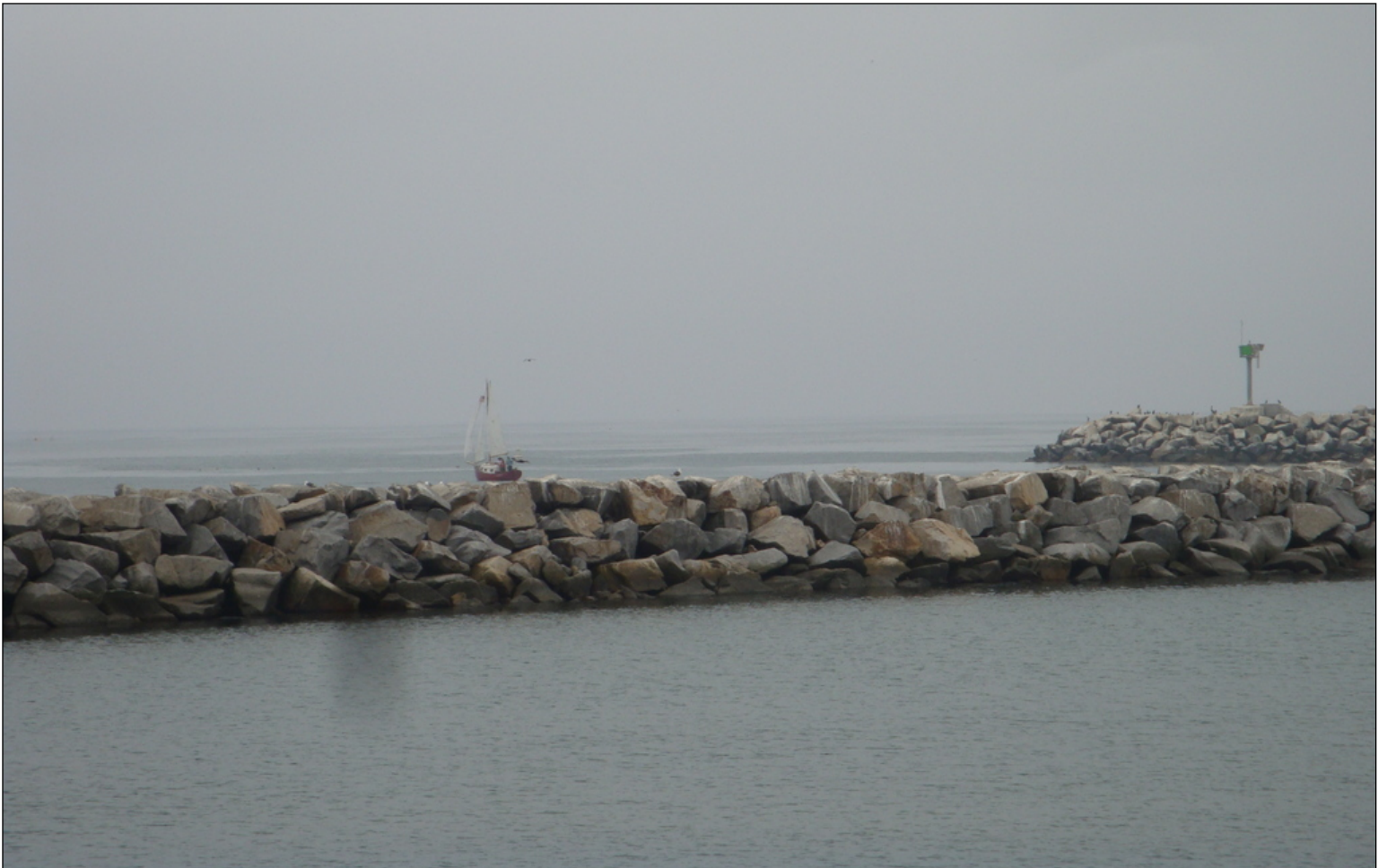
Sailing s/y RED RASCAL just outside the breakwall of Dana Point Marina.