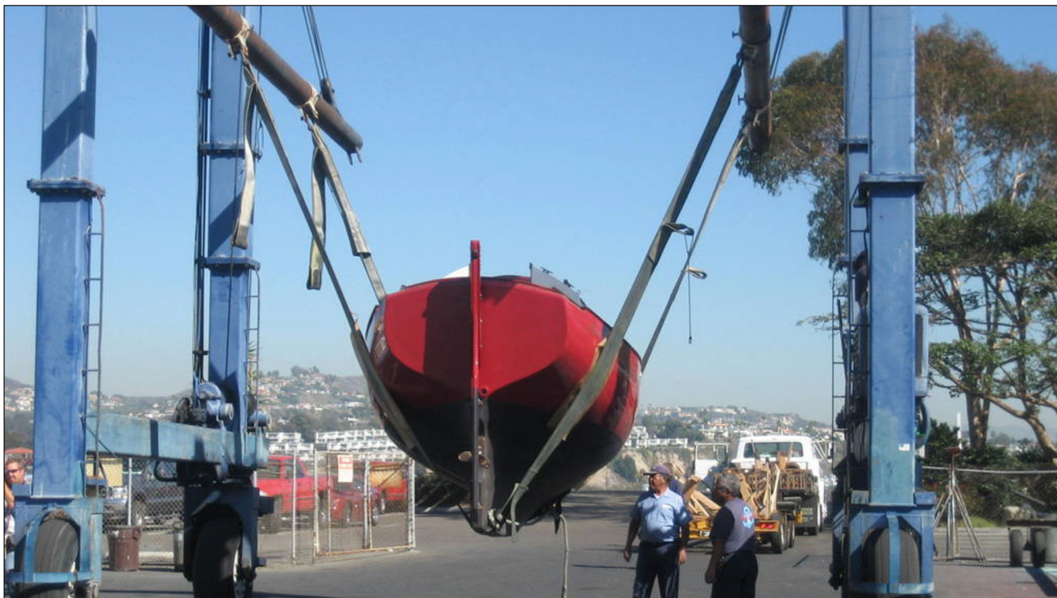
RED RASCAL hanging in the slings.