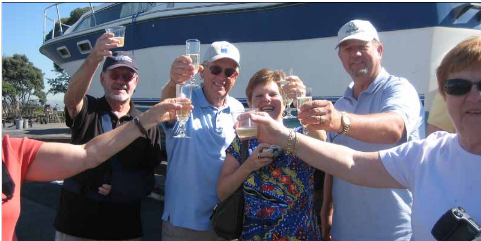
Toasting the christening of s/y RED RASCAL .