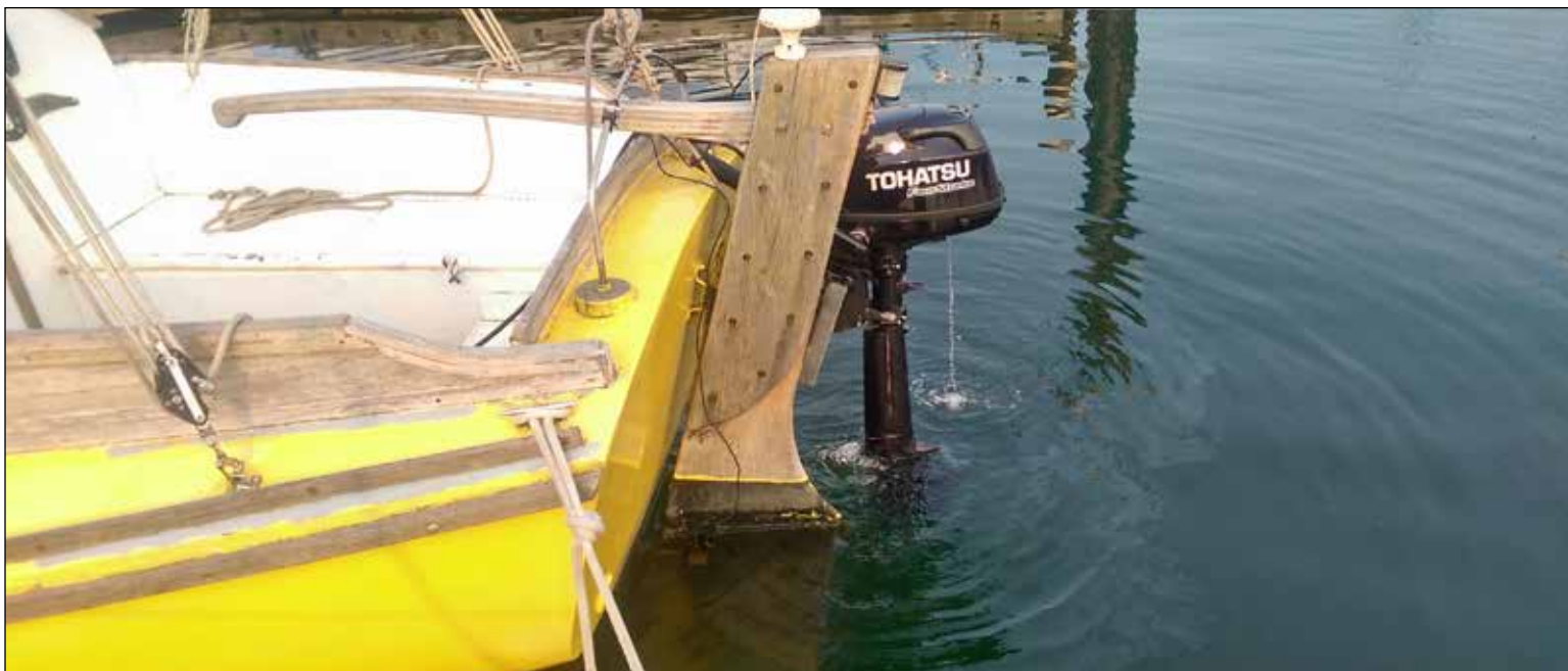
Outboard power for s/y GOLDFINCH .