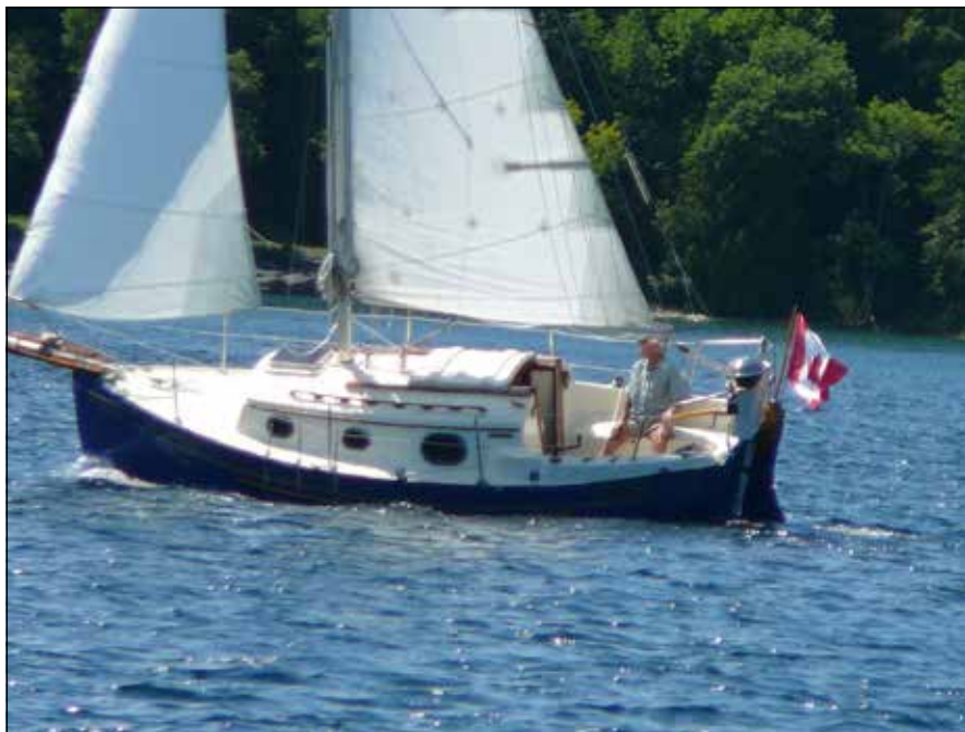
Sailing s/y 4ELSA on Colpoys Bay, July 2017.