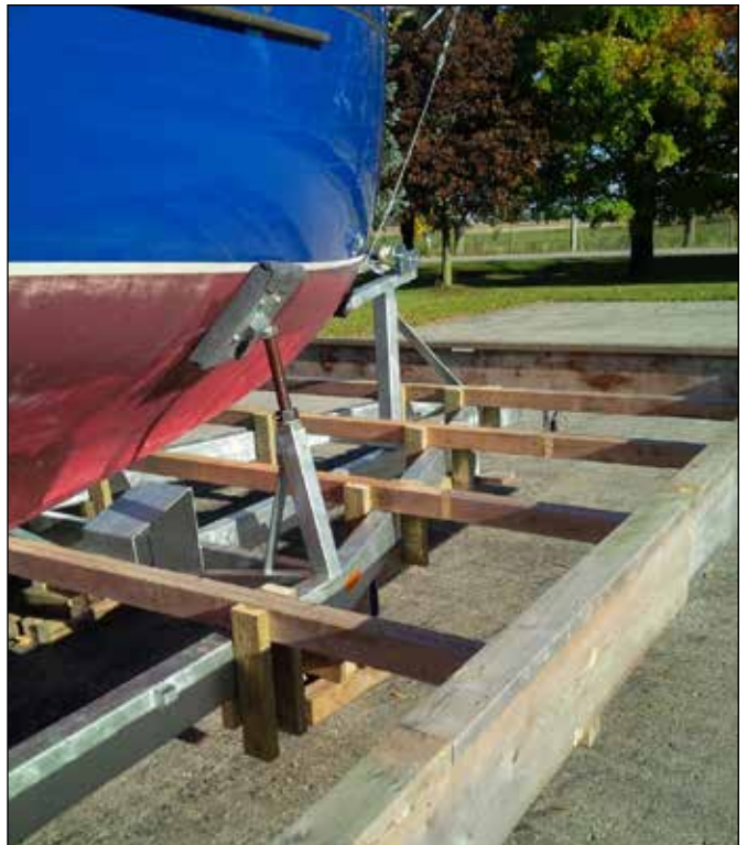
A detail photo of the trailer cross members.