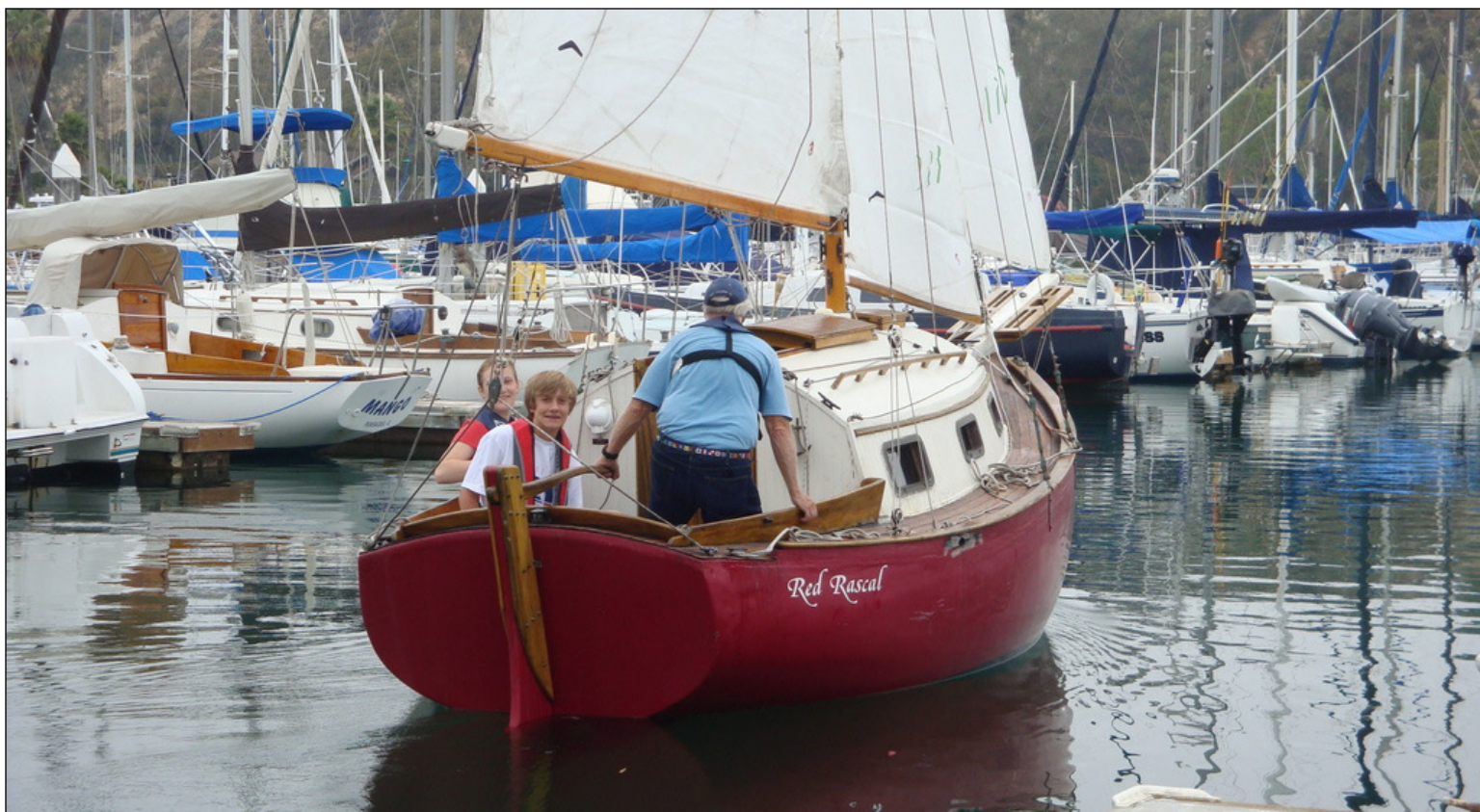
Having just completed a sailing course at home, they wanted to sail on "Grampa's boat."