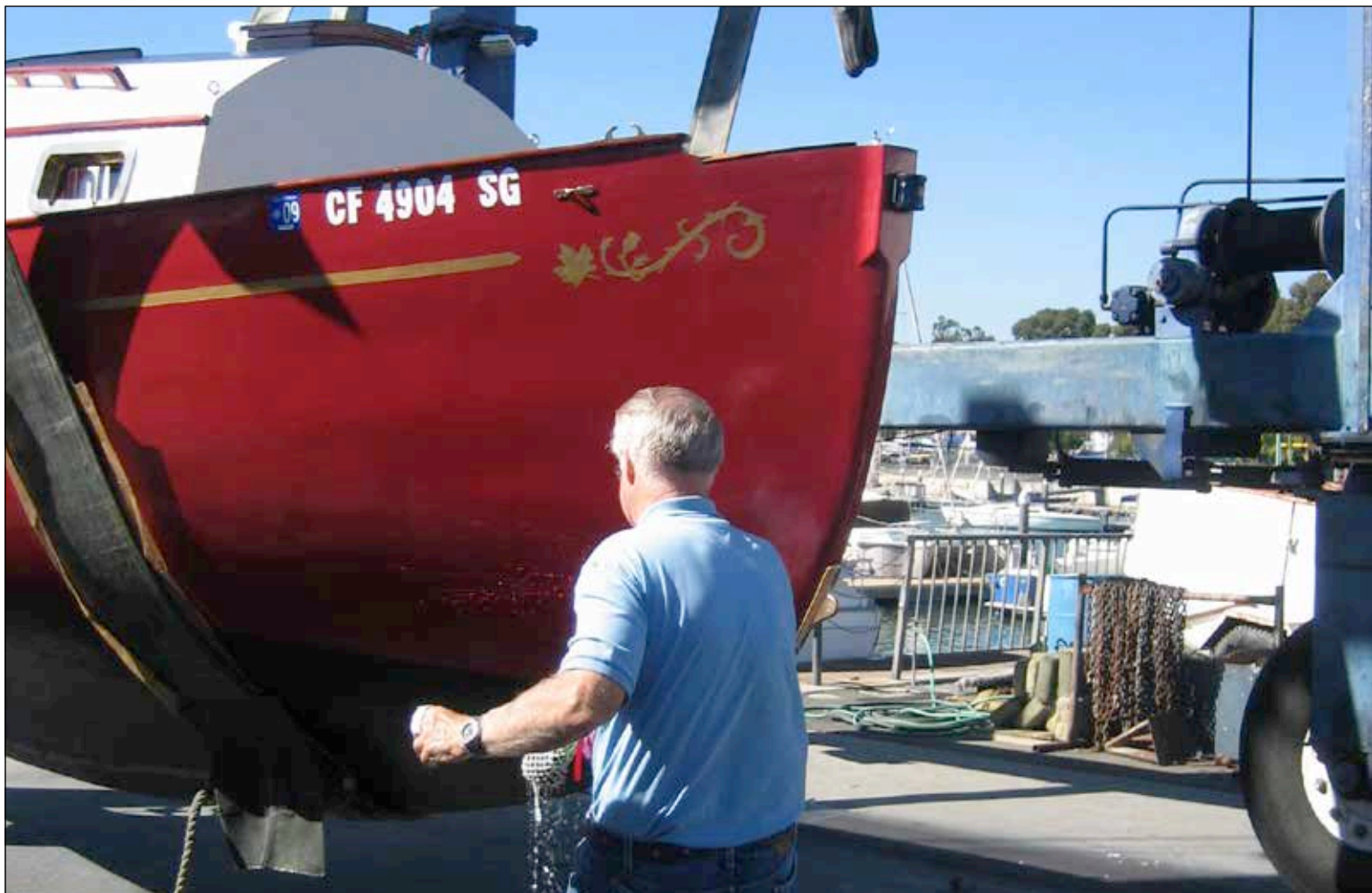
“In honor of my wife, I christen thee RED RASCAL! ”