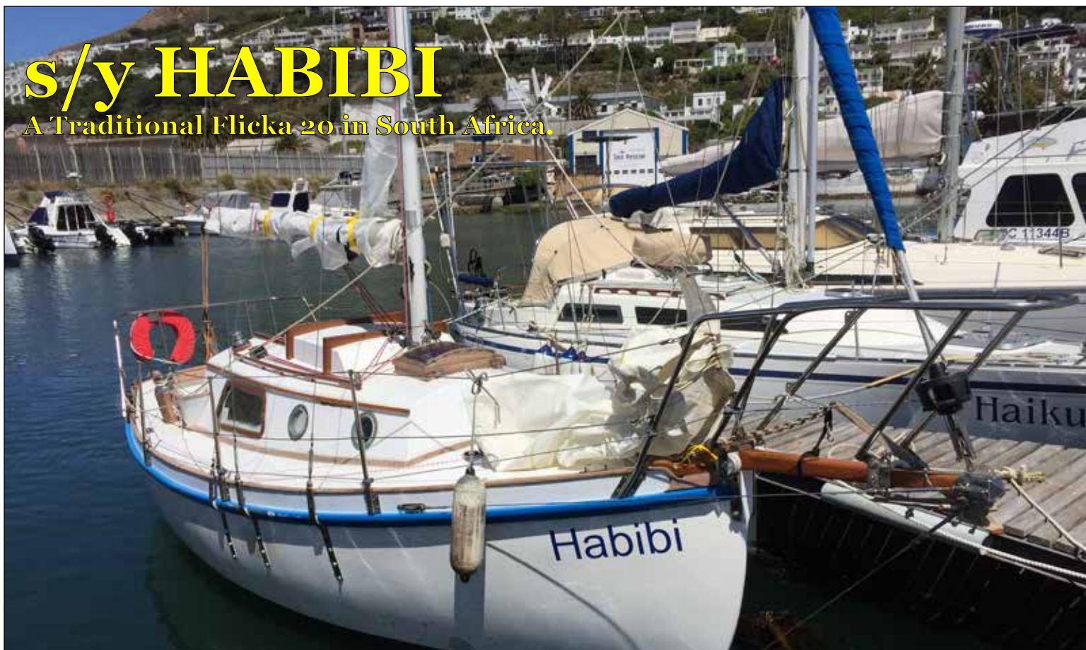
s/y HABIBI at the False Bay Yacht Club in Simons Town, Cape Town, South Africa.