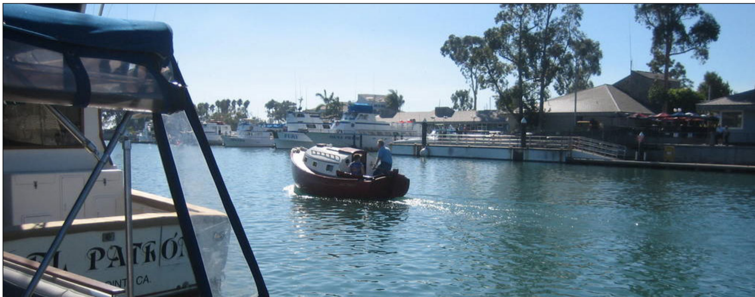
Under electric power, s/y RED RASCAL heads for the boat slip for additional fitting out.