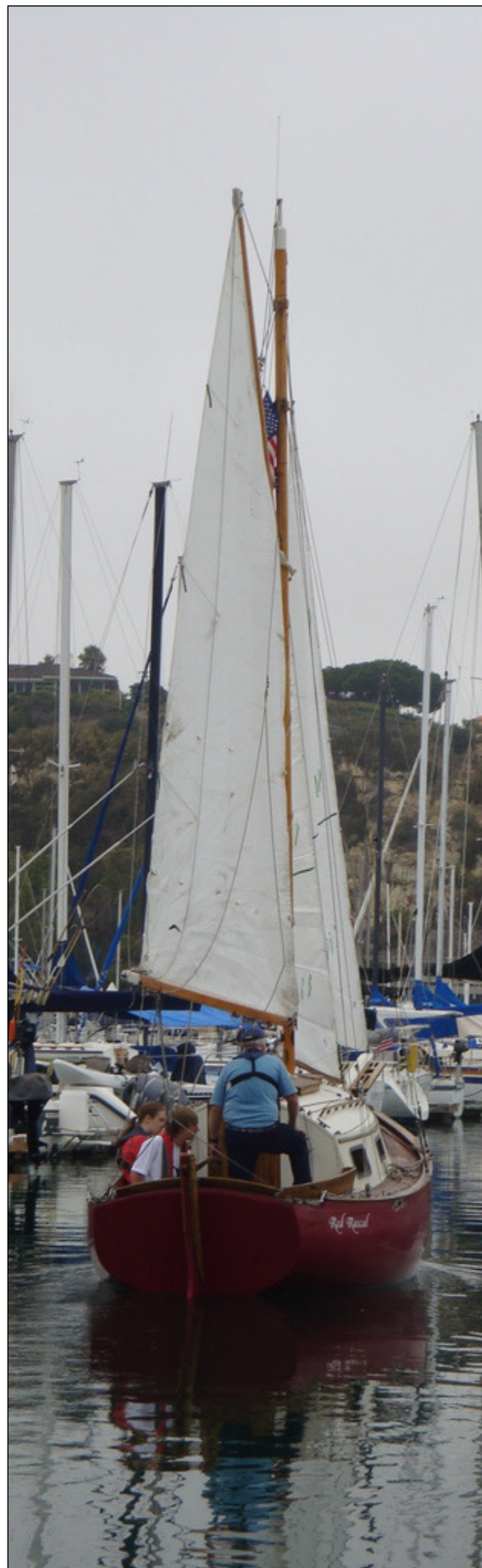
On the water!