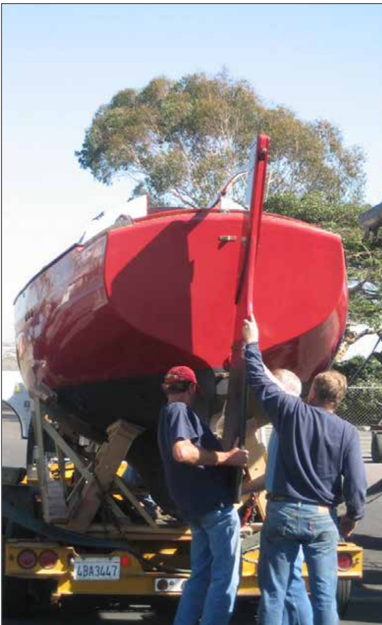
Hanging the rudder.