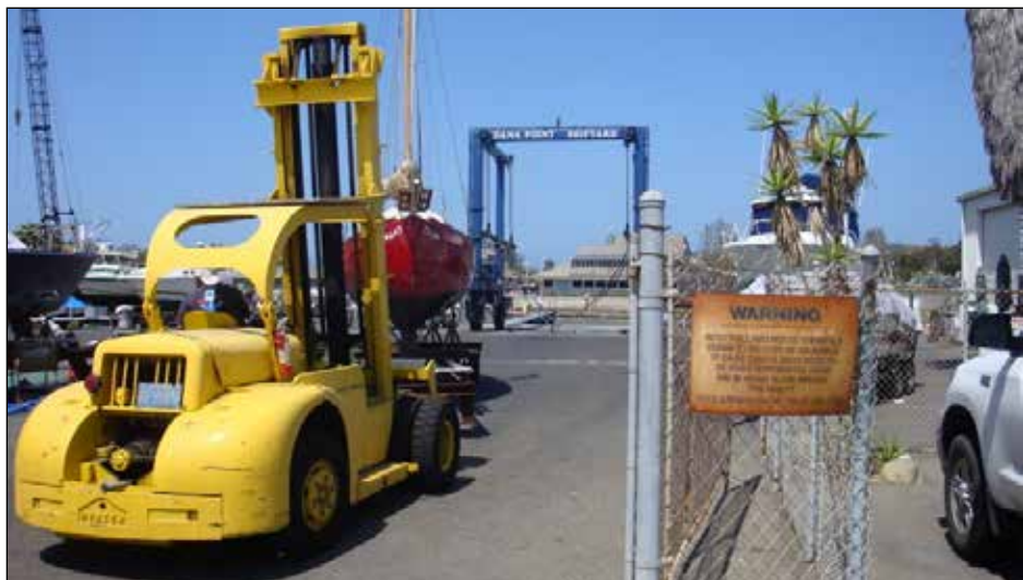
Moving s/y RED RASCAL to the launch basin.