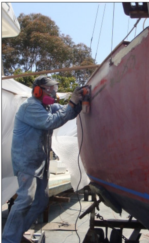
Preparation for paint.