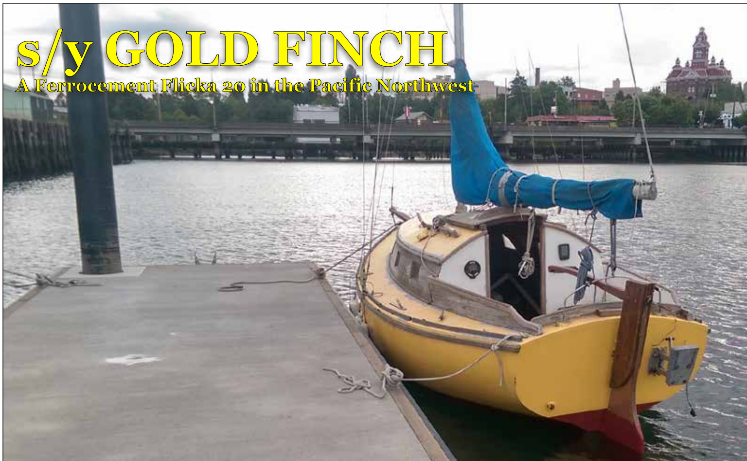
GOLDFINCH is ready for another trip on the Salish Sea.