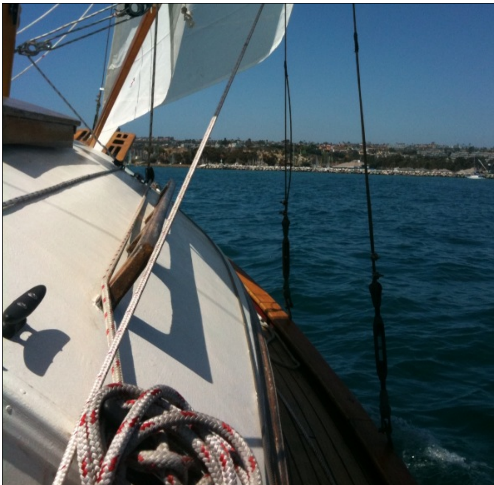
RED RASCAL out on the Pacific Ocean near Dana Point Marina.