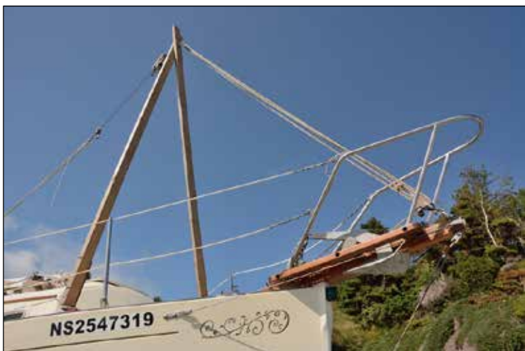
The position of the a-frame once the mast has been lowered.