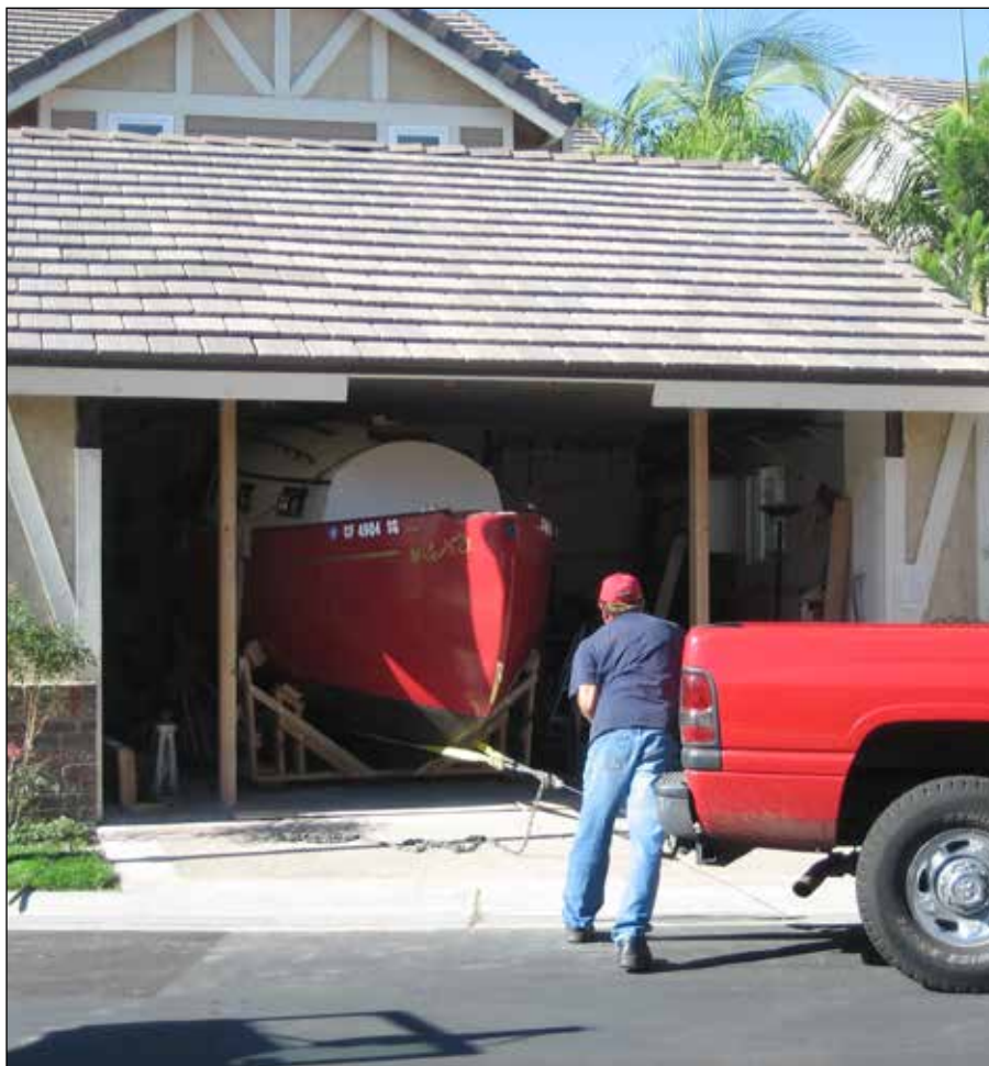
Freeing RED RASCAL from the garage required some care.