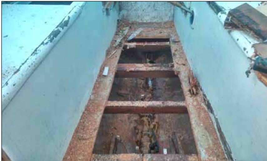
Removing the old cockpit floor of s/y GOLDFINCH .