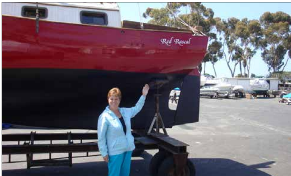
Red Rascal with s/y RED RASCAL .