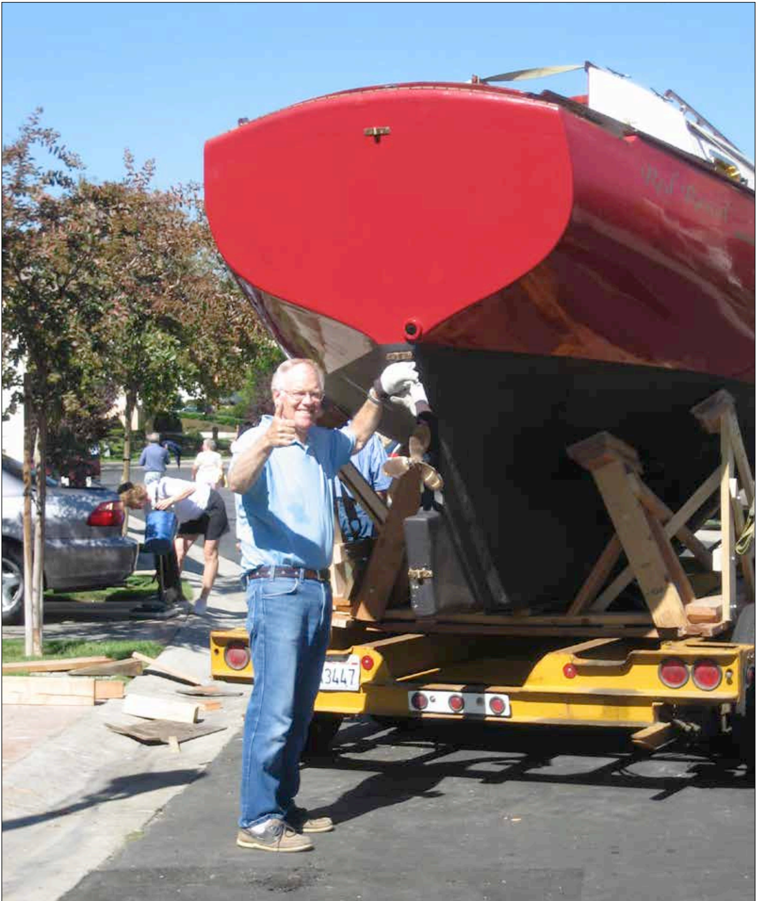
A happy camper: s/y RED RASCAL is on a trailer and ready to travel to the marina.