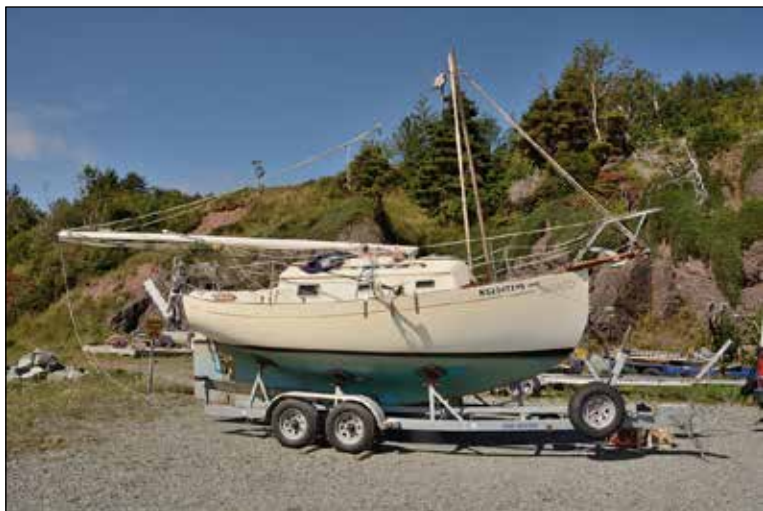
An aft mast support protects the windvane from the mast.