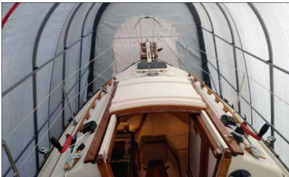
Looking forward in the storage enclosure.