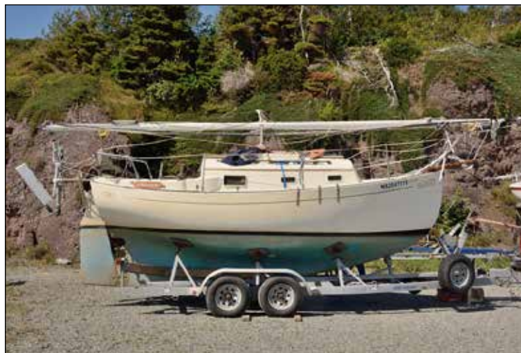
This support allows moving the mast forward for securing.