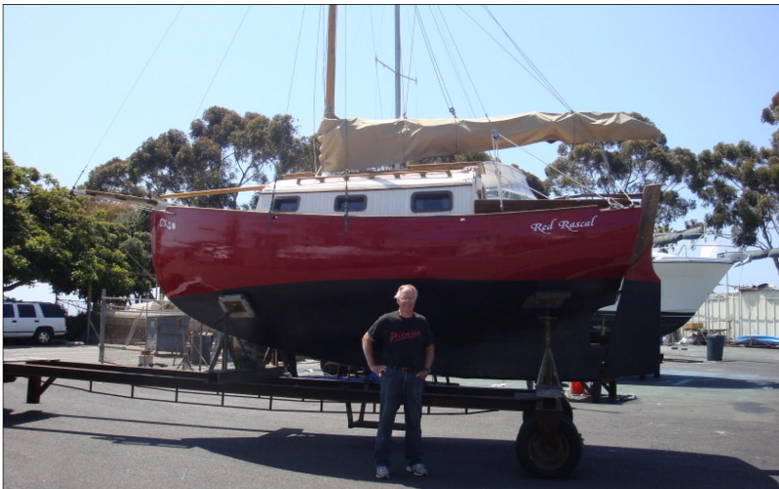
With fresh topsides paint, s/y RED RASCAL is ready to be launched again.