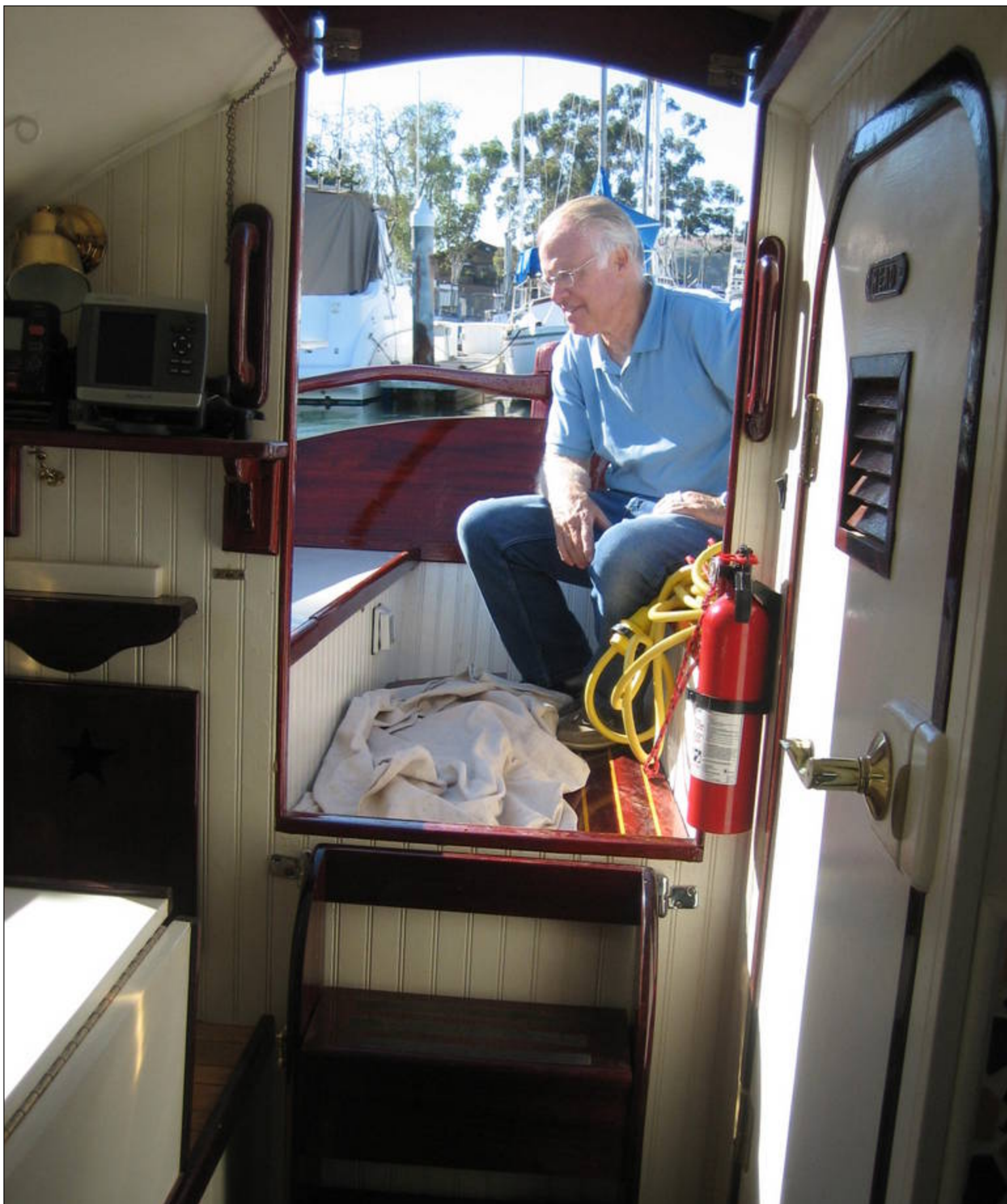
Taking a moment to enjoy s/y RED RASCAL .