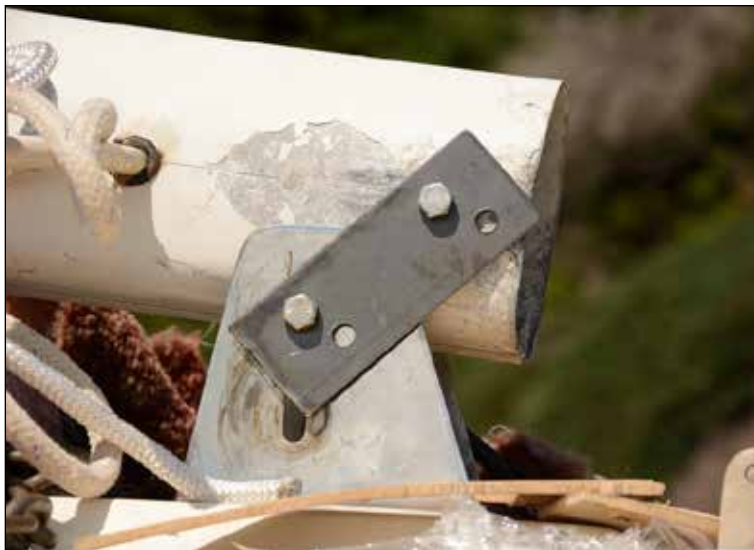
The brackets in use lifting the mast during the process.