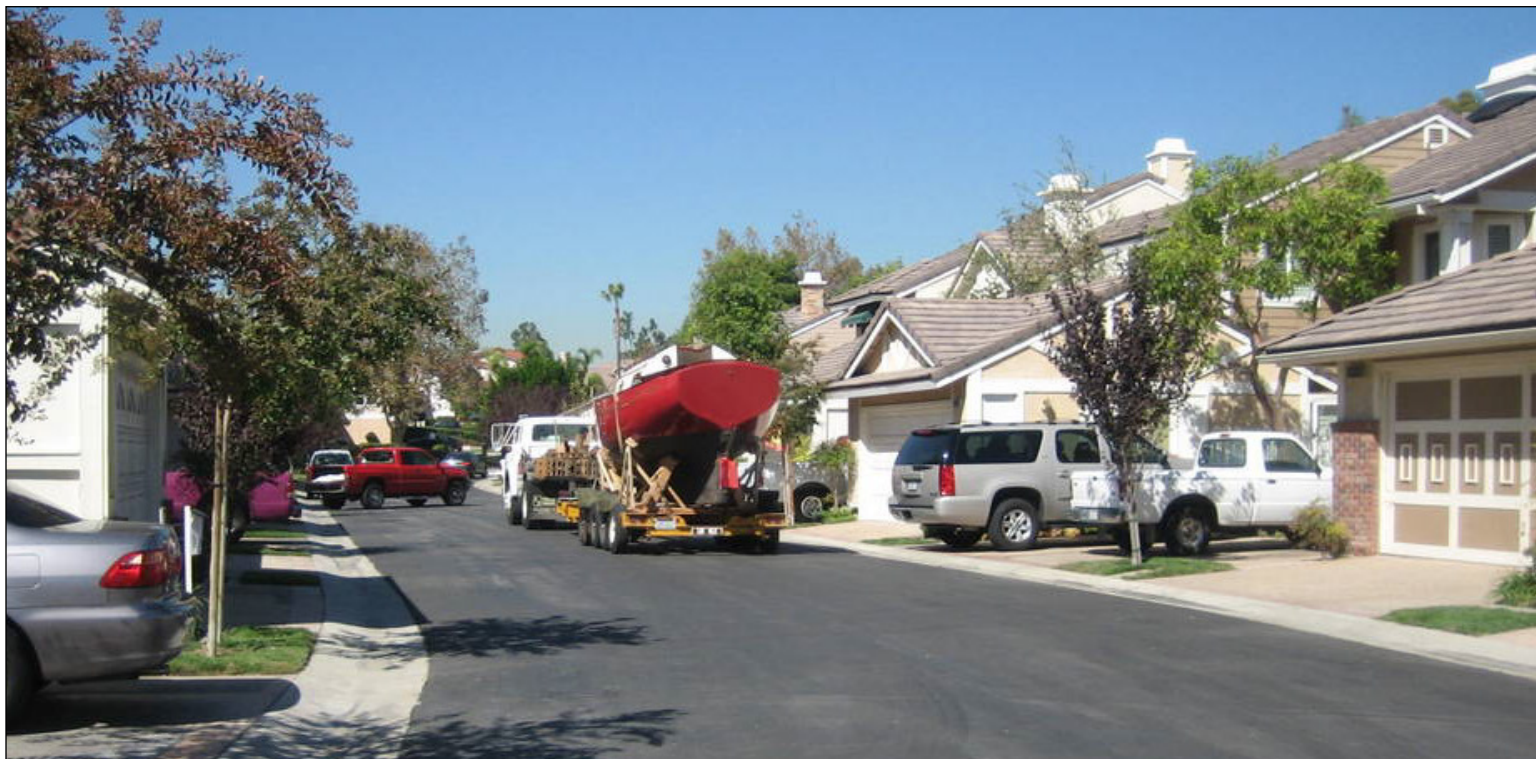
The truck and trailer with RED RASCAL ready for the trip to Dana Point Marina.