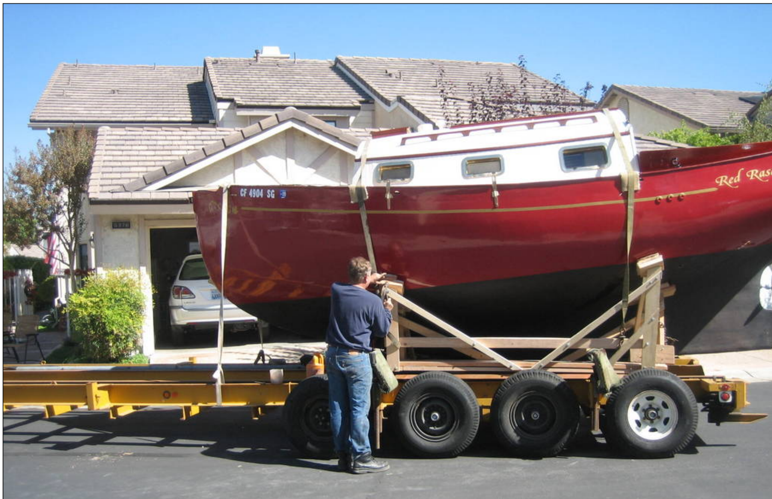
Getting s/y RED RASCAL secured for the road trip.