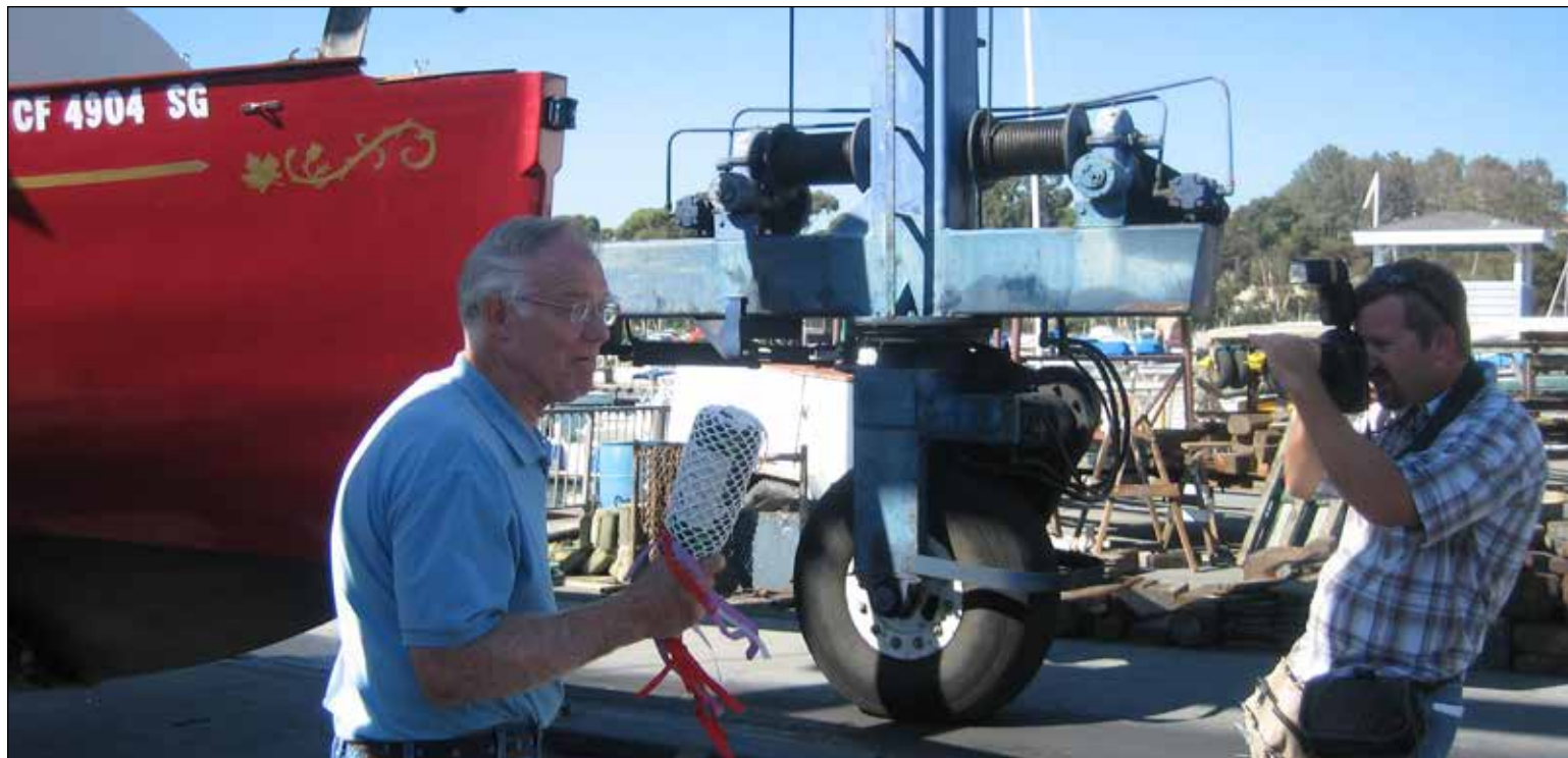
The champagne bottle is ready for christening and the press is going to document the event.