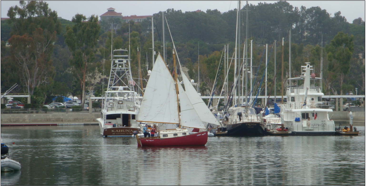
Heading for the Pacific Ocean aboard s/y RED RASCAL .