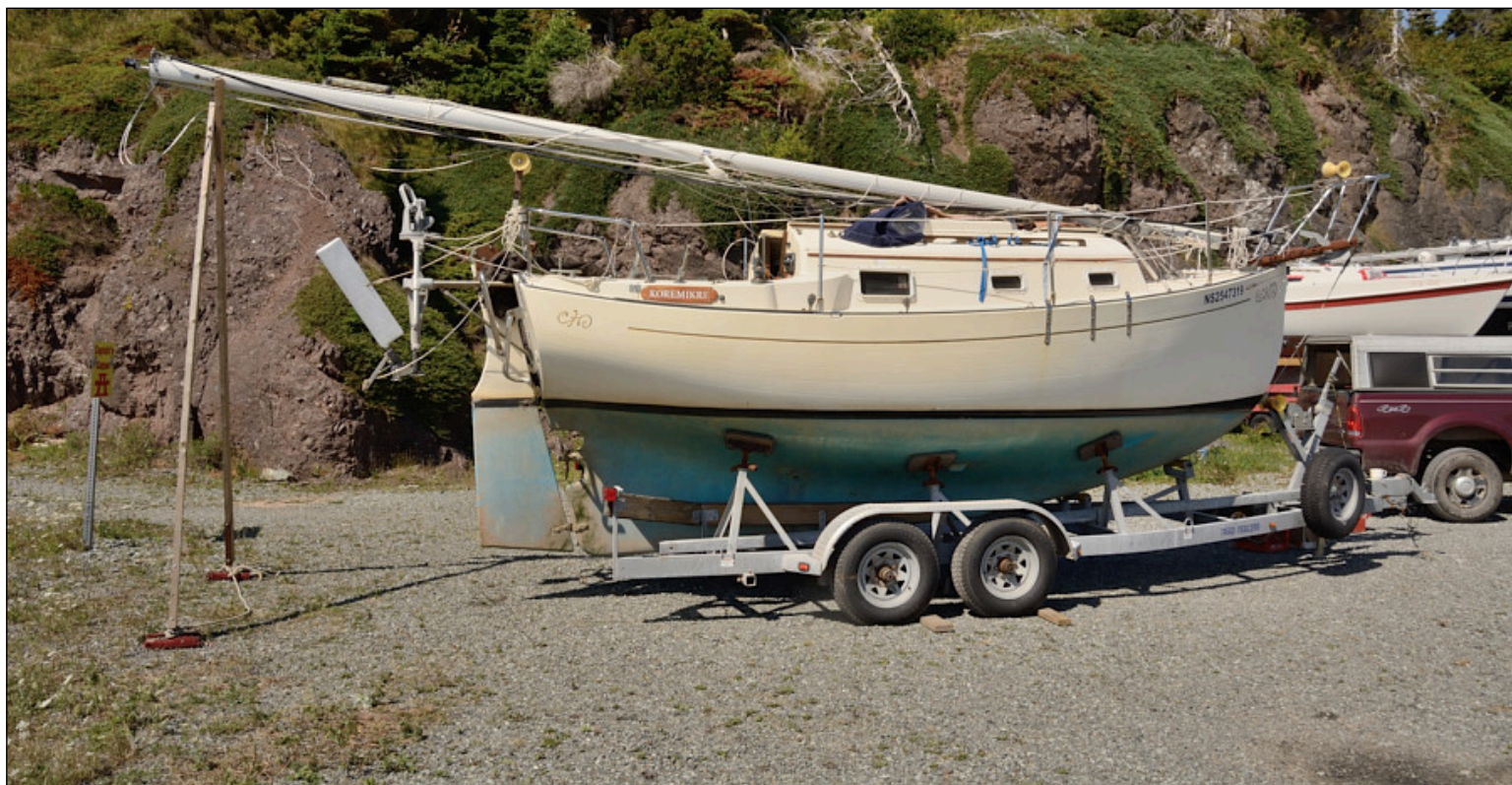
The a-frame helps protect the Aries windvane while moving the mast forward onto the bow pulpit.