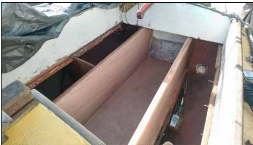
A new cockpit for s/y GOLDFINCH .