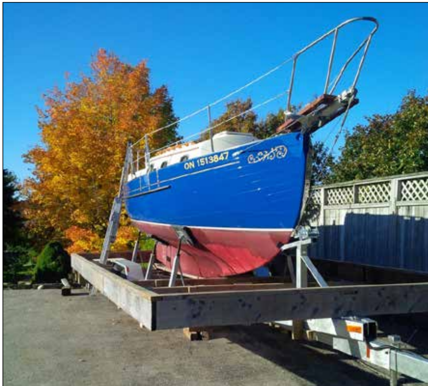
A frame is built on the trailer