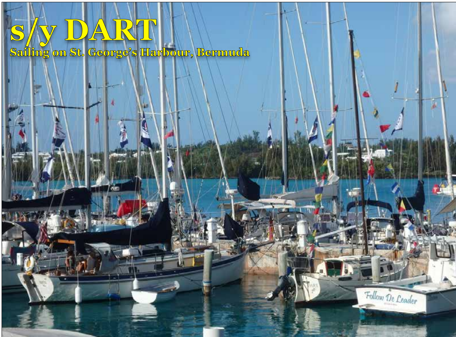
St. George's Dinghy Club hosting the Atlantic Rally for Cruisers (ARC). DART's feeling a bit overwhelmed but is the only one dressed overall with signal flags and Buddhist prayer flags!

Sailing on St. George's Harbour, Bermuda