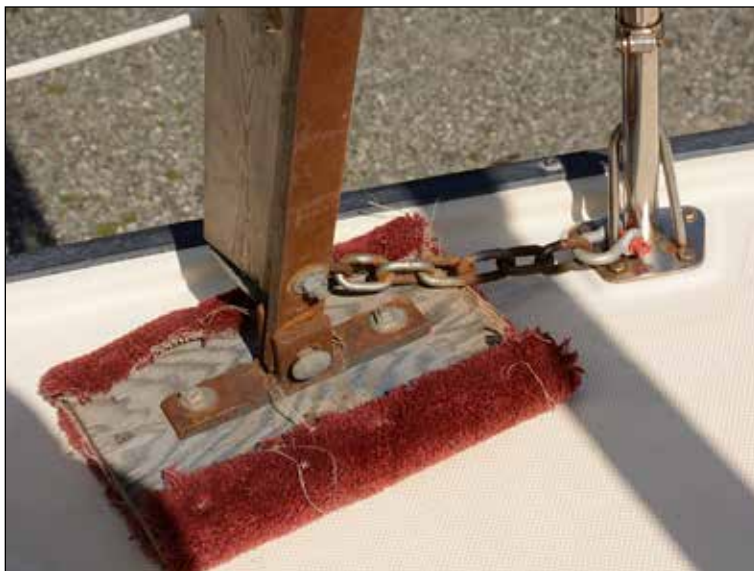
An a-frame with padded bases are secured to the stanchions.