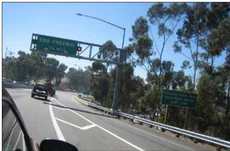
First was 91 freeway, followed by the 55 freeway, and finally all the day to the Dana Point shipyards on the 5 freeway.