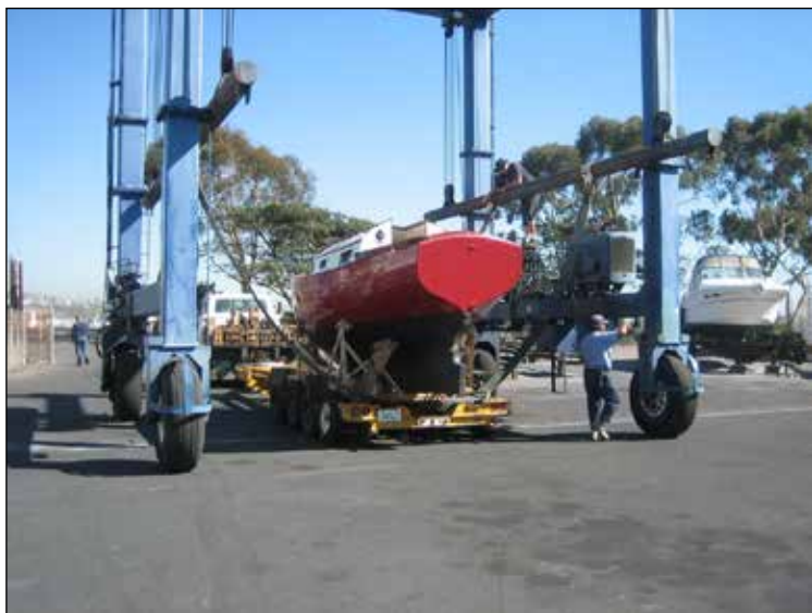
Position the lifting straps.