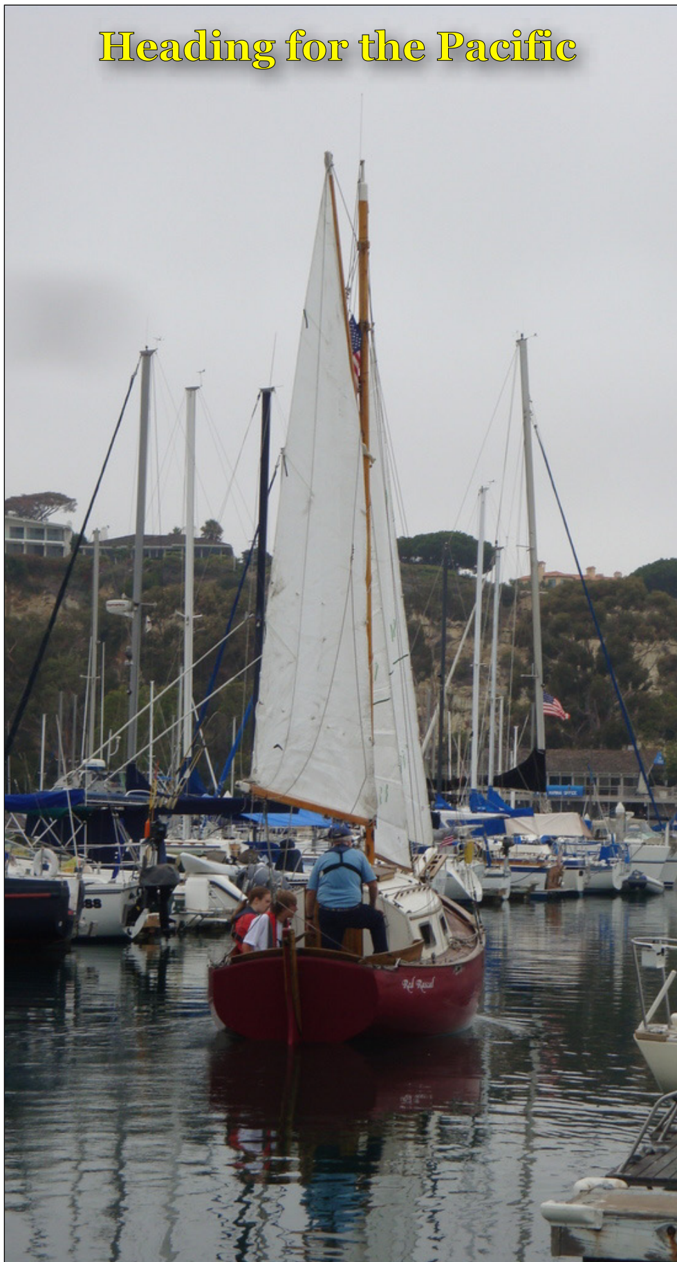
Leaving Dana Point Marina and heading for the Pacific Ocean.