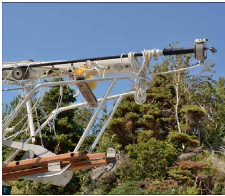
The furler is secured to the boom for transport.