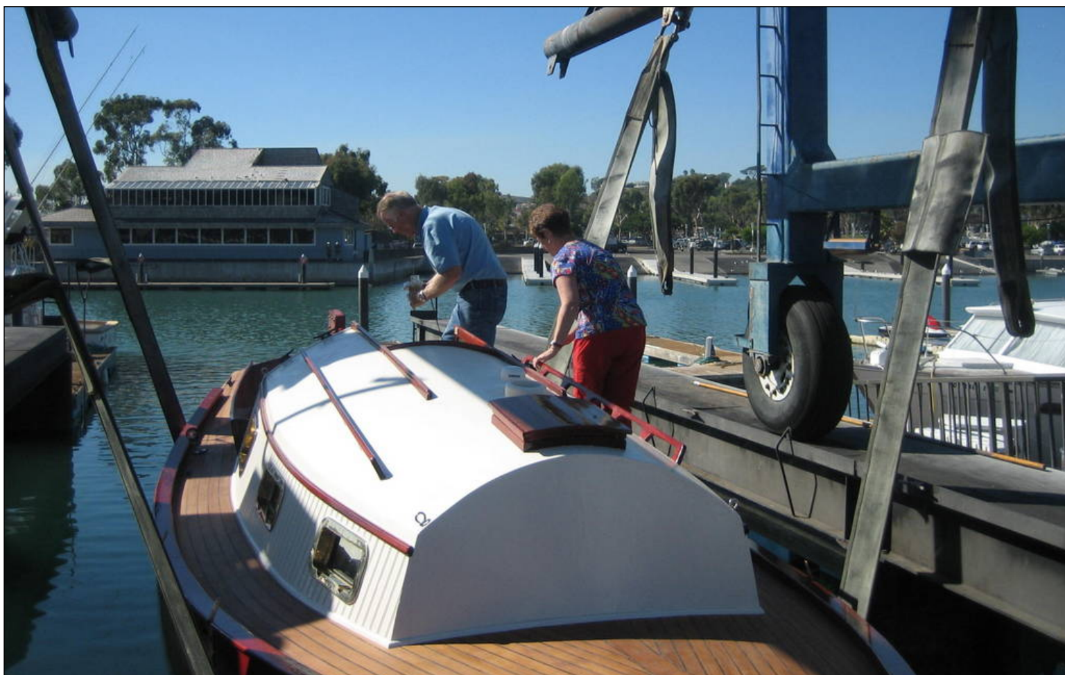
Moving into the cockpit for the launch of s/y RED RASCAL .