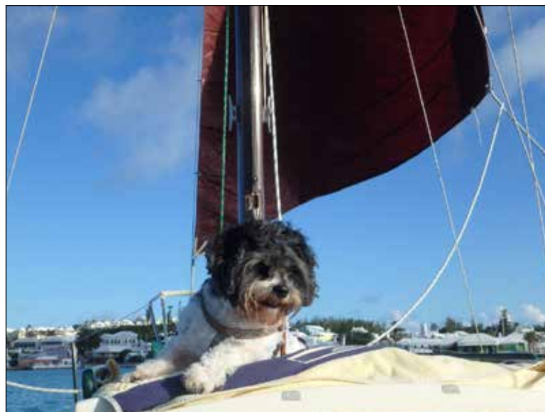
Here we are on Dart early one morning in St George's Harbour. Dixie is happy too with a boat that doesn't heel!