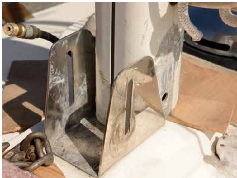
The mast base is moved forward.