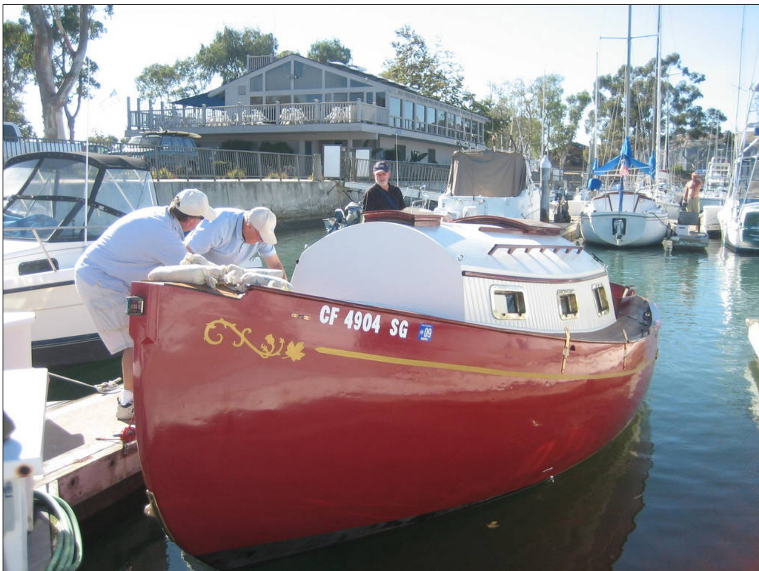
Securing s/y RED RASCAL in her boat slip at the Dana Point Marina.