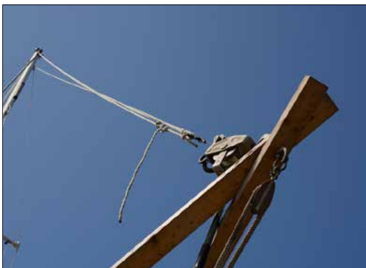
The halyards are used with the roller furler removed.