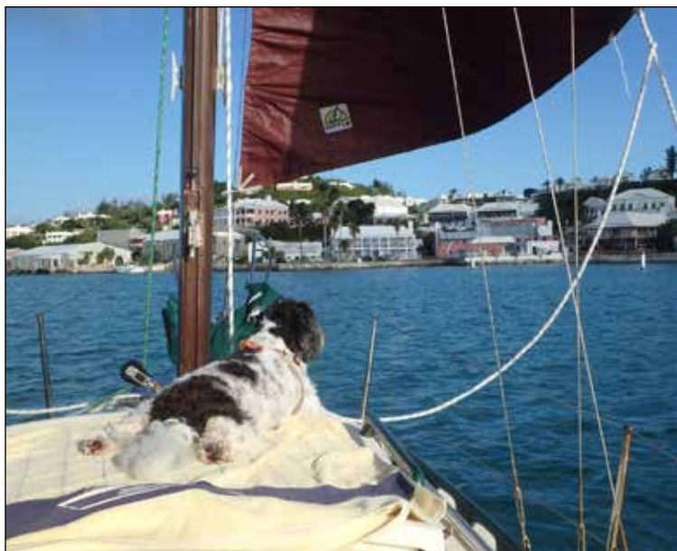
I'm lazy, sailing quite happily with just the jib in a light breeze.