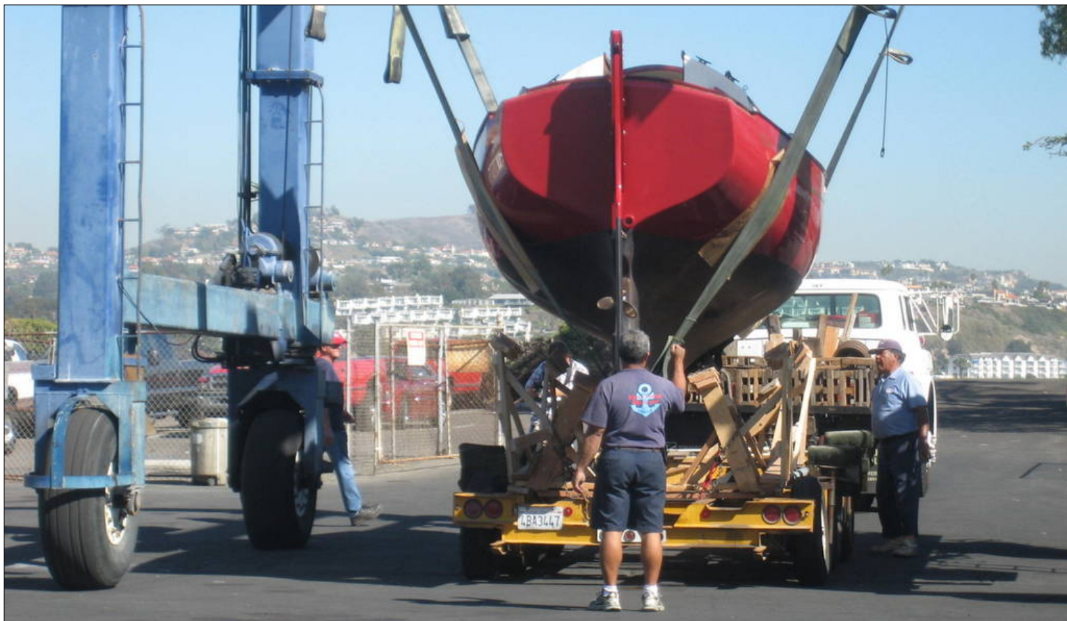
A scary moment for anyone launching their Flicka for the first time.