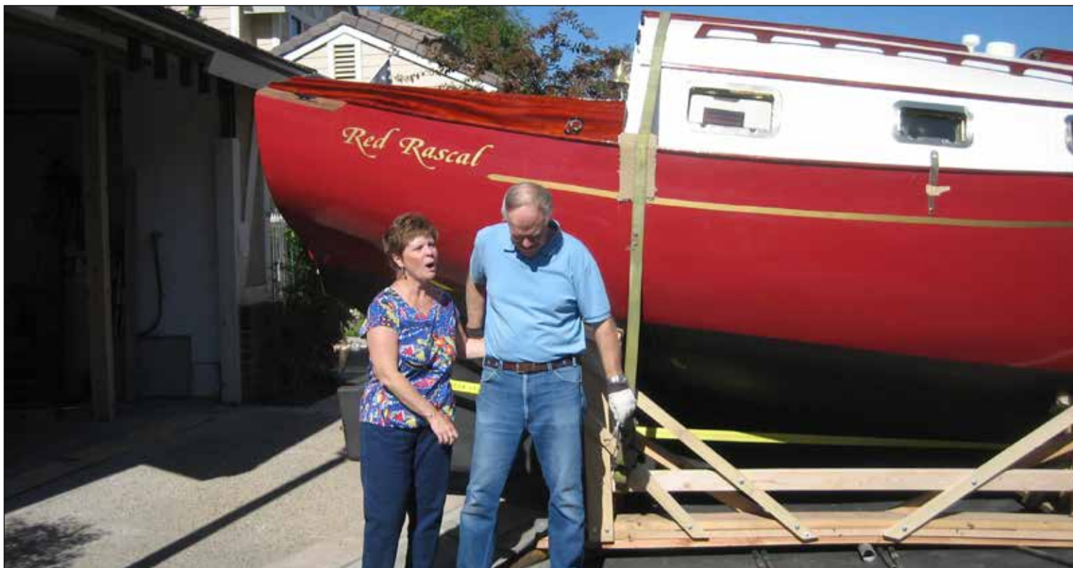
Now the garage can be used as a garage again