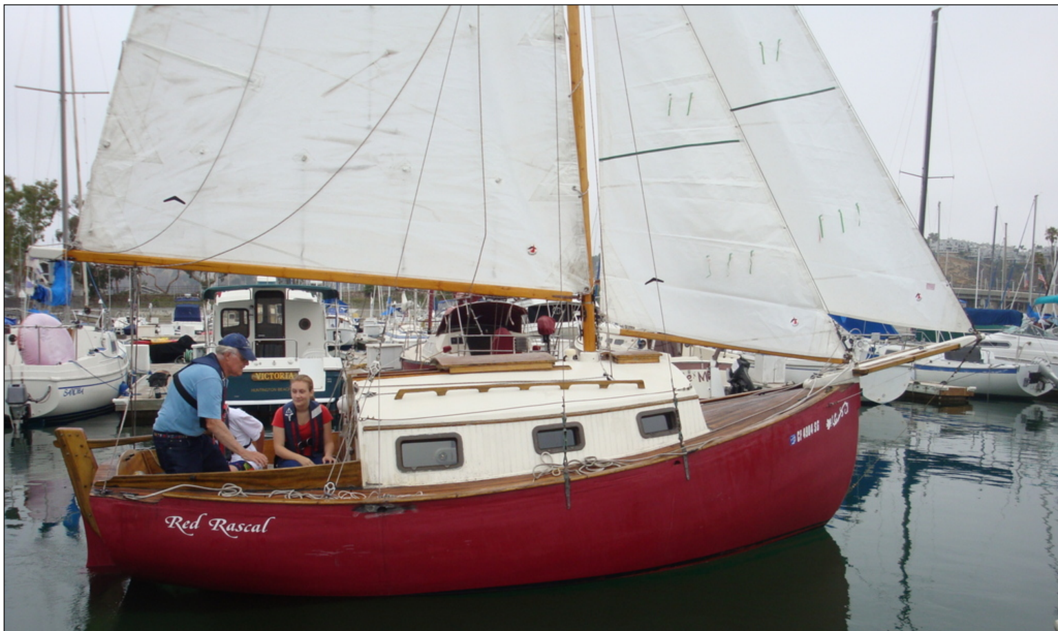
Heading out for a trip on the Pacific Ocean with two of my grandchildren.