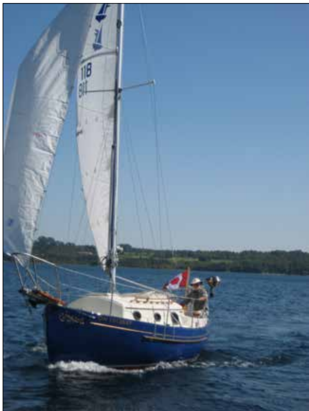
Reaching aboard /y 4ELSA .