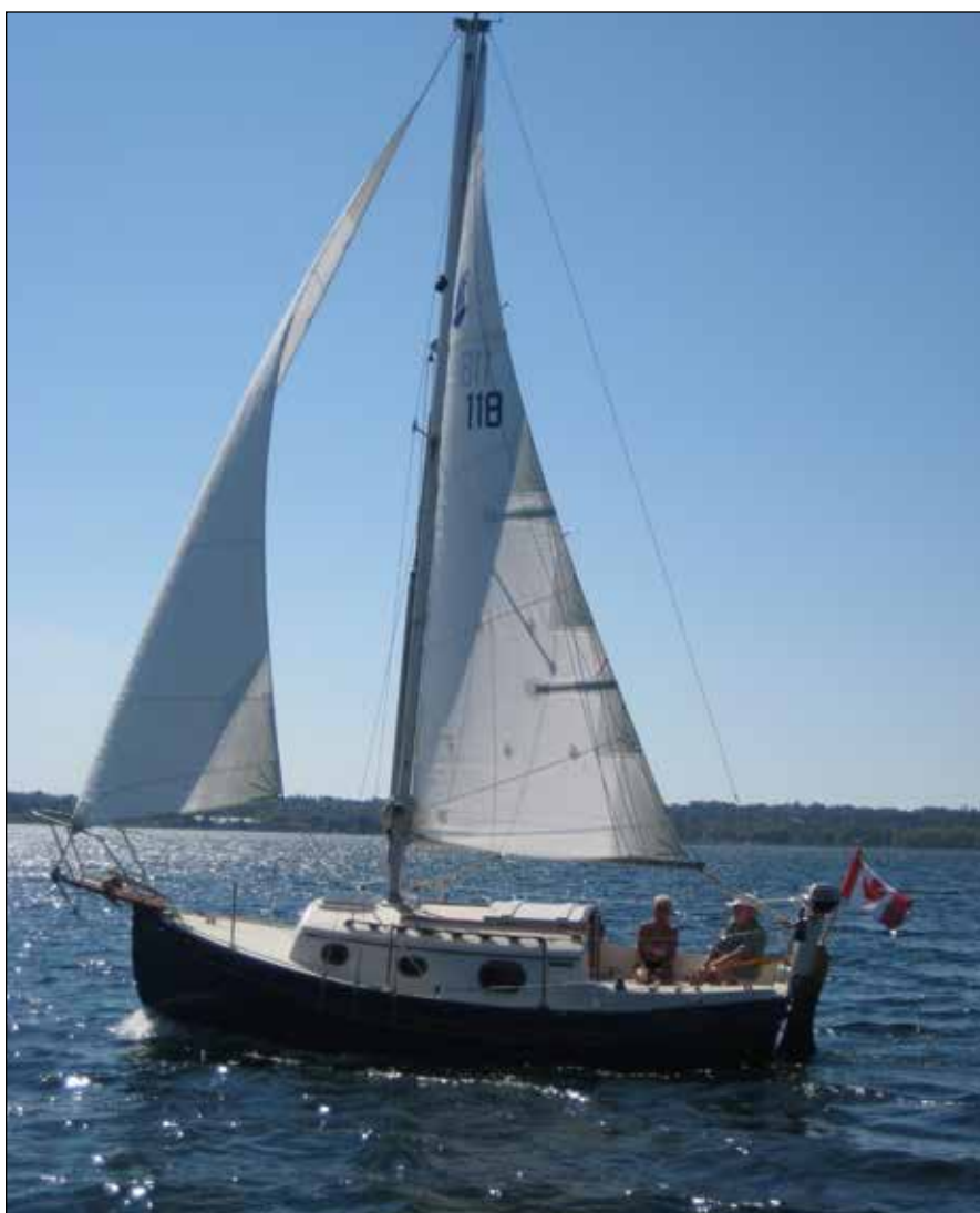
A fine day of sailing aboard s/y 4ELSA .