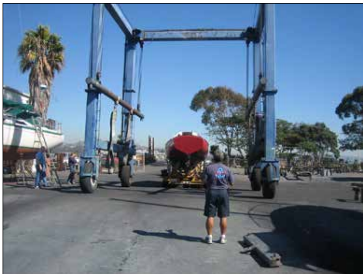
Moving the Travel -Lift to RED RASCAL .