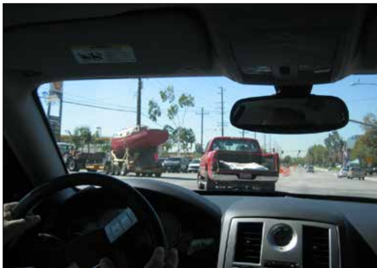
RED RASCAL in city traffic.