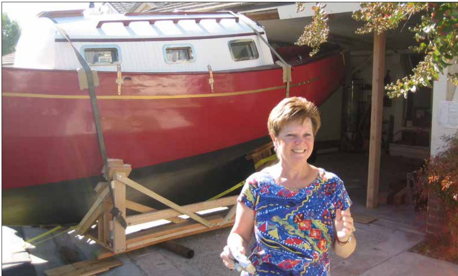
RED RASCAL is finally free from the confines of the garage.