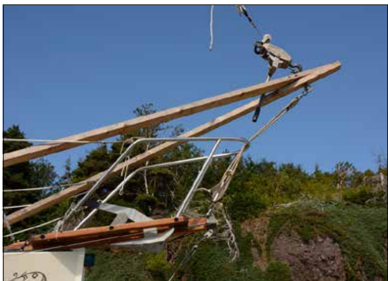
The a-frame is position over the bow.