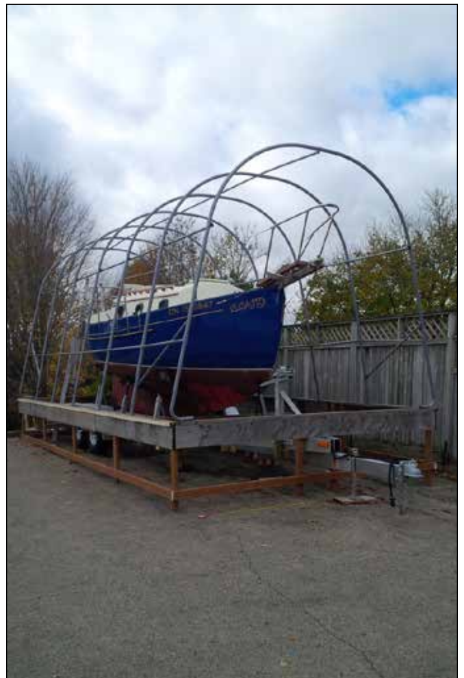
The finished wooden framing and supports.