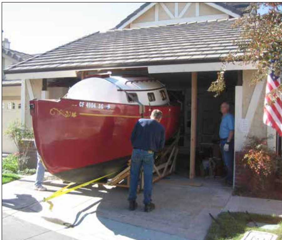
Finding enough clearance meant cutting the garage roof.

and came over to me and said “Bob, it’s too high now, we’re never going to get this boat out of here!”