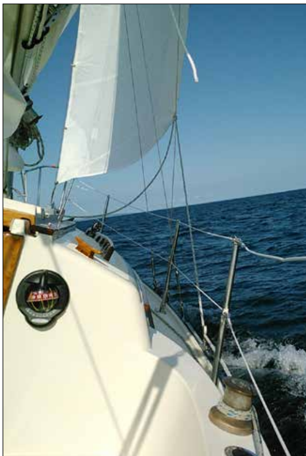
A run to Lion's Head Marina on s/y 4ELSA.