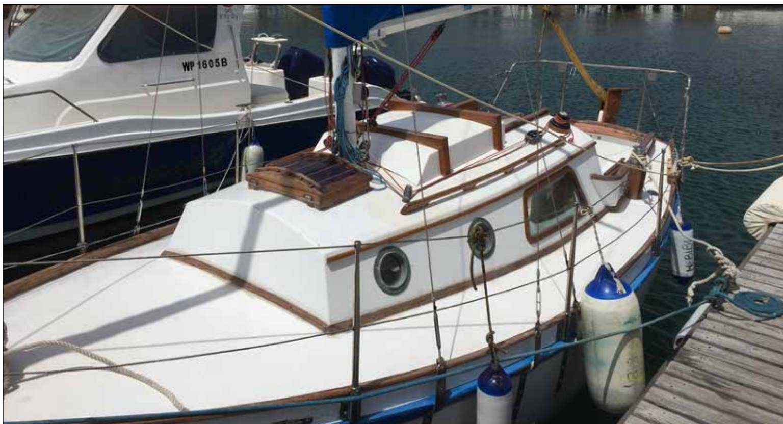
s/y HABIBI is more traditional Flicka compared to TI DUICK above.