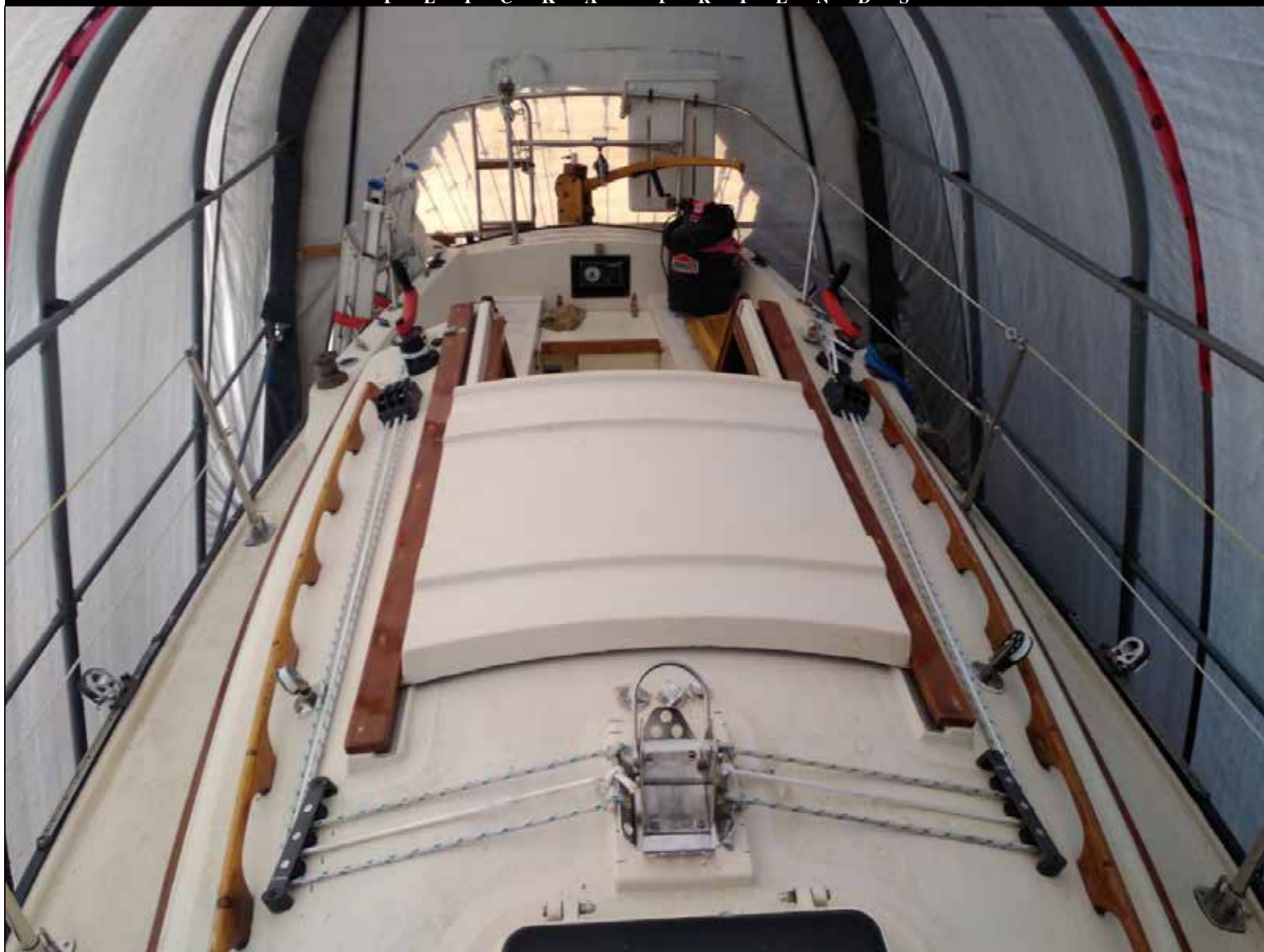
4ELSA is ready for another Ontario winter. Note the new lines led aft with Spinlock turning blocks and cams.