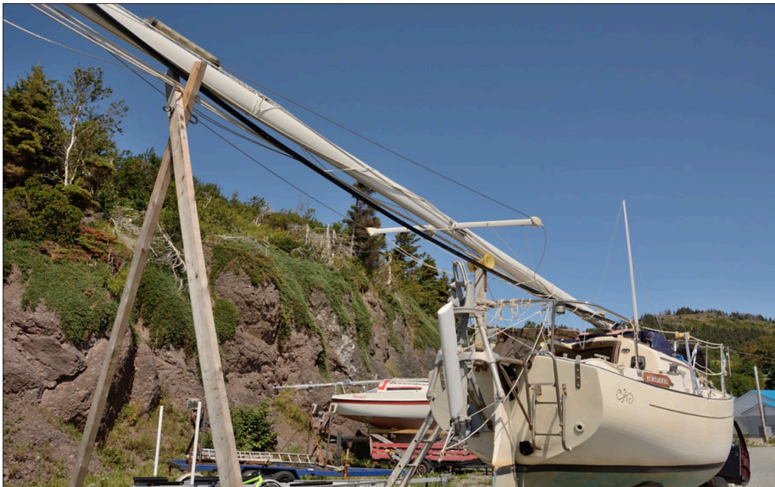
The a-frame is used to support the mast until moved forward for transport.