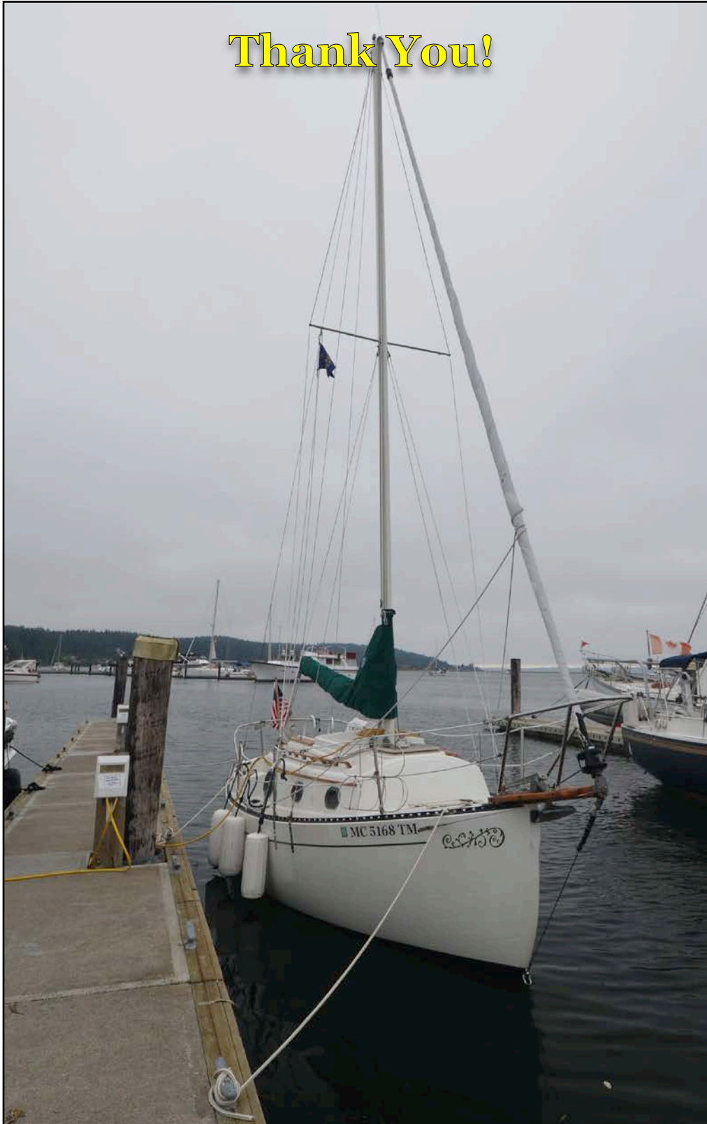
My Flicka: s/y BLUE SKIES at the dock in Fisherman Bay.