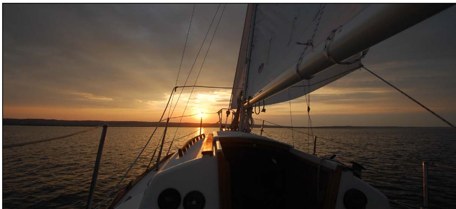
14. Sunset sailing on West Bay aboard s/y ZANZIBAR .