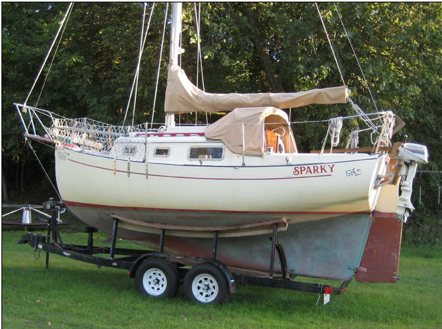
17. Currently for sale, s/y SPARKY has an open interior, outboard power and a bunch of sails: thewireguy@aol.com.