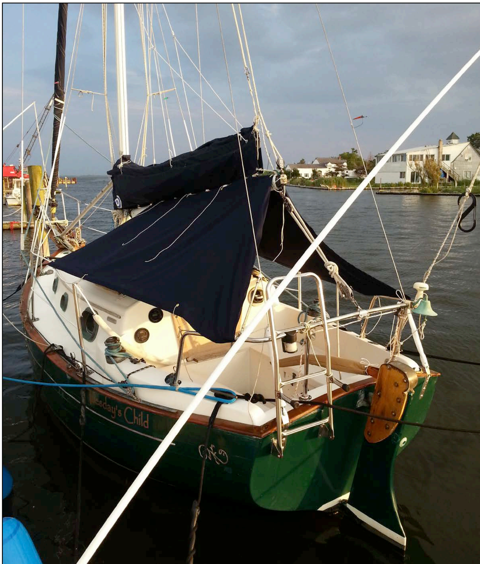
9. The Lazy bag set up for the mainsail and a roll up awning that stows on the boom aboard s/y TUESDAY'S CHILD which is docked in Amityville, NY.