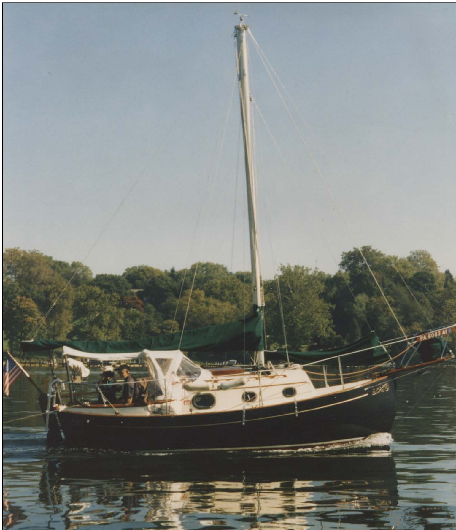
16. Sailed on the Chesapeake Bay, s/y SYNTHESIS II is a gaff-rigged cutter with a diesel inboard. The owner also owned a Nor'Sea 27 that he sailed across the Atlantic and back.