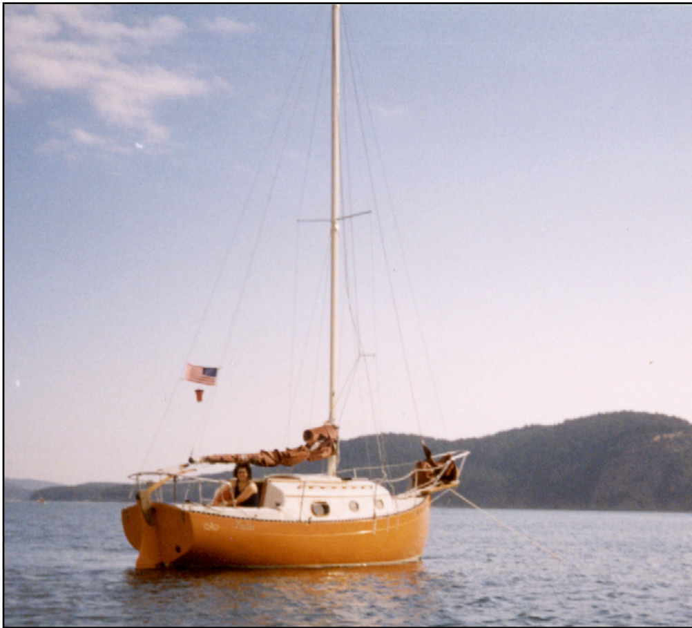
3. KALIA (#250) at Sucia Island Marine Park, San Juan Islands, Washington State.