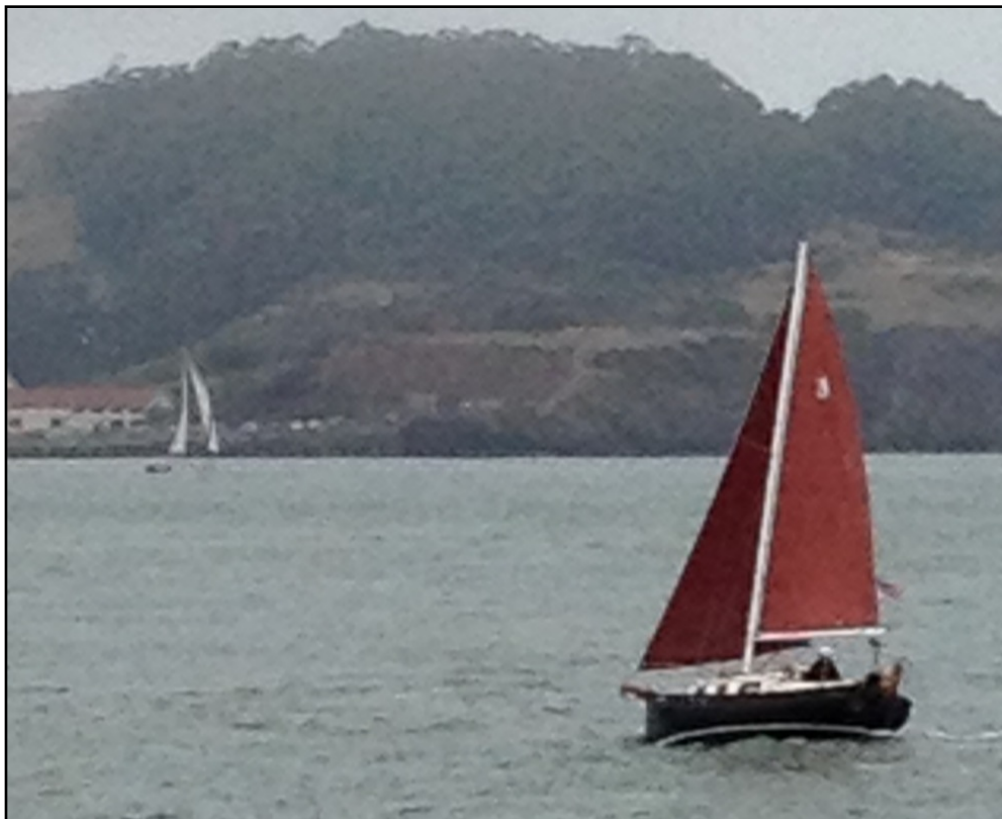
4. My Flicka sailing out towards the Gate in SF Bay. No name yet, too busy sailing!