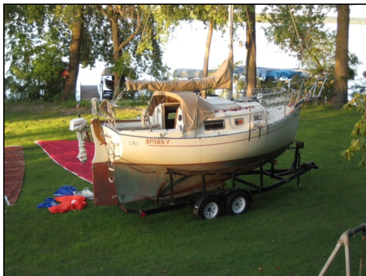
19. Starboard side of s/y SPARKY .