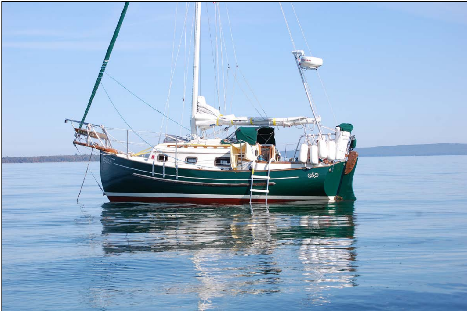
7. BALLO LISCIO anchored in Justice Bay, Sand Island, Apostle Islands, Wisconsin.