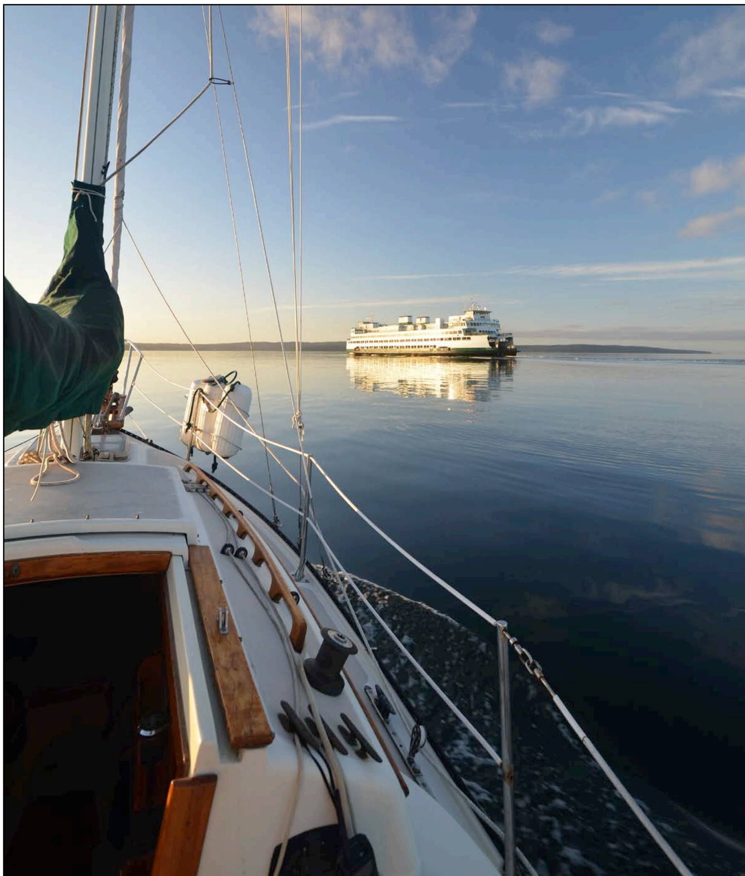
10. A Washington State Ferry in the passing lane in the San Juan Channel at six in the morning. I'm motoring in dead clam conditions aboard s/y BLUE SKIES to enter Fisherman Bay's narrow channel at high slack tide or very close to it.