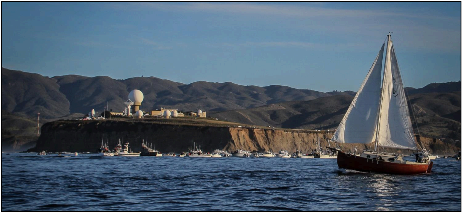
5. Going by the Maverick Big Wave Surf Competition on the way to the S.F. Bay from Half Moon Bay aboard s/y WHISPER .