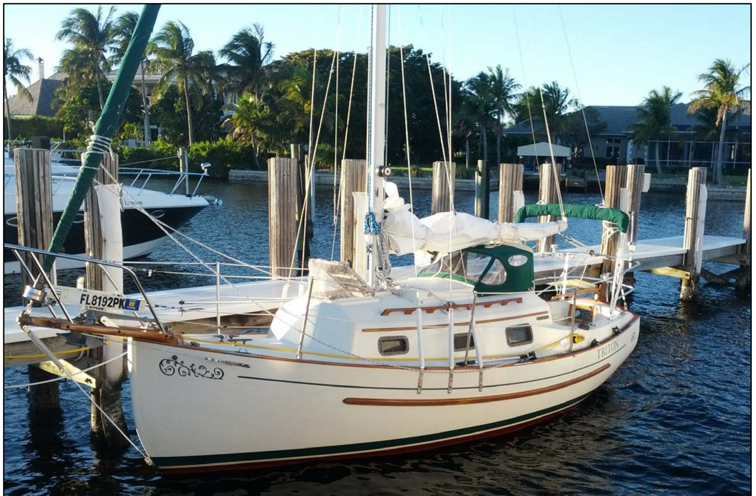
6. Here is s/y TRITON, my PSC Flicka (#429), at the St. Charles Yacht Club in Fort Myers, Florida after a day on the Gulf of Mexico. Even though she's the smallest (by far) yacht at the club, members still come by to comment that she's adorable...