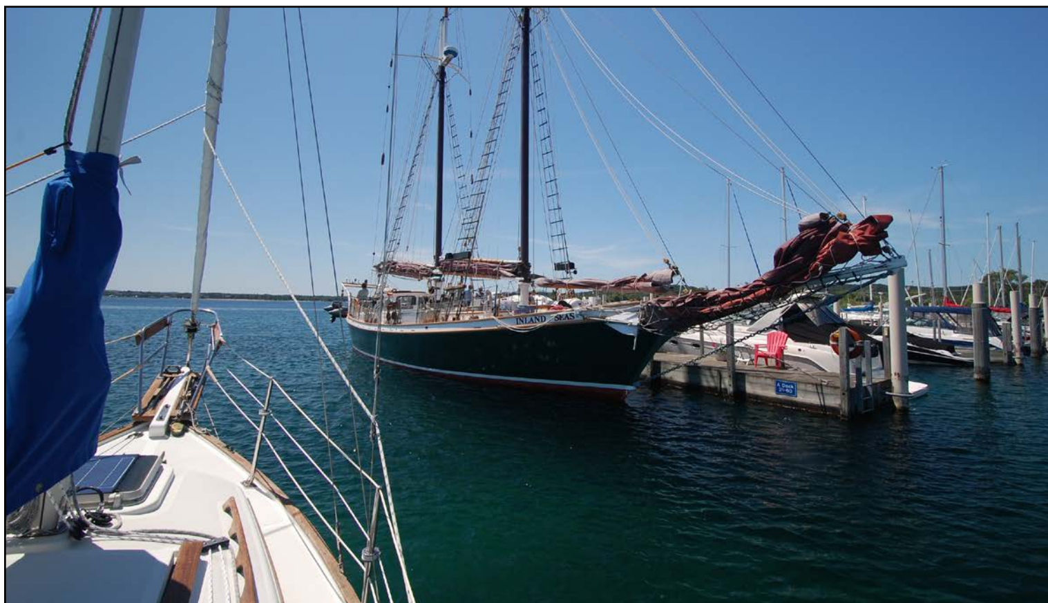
12. Passing the s/v INLAND SEAS on the way out of the marina aboard s/y ZANZIBAR . Nikkor 10-24 mm lens @ 10mm.