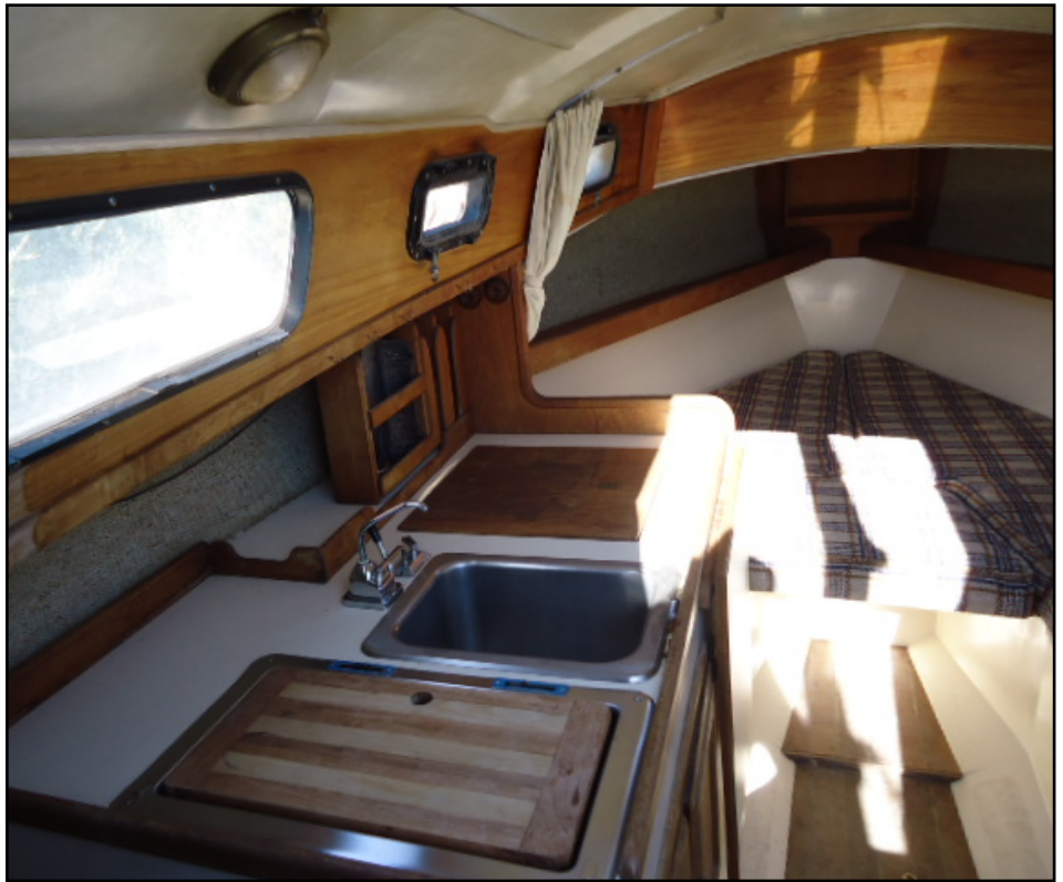
20/21. A veteran of Hawaii and the Sea of Cortez, s/y WINDSHIFT II currently sails on Lake Tahoe.