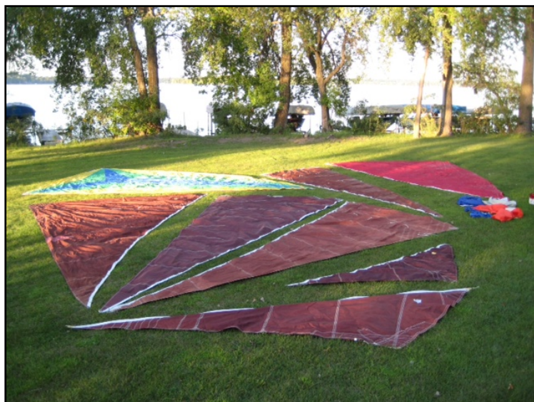
18. SPARKY has a great sail inventory.