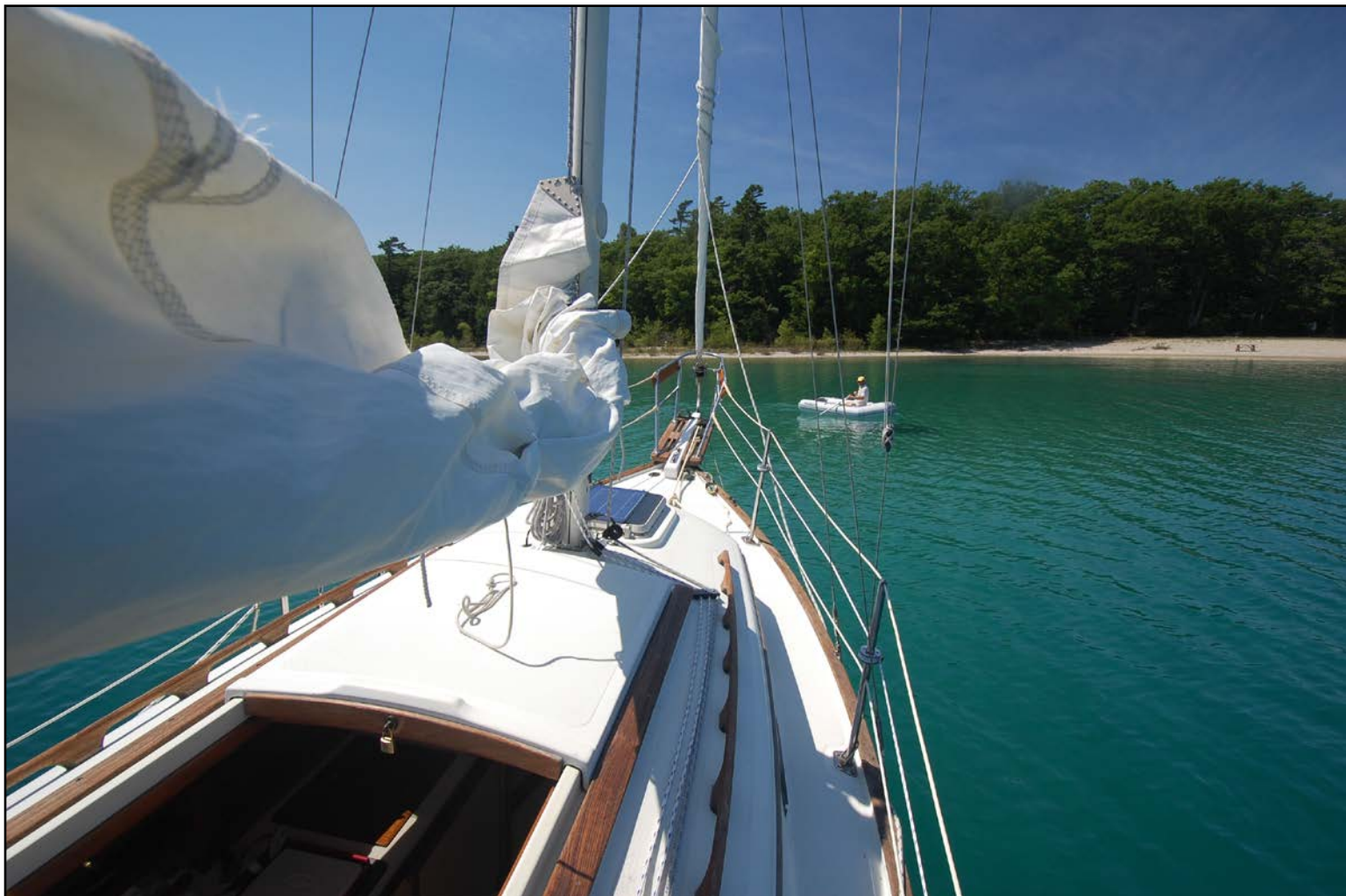
13. Rowing ashore from s/y ZANZIBAR at Power Island, West Bay, Grand Traverse Bay, Lake Michigan.