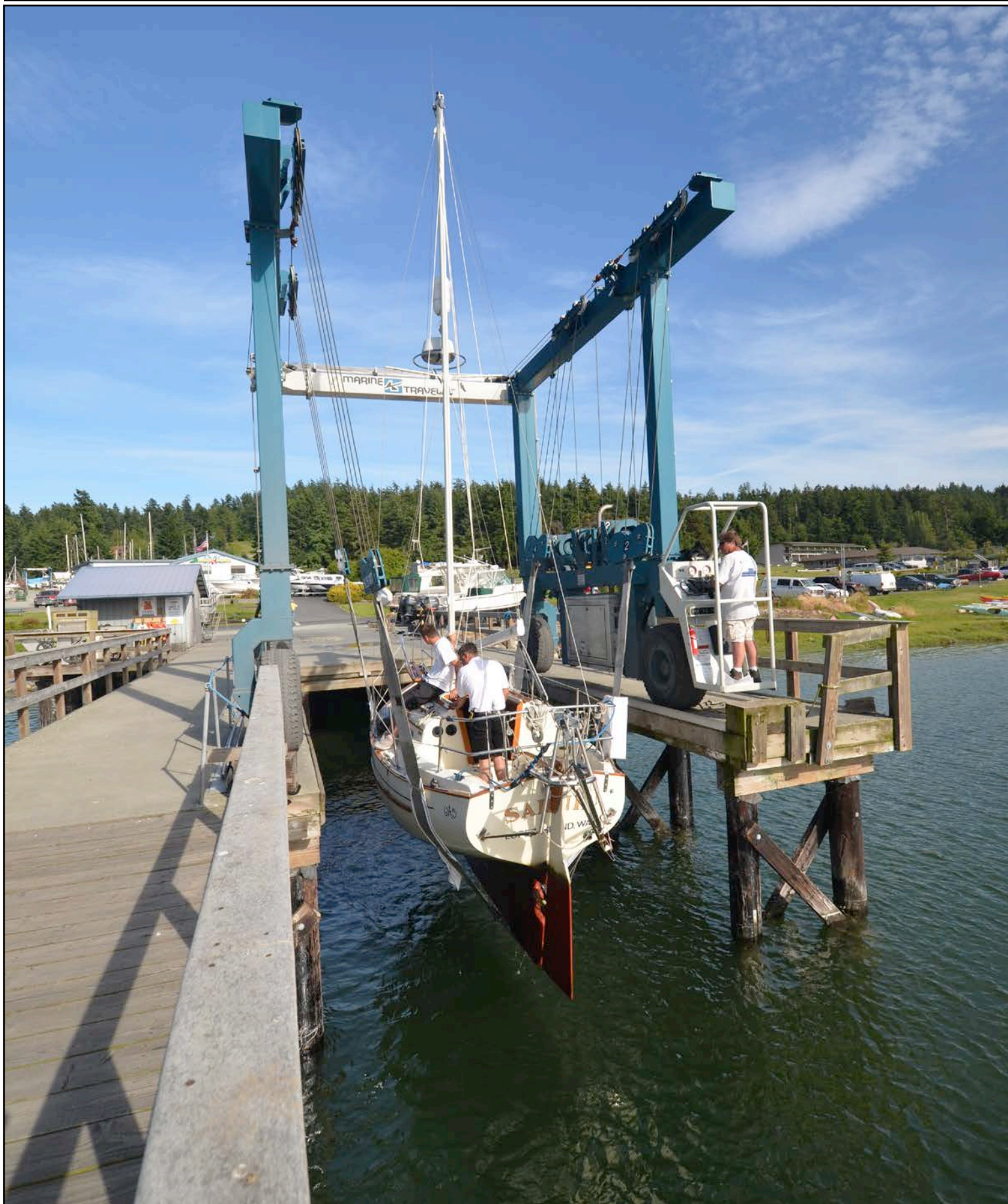
24. The marina crew lifting s/y SARNIA from Fisherman's Bay on Lopez Island.