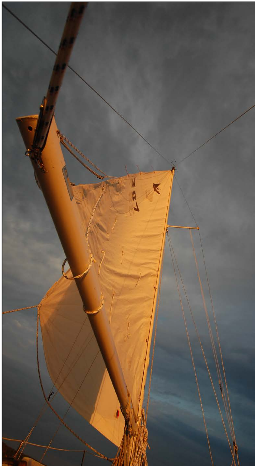
2. Sunset sailing on Grand Traverse Bay aboard s/y ZANZIBAR.

WHISPER anchored in San Francisco Bay.