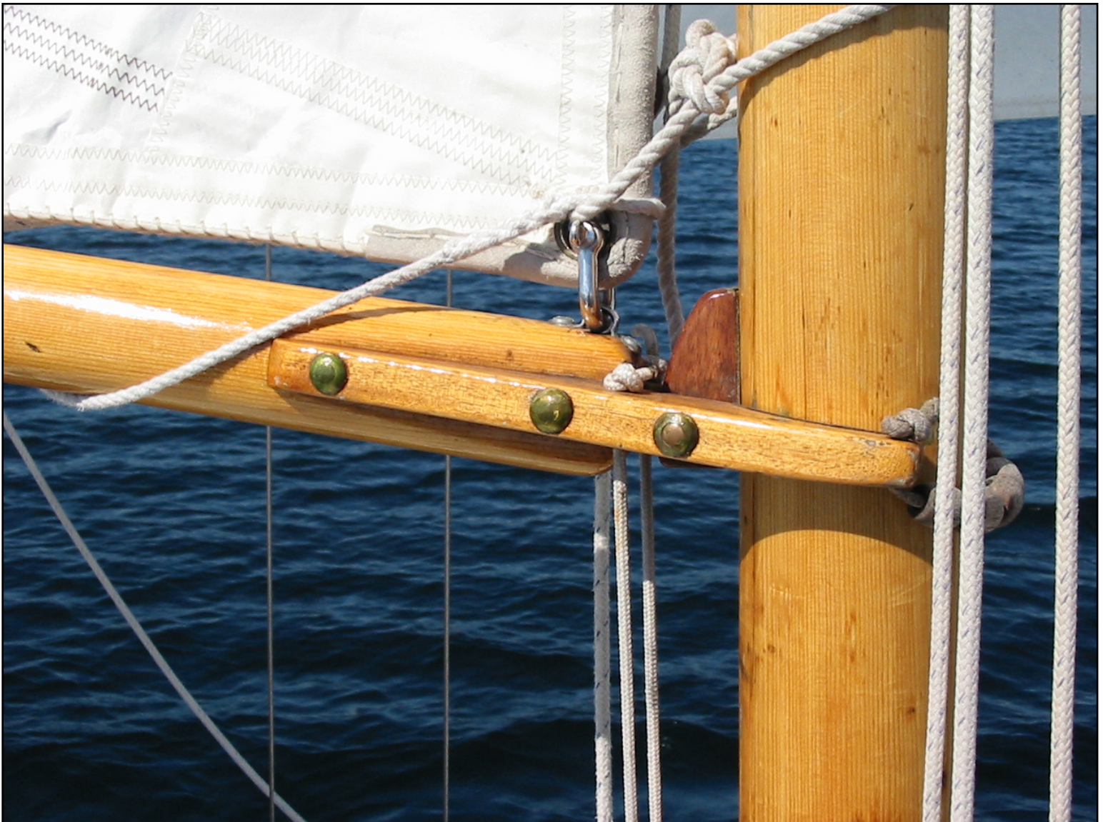
18. Boom and mast aboard the gaff rigged BEN MAIN, Jr. Pacific Seacraft Flicka # 315.