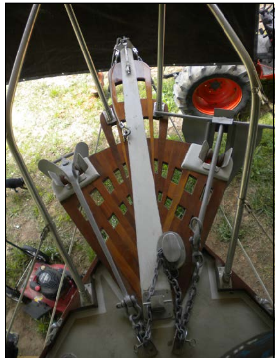
14. Anchors on the unique bowsprit.