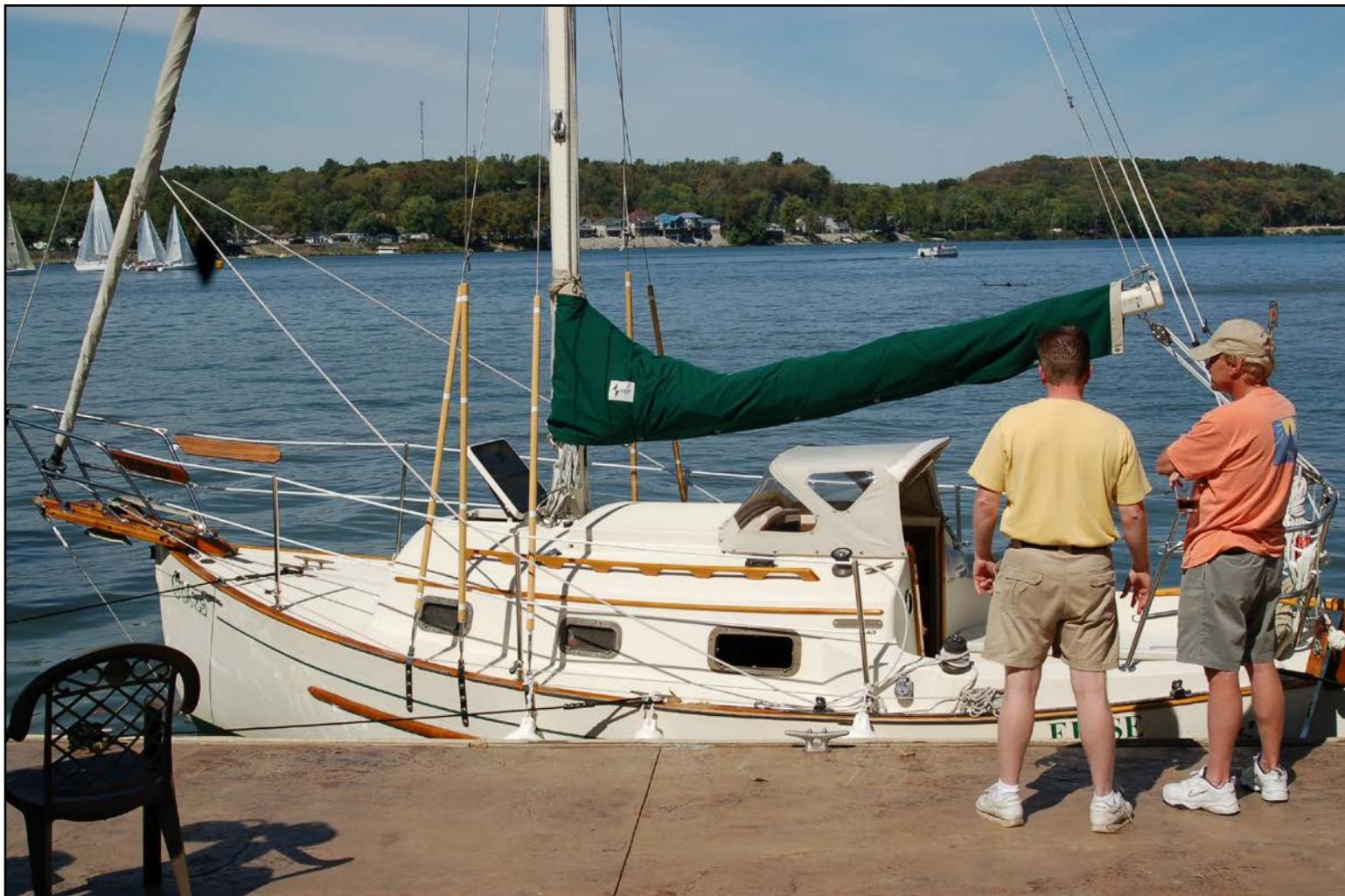
4. Admiring my Flicka: s/y ELISE .