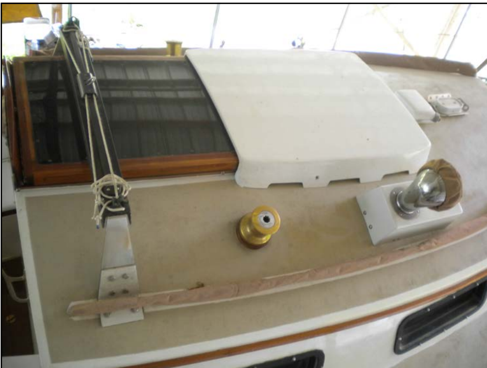
13. Midships main traveler.