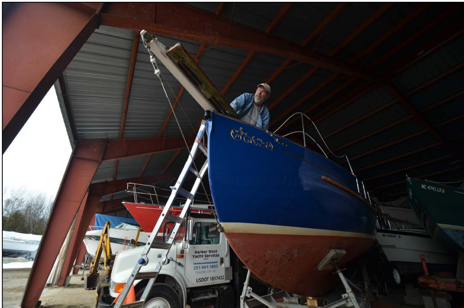
15. Michigan March bowsprit maintenance for s/y ZANZIBAR.