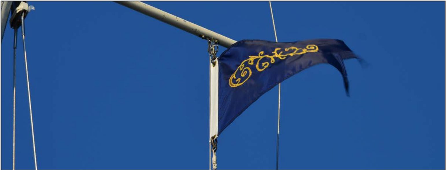
17. Flicka 20 Burgee flying on the starboard spreader of s/y ZANZIBAR on Grand Traverse Bay.