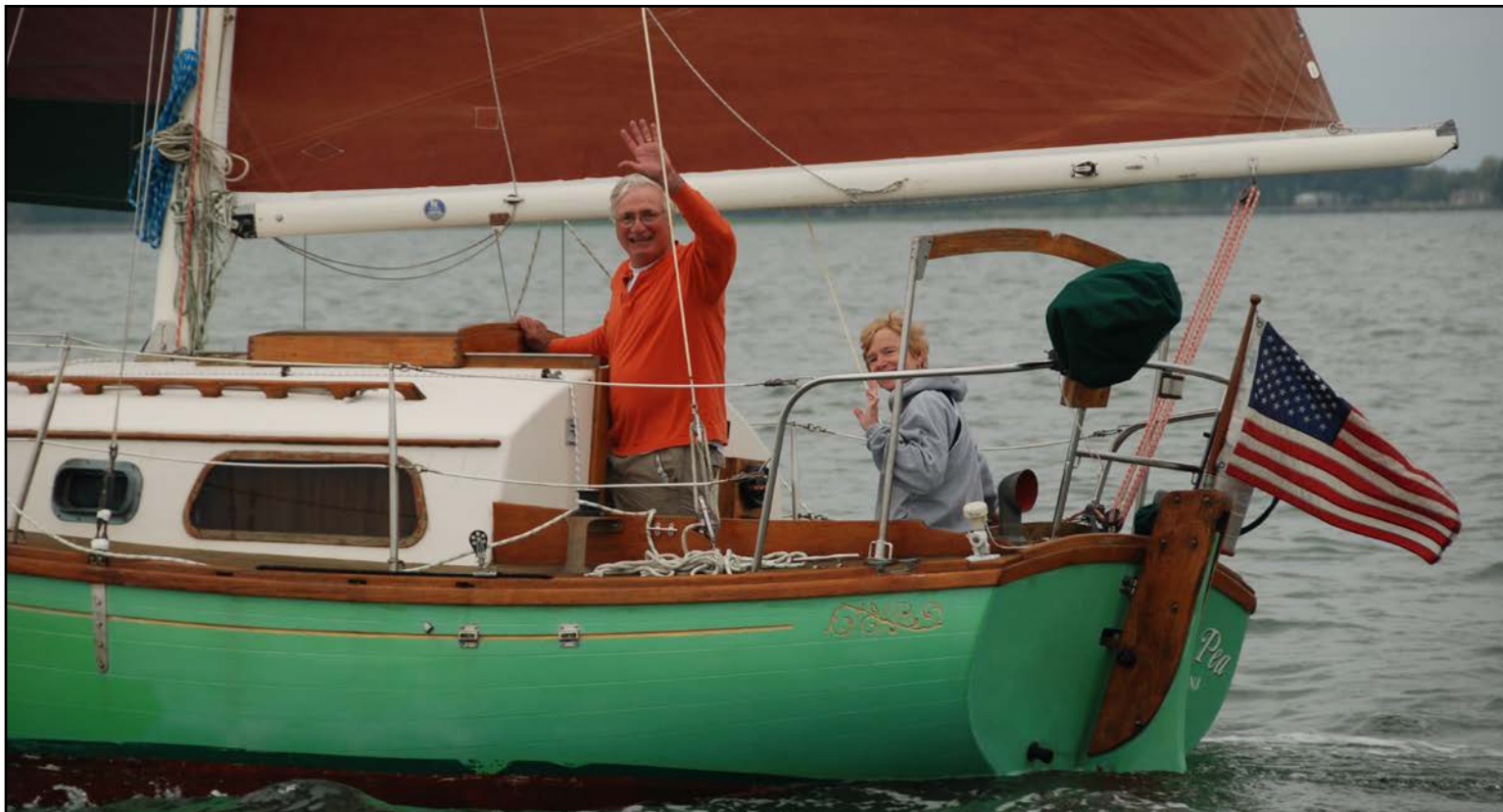
7. Fine Flicka sailing aboard s/y SWEET PEA on Chesapeake Bay.