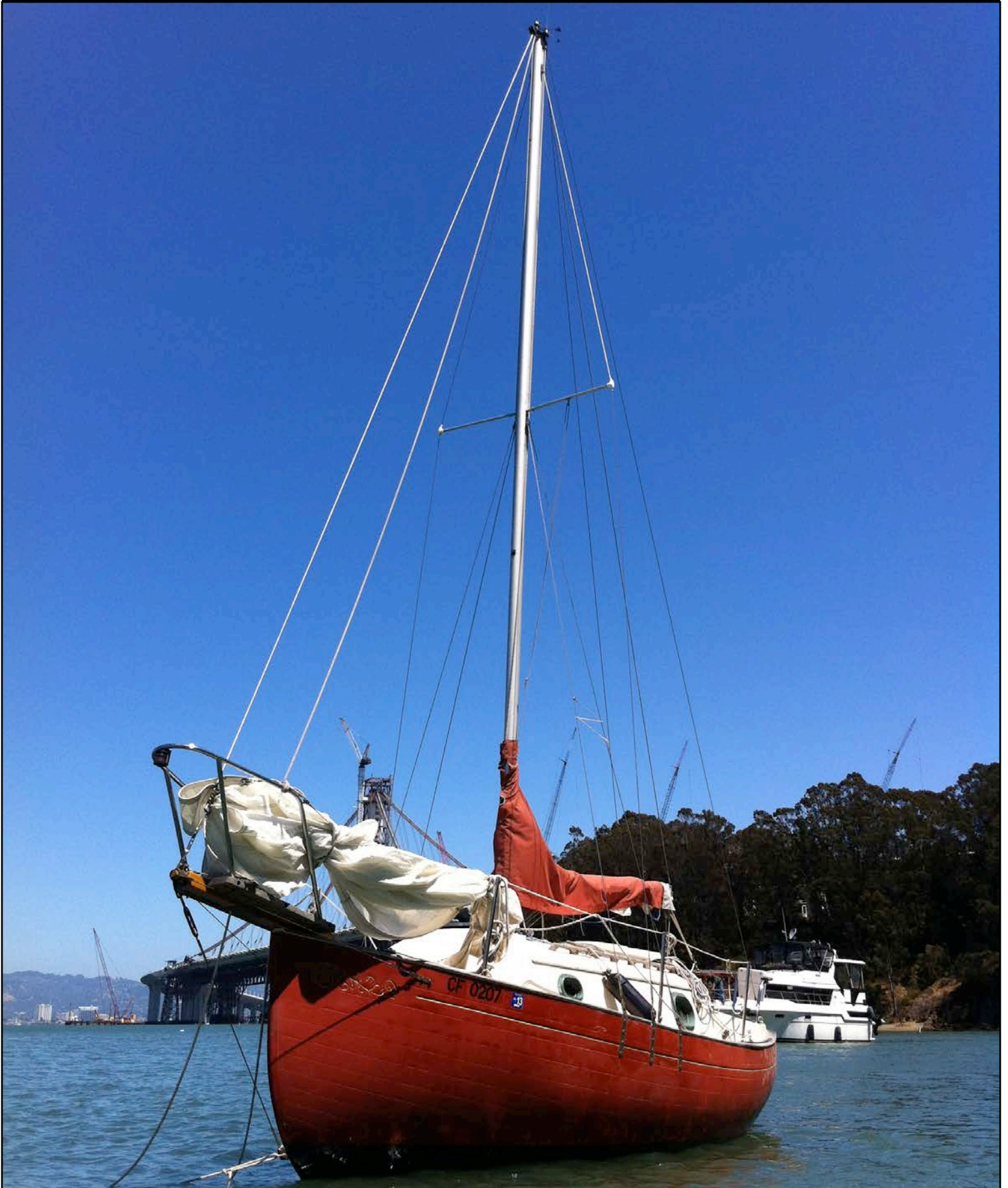
19. WHISPER moored in Clipper Cove on Treasure Island in San Francisco Bay.