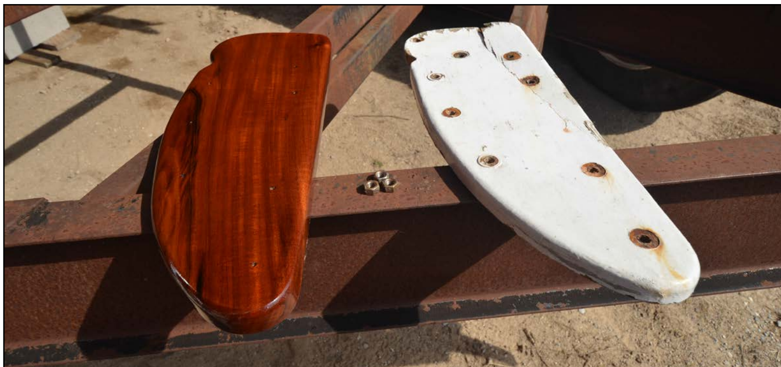
16. New varnished mahogany rudder cheeks for s/y ZANZIBAR.