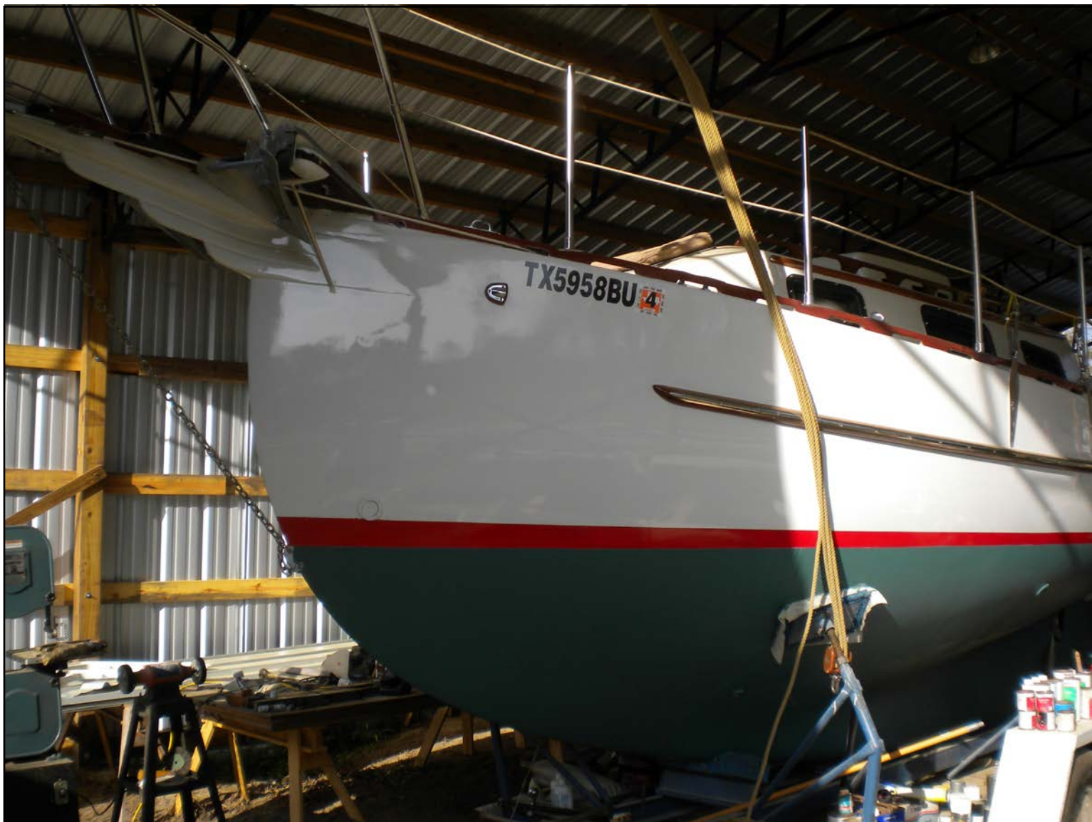
8. A labor of love...forty years old and never got wet. That will change for s/y ENTERPRISE very soon.