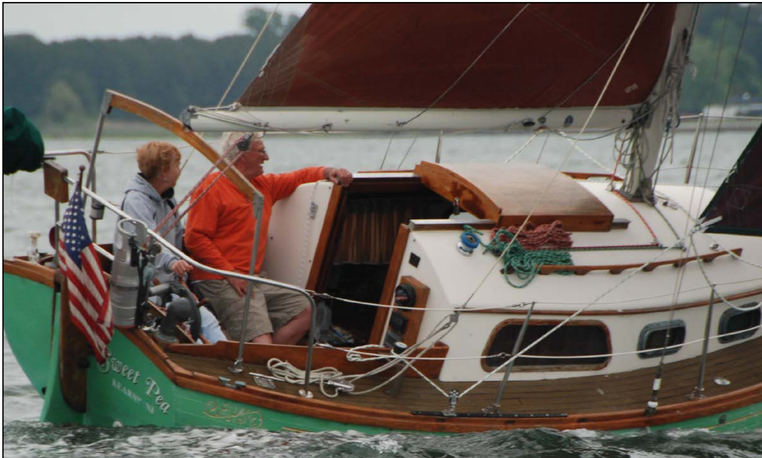
6. SWEET PEA on a glorious broad reach up the Choptank from the Chesapeake to Oxford and her home