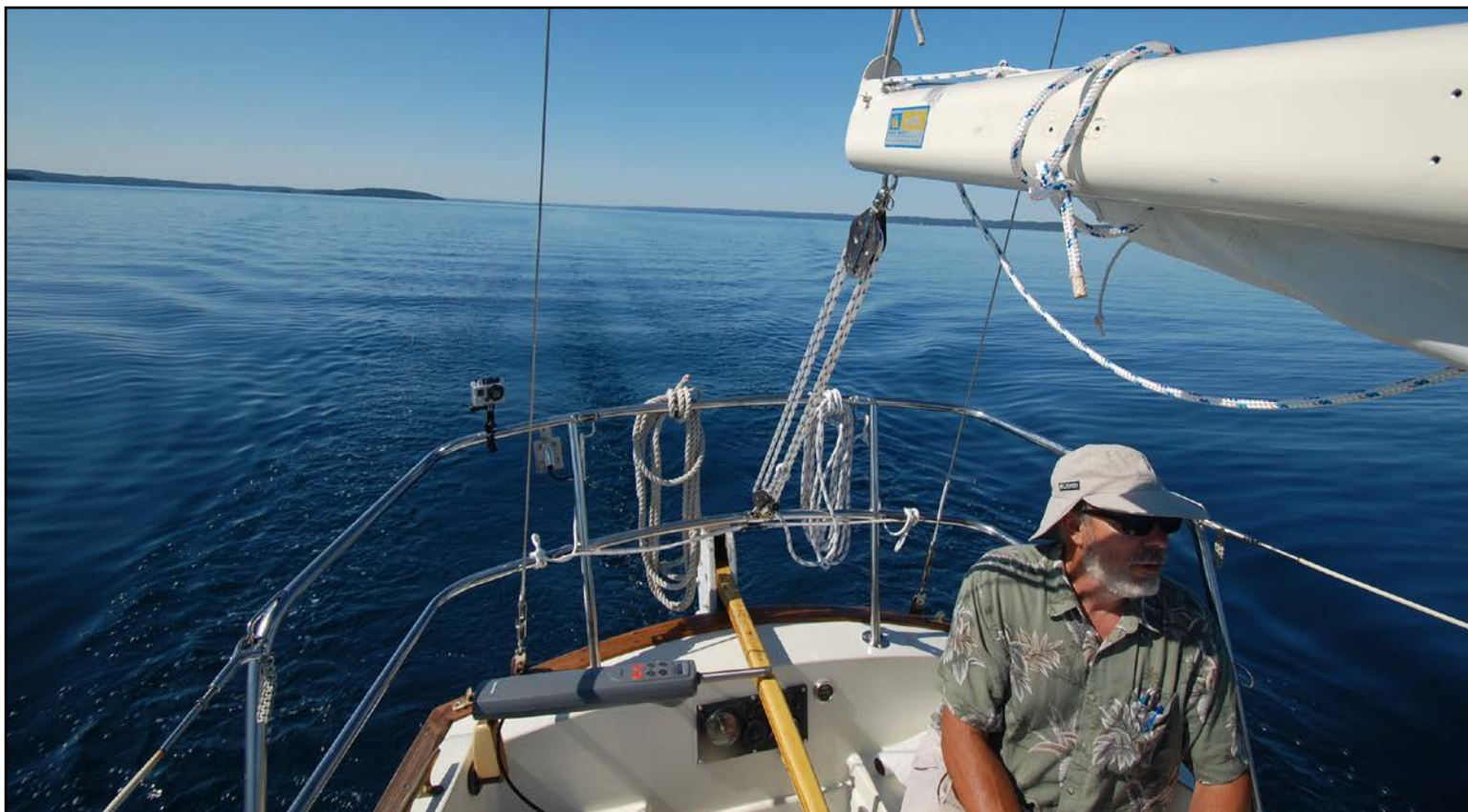
5. Motoring in calm conditions with the autopilot doing the work: s/y ZANZIBAR .