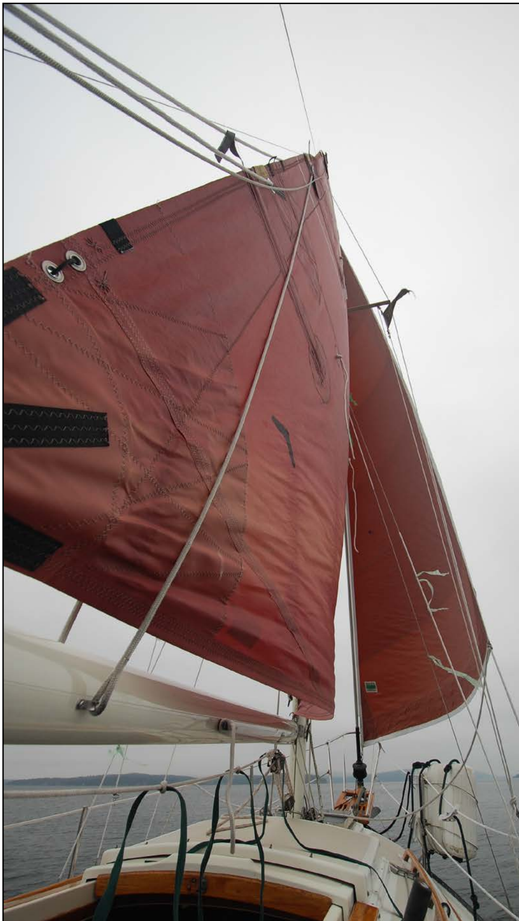
3. Sailing s/y BLUE SKIES near San Juan Island, Washington.

Desktop: tom@syblueskies.com iPAD: syblueskies@icloud.com