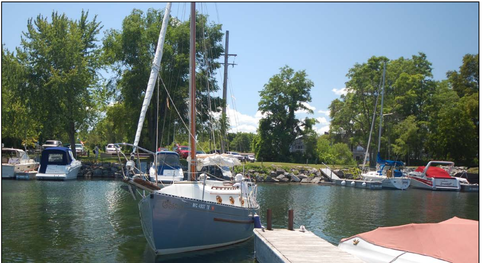
9. Backing out of the dock for an overnight trip to Northport, MI aboard s/y BEN MAIN, Jr. and s/y ZANZIBAR.