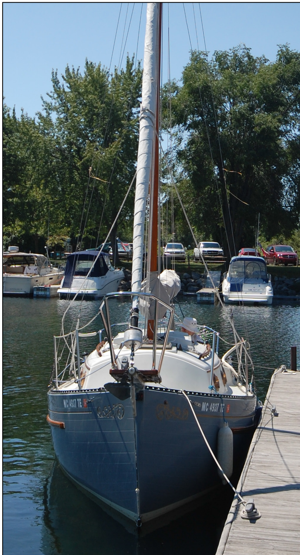
2. BEN MAIN, Jr. at the docks in Suttons Bay, MI. Photo: Tom Davison © 2013

Predawn motoring in East Bay, Grand Traverse Bay, Lake Michigan aboard s/y ZANZIBAR. Photo: Tom Davison © 2013