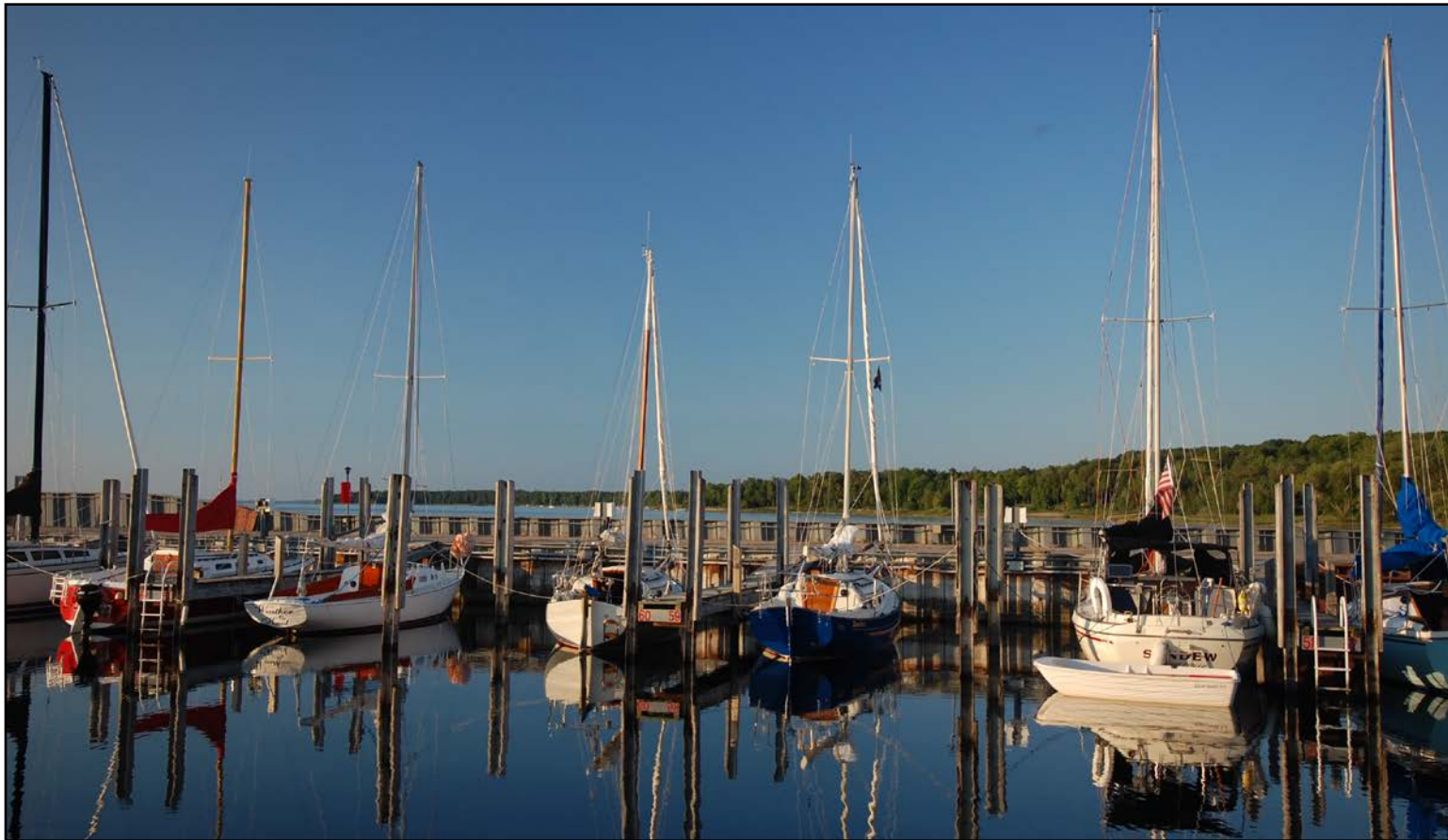
10. Two Flickas at the marina in Northport, Michigan: s/y BEN MAIN, Jr. and s/y ZANZIBAR.