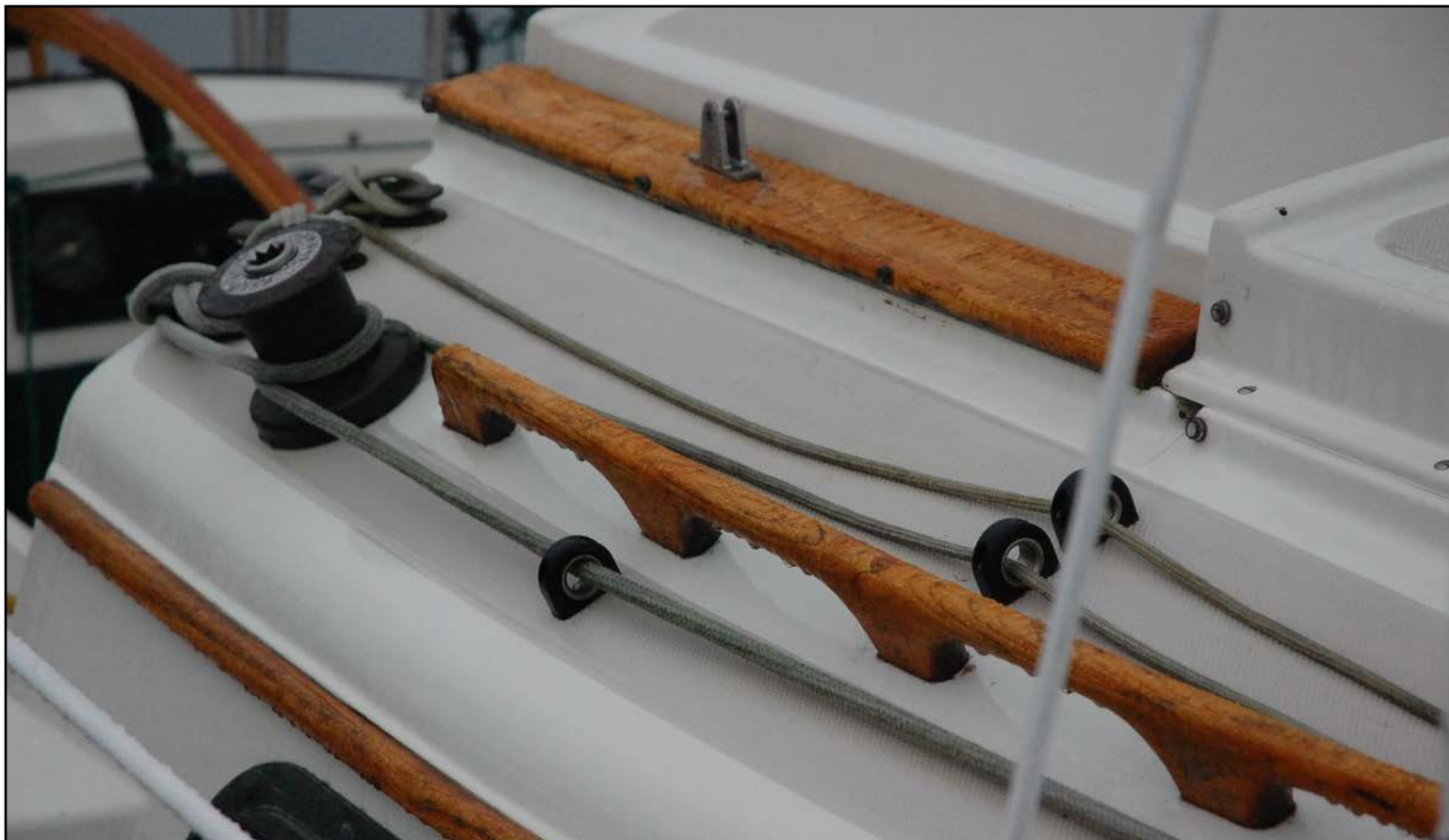
16. Another rainy day aboard s/y BLUE SKIES at Lopez Island, Washington.