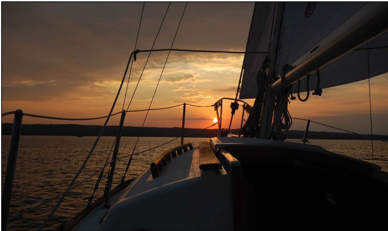
12. Sunset sailing on Grand Traverse Bay: s/y ZANZIBAR .