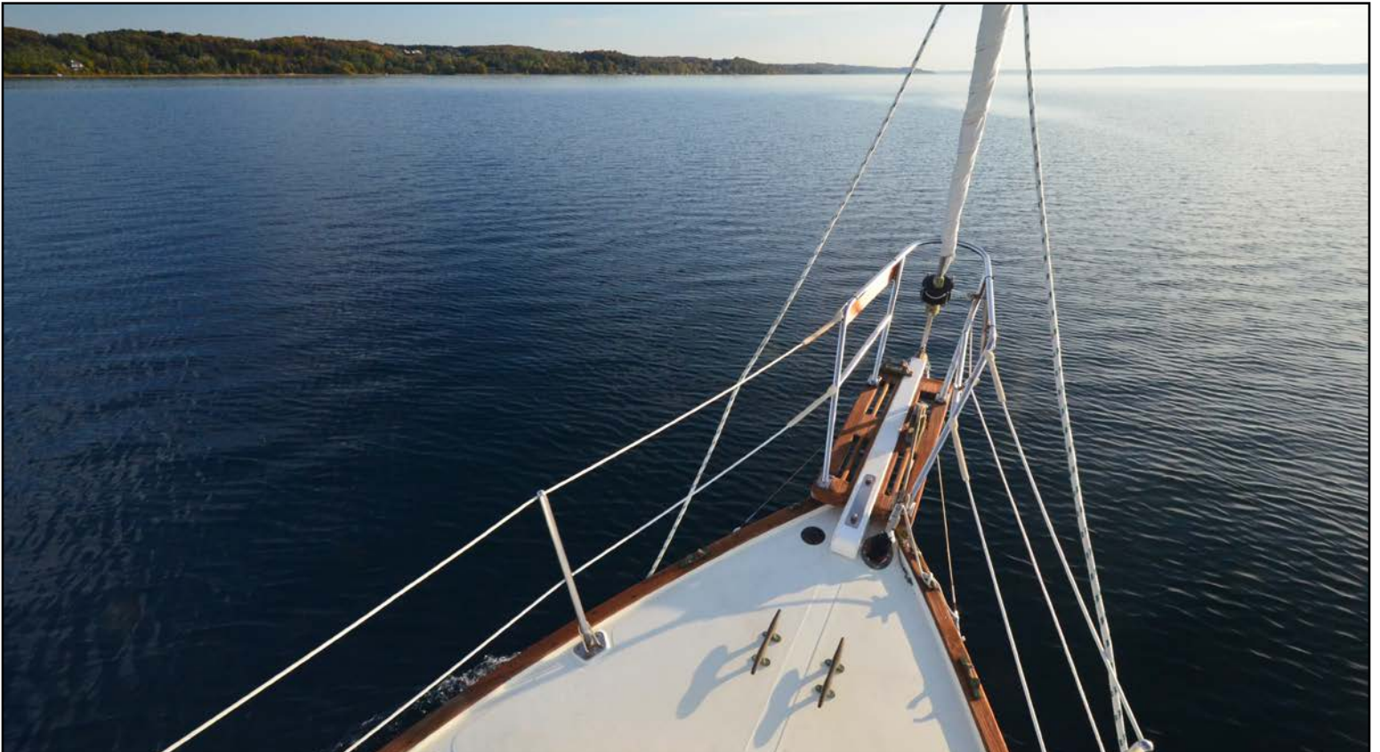
7. Southbound near Power Island on Flicka # 387, s/y ZANZIBAR .