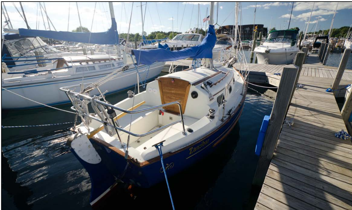
4. Wishing for summer on the Great Lakes, s/y ZANZIBAR is currently in winter storage.