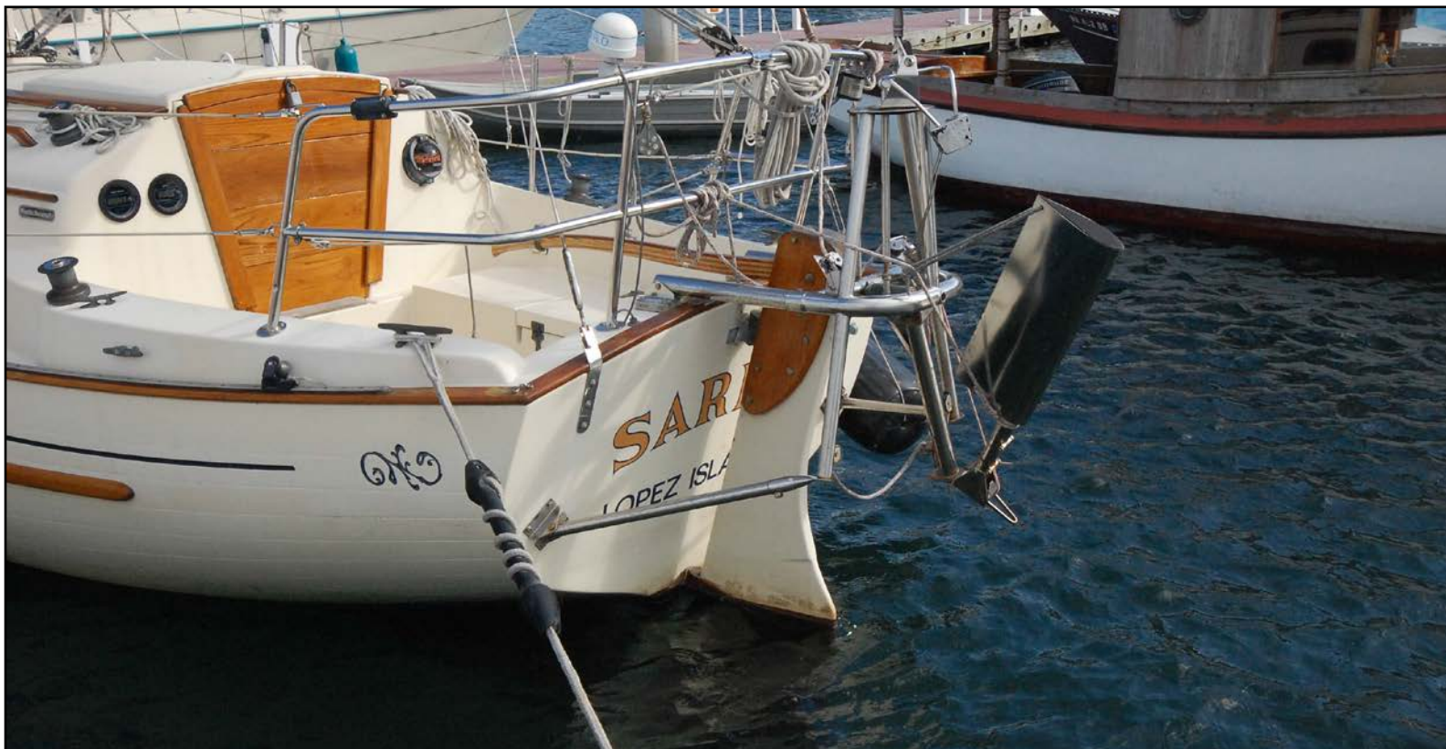
17. SARNIA at the Galley Dock on Lopez Island, Washington.