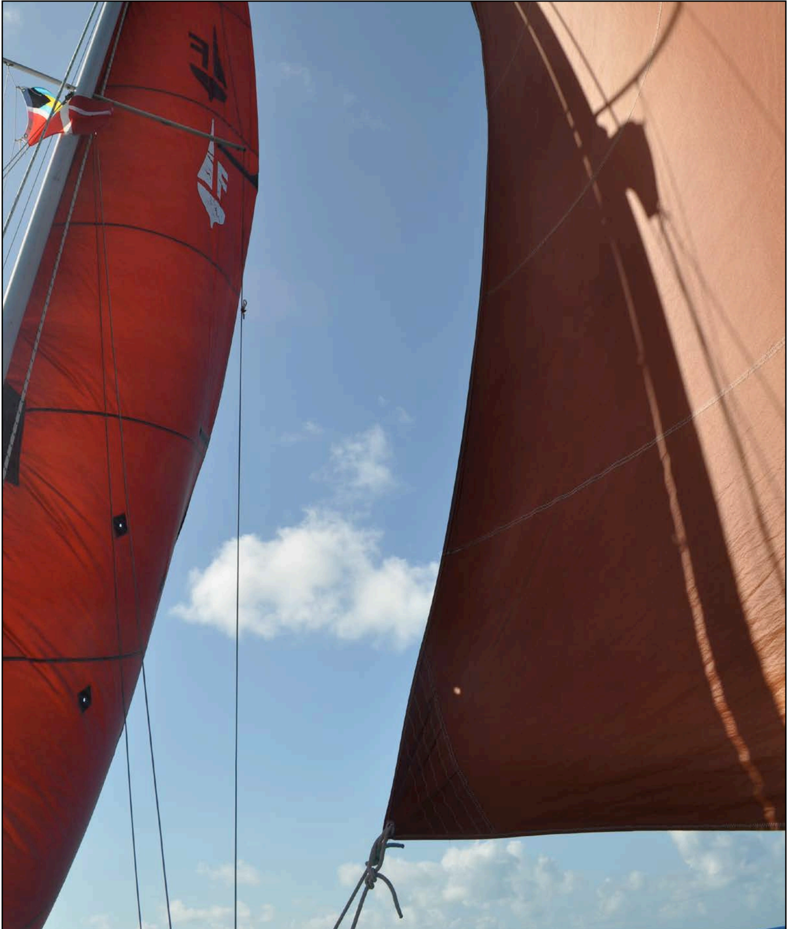
18. Tanbark sails and a Bahamas Courtesy Flag on s/y DAISY .