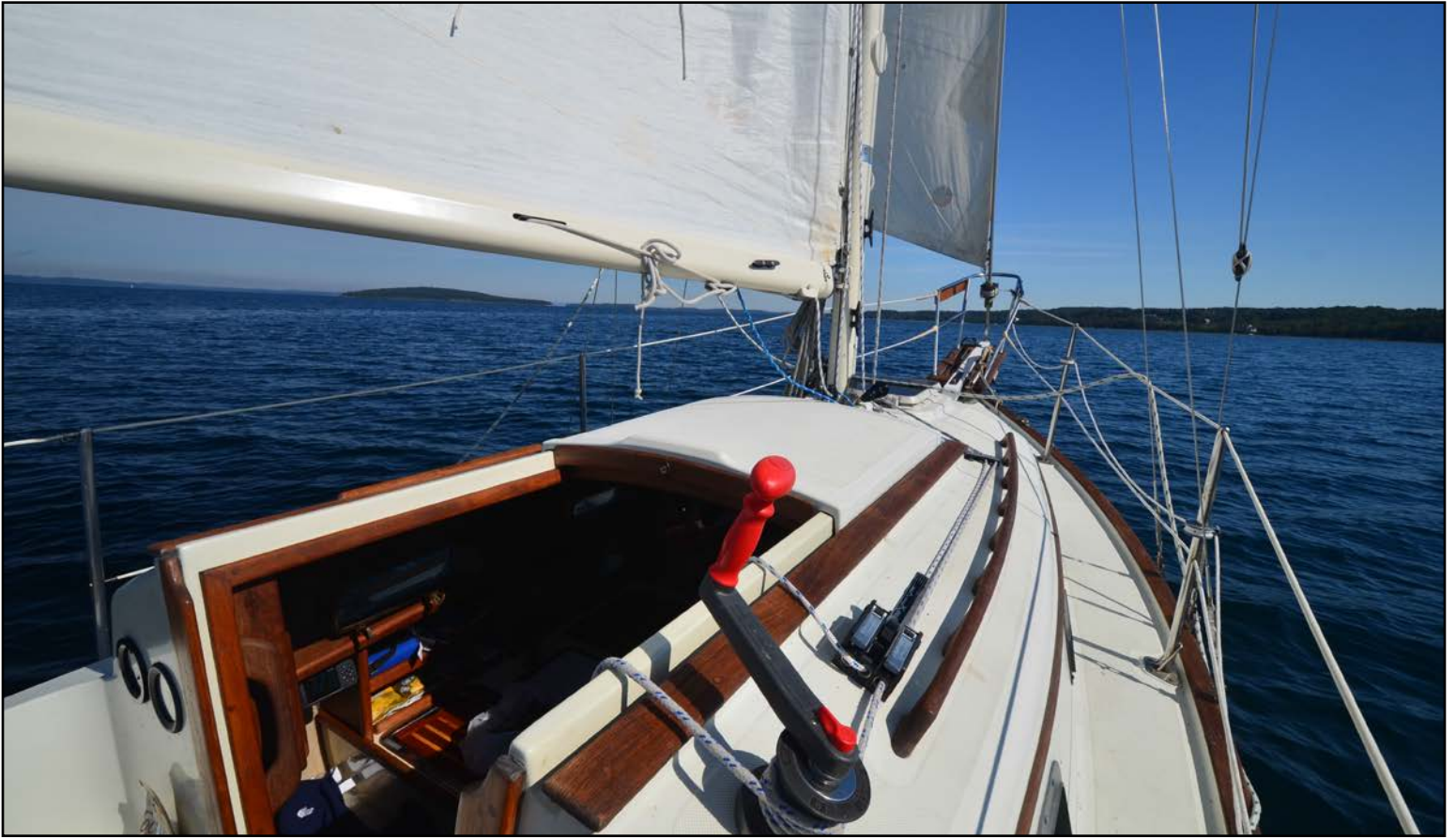
6. Heading toward Power Island aboard s/y ZANZIBAR .