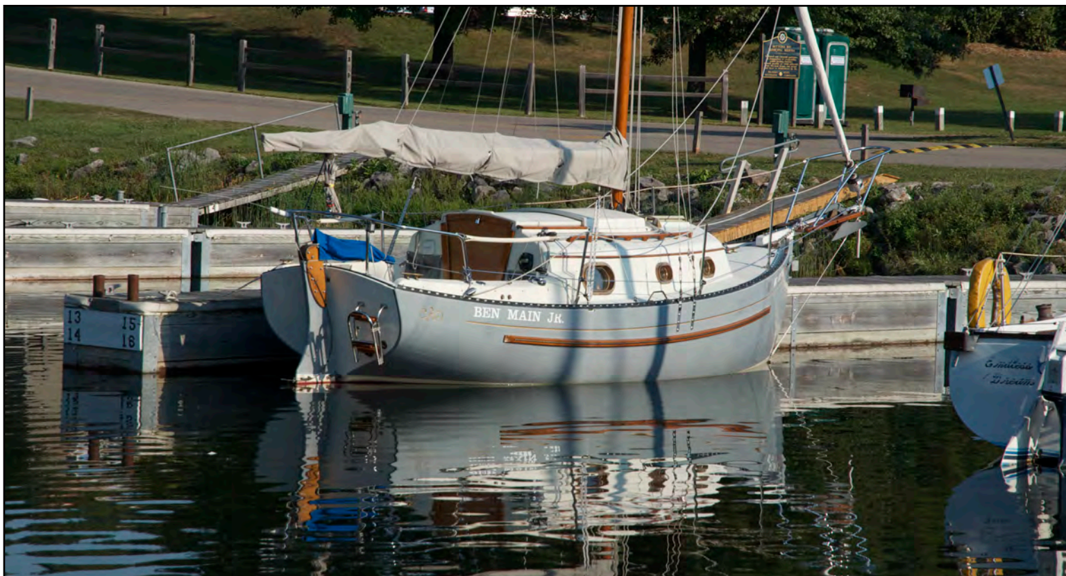
BEN MAIN, Jr. (a wood sparred bald-headed gaff rigged cutter) at the docks in Suttons Bay, Michigan.