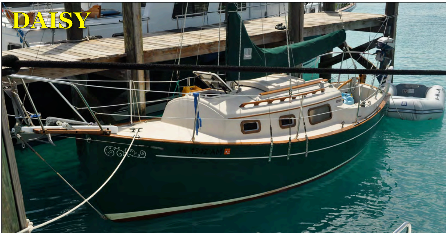
Pacific Seacraft Flicka # 101, s/y DAISY at Compass Cay, Exumas, Bahamas.