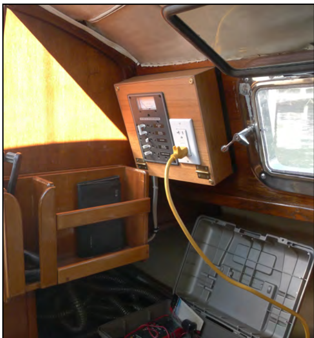
New Breaks and AC Outlet aboard s/y MARGALIT .