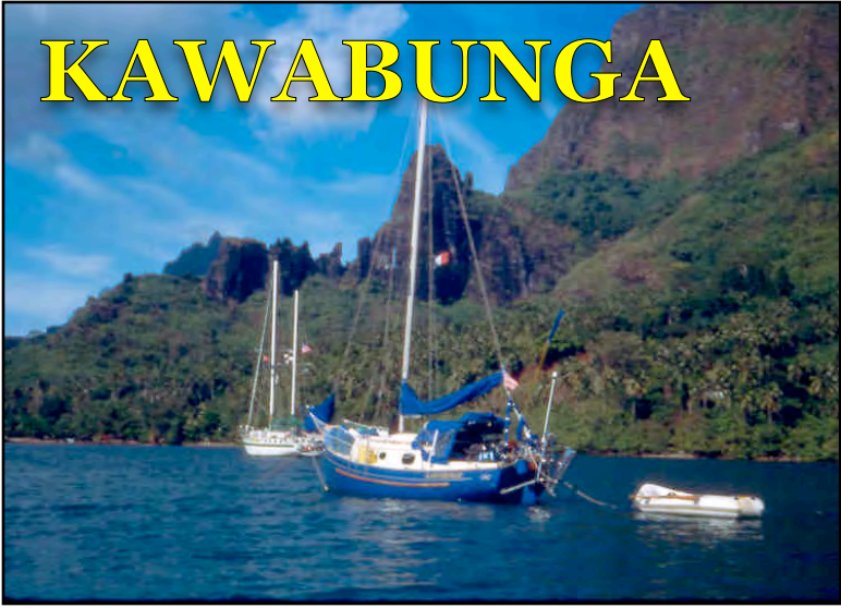
KAWABUNGA in Cook's Bay, Moorea.