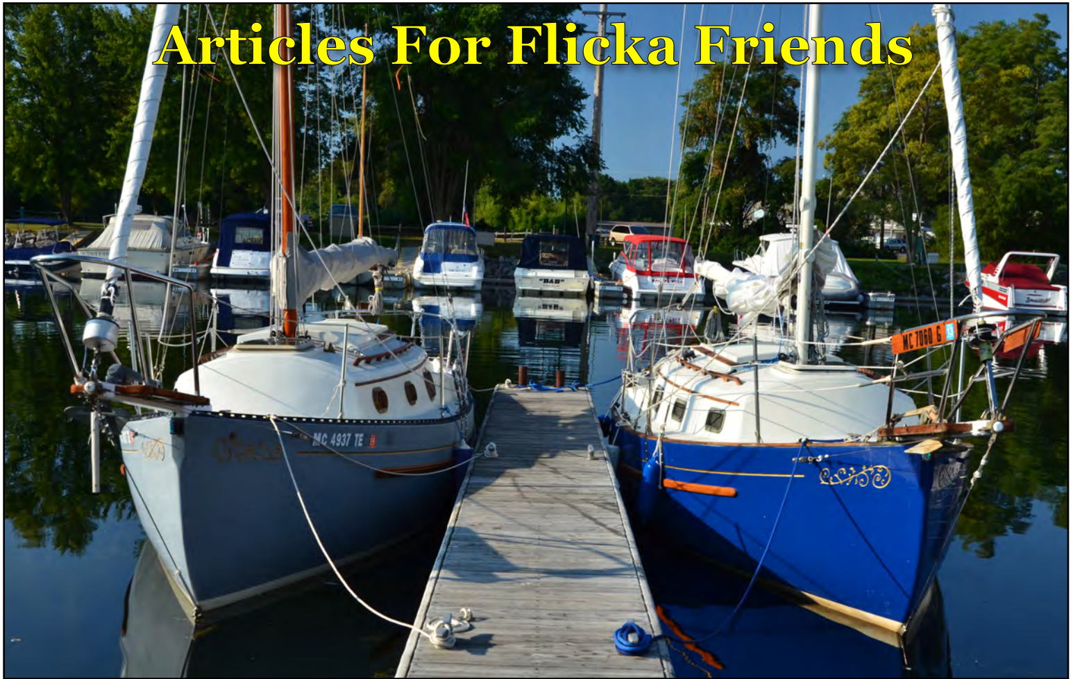
Two Flickas (s/y BEN MAIN, Jr. and s/y ZANZIBAR ) at Suttons Bay, Michigan.