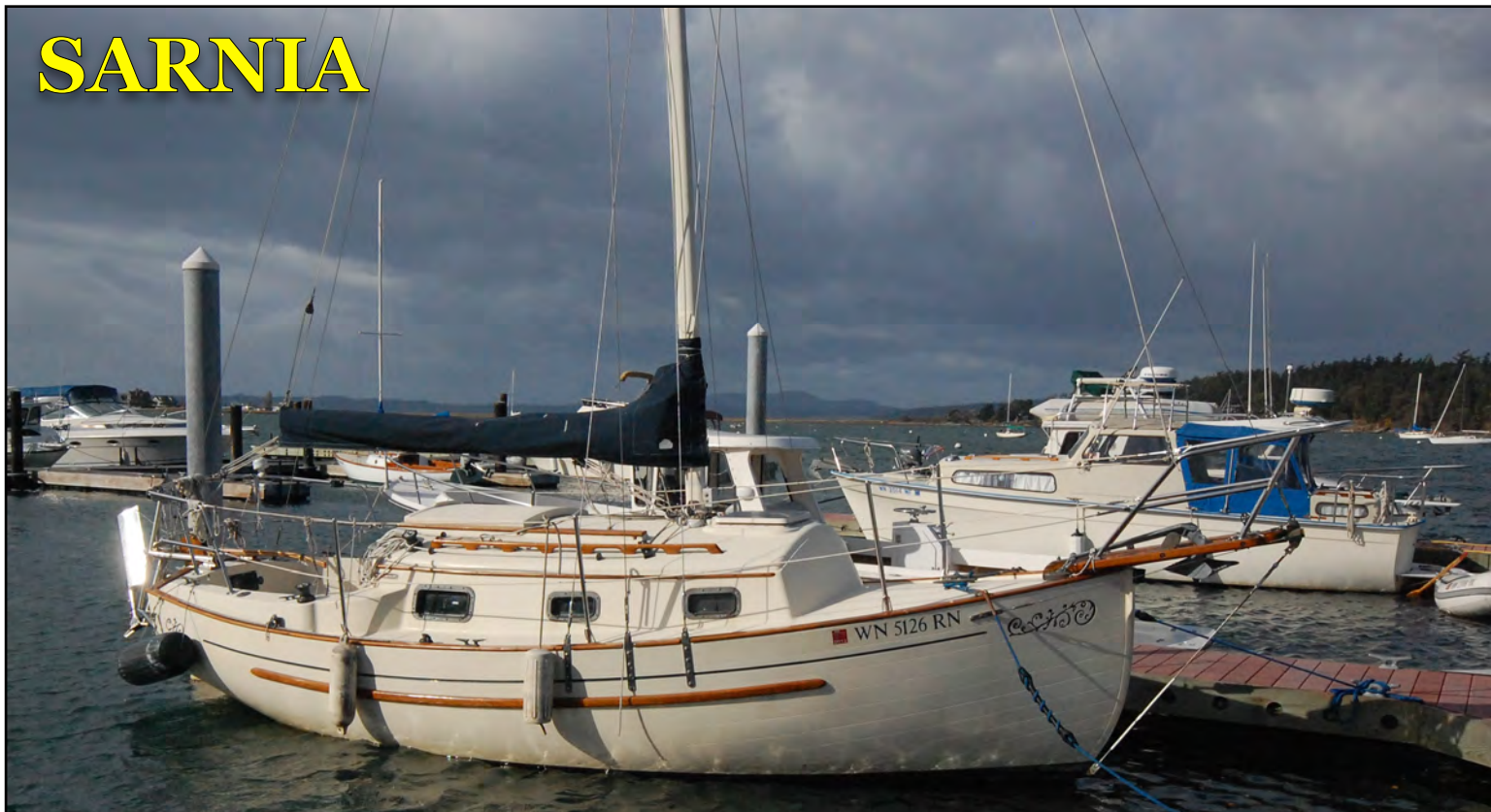
Just before leaving Lopez Island, I was told about another Flicka in the bay. It was s/y SARNIA.