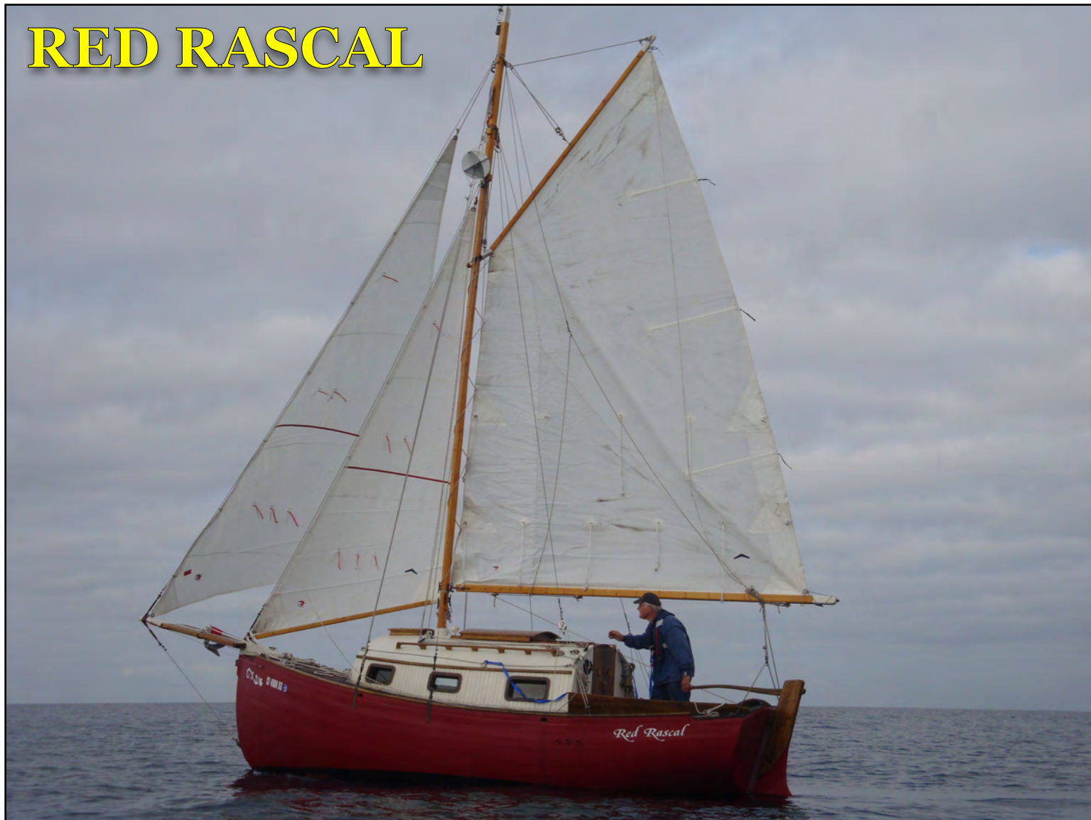
Sailing my bald-headed gaff-rigged cutter: s/y RED RASCAL .