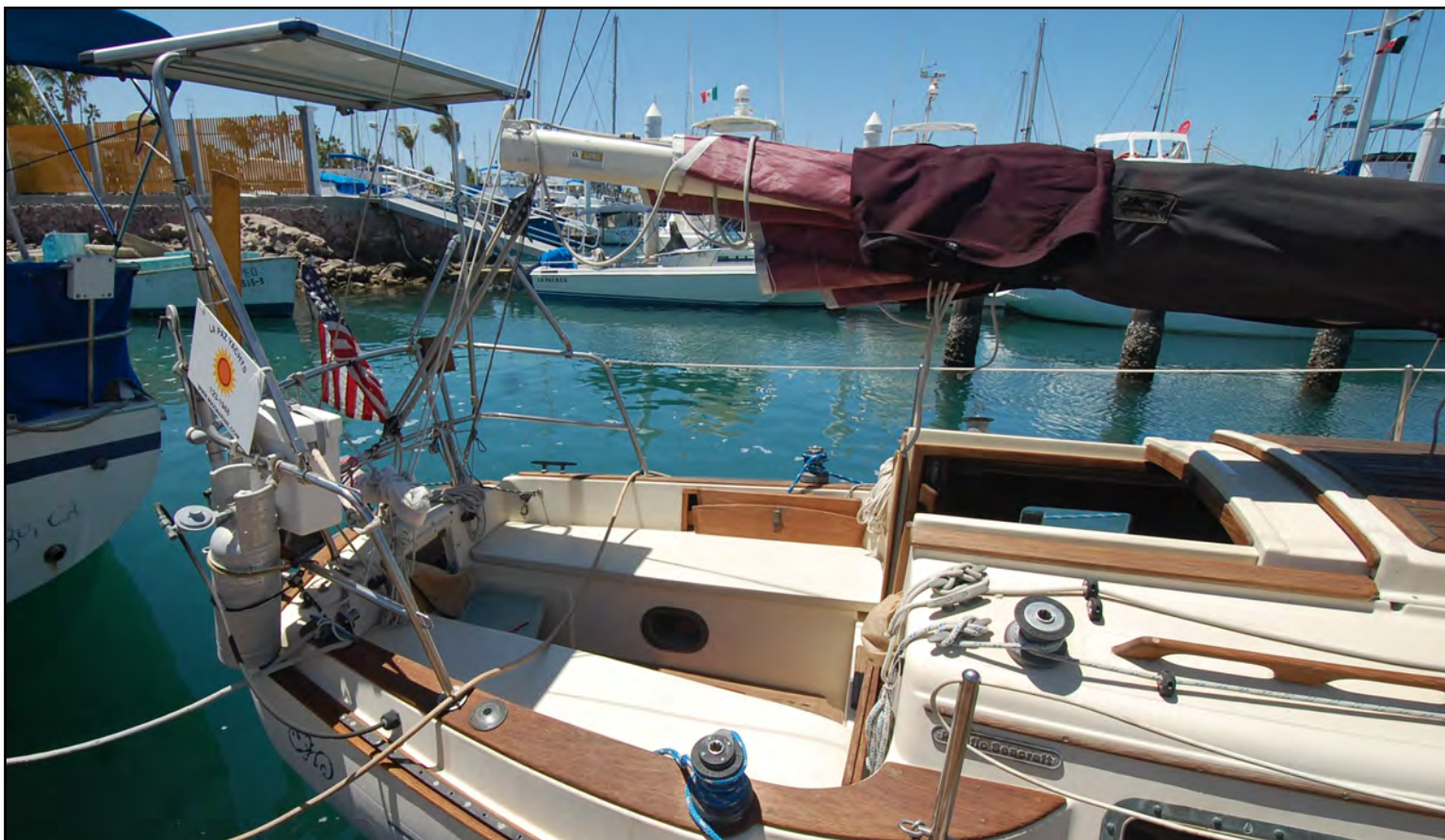
Well equipped with a wind vane, propane stove, and solar panel, s/y DULCINEA recently got a new owner.