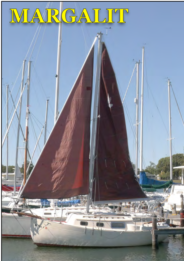
Flicka # 87: s/y MARGALIT at the docks in Irvington, VA