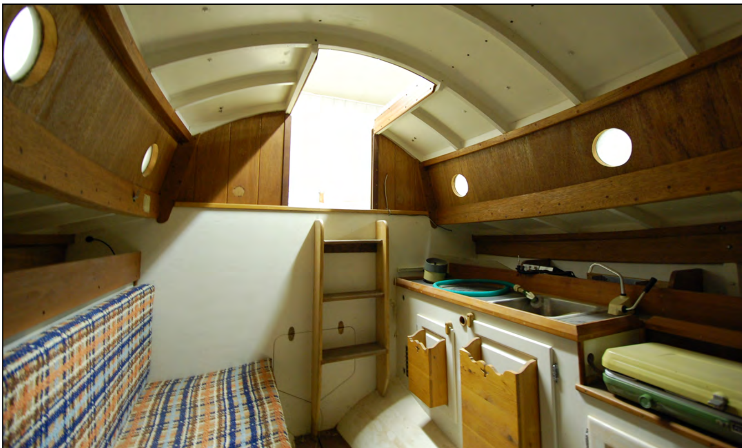
With Lake Michigan sailing under her keel, s/y NINA is now a Flicka that needs a new captain.