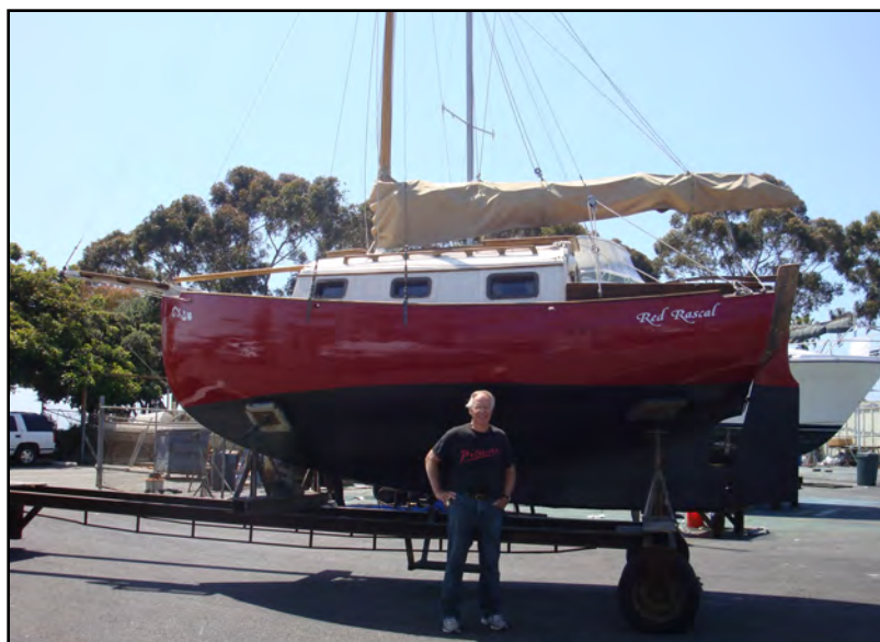
Ready to launch s/y RED RASCAL .