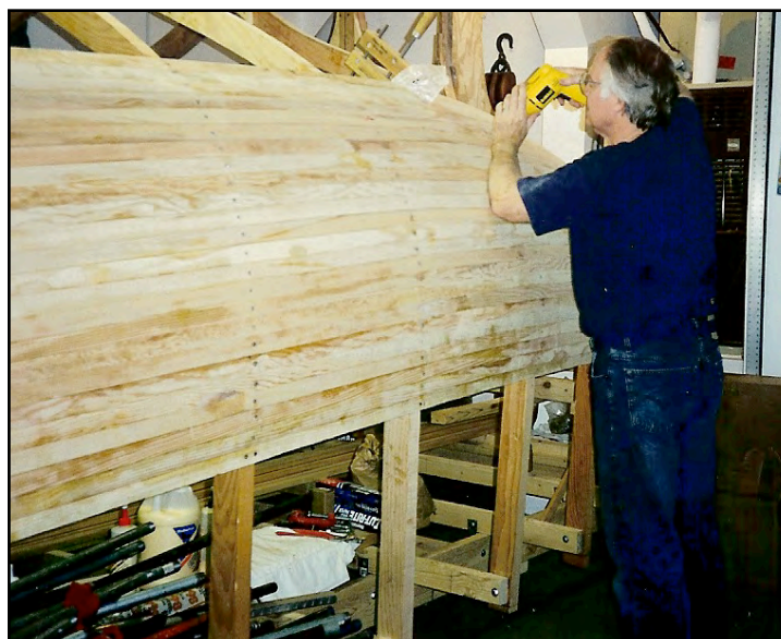
Building my Flicka: s/y RED RASCAL .