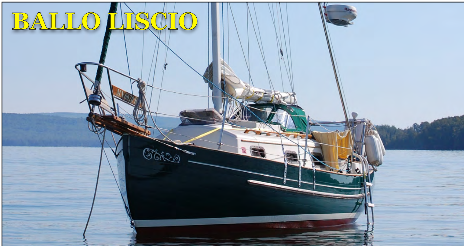
Daryl Clark's Flicka s/y BALLO LISCIO .