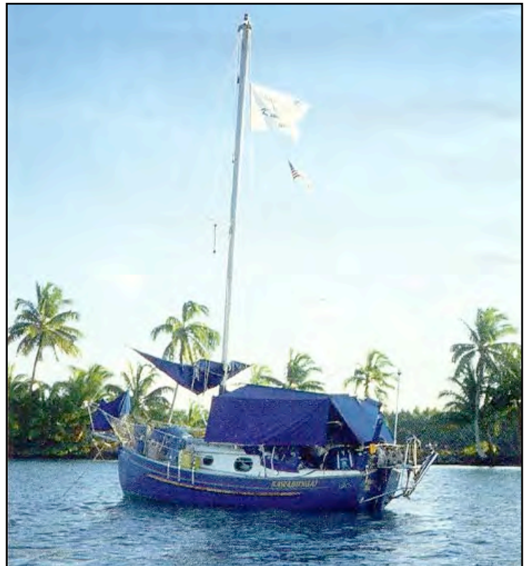
KAWABUNGA anchored in the center lagoon in Palmyra.