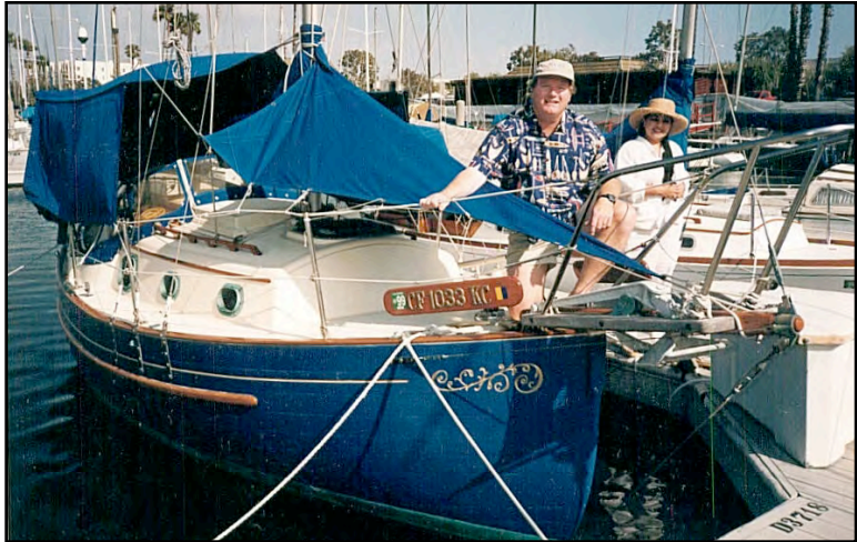
Getting ready aboard s/y KAWABUNGA .