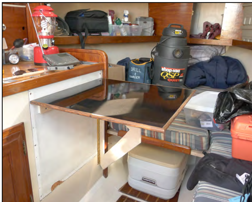
Note the folding table support on s/y MARGALIT .