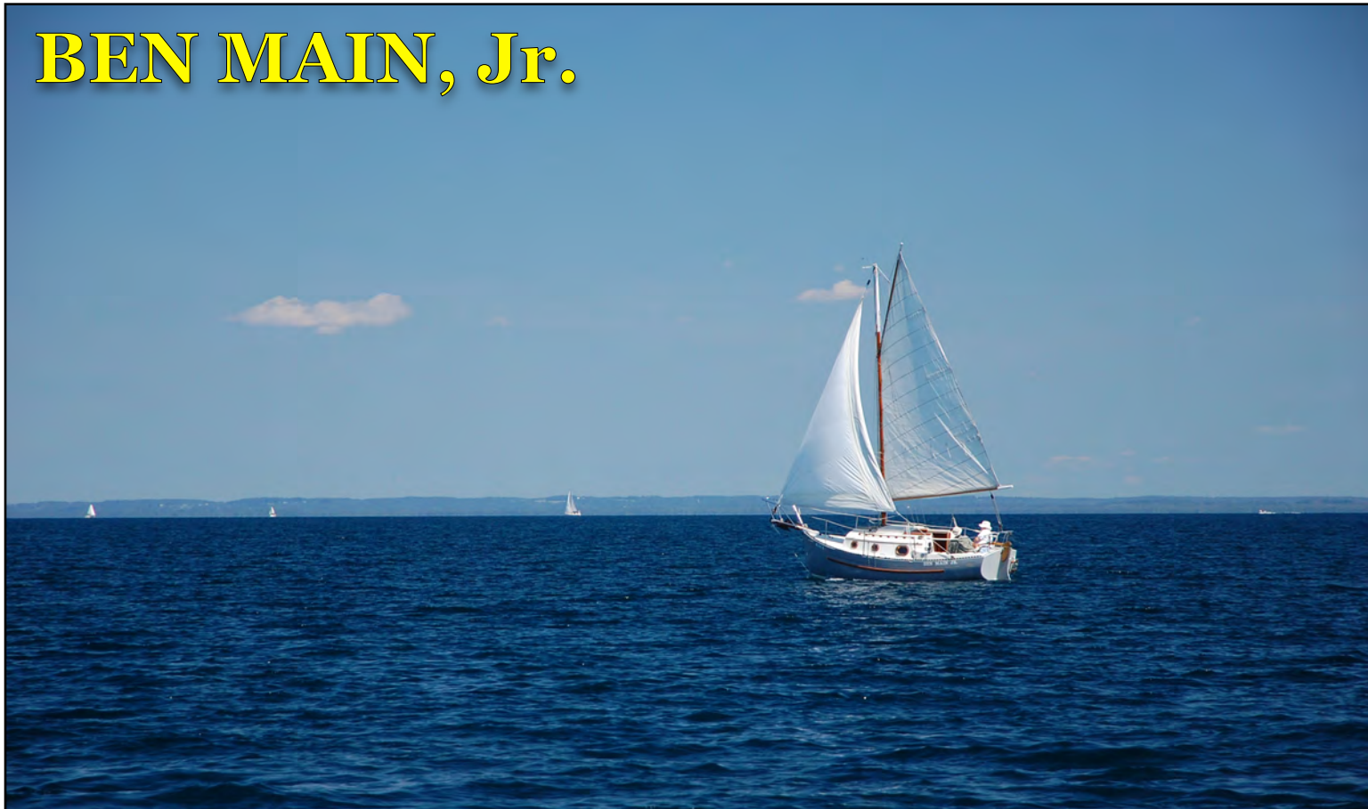
Heading to Northport from Suttons Bay, Michigan near Omena Point aboard s/y BEN MAIN, Jr.