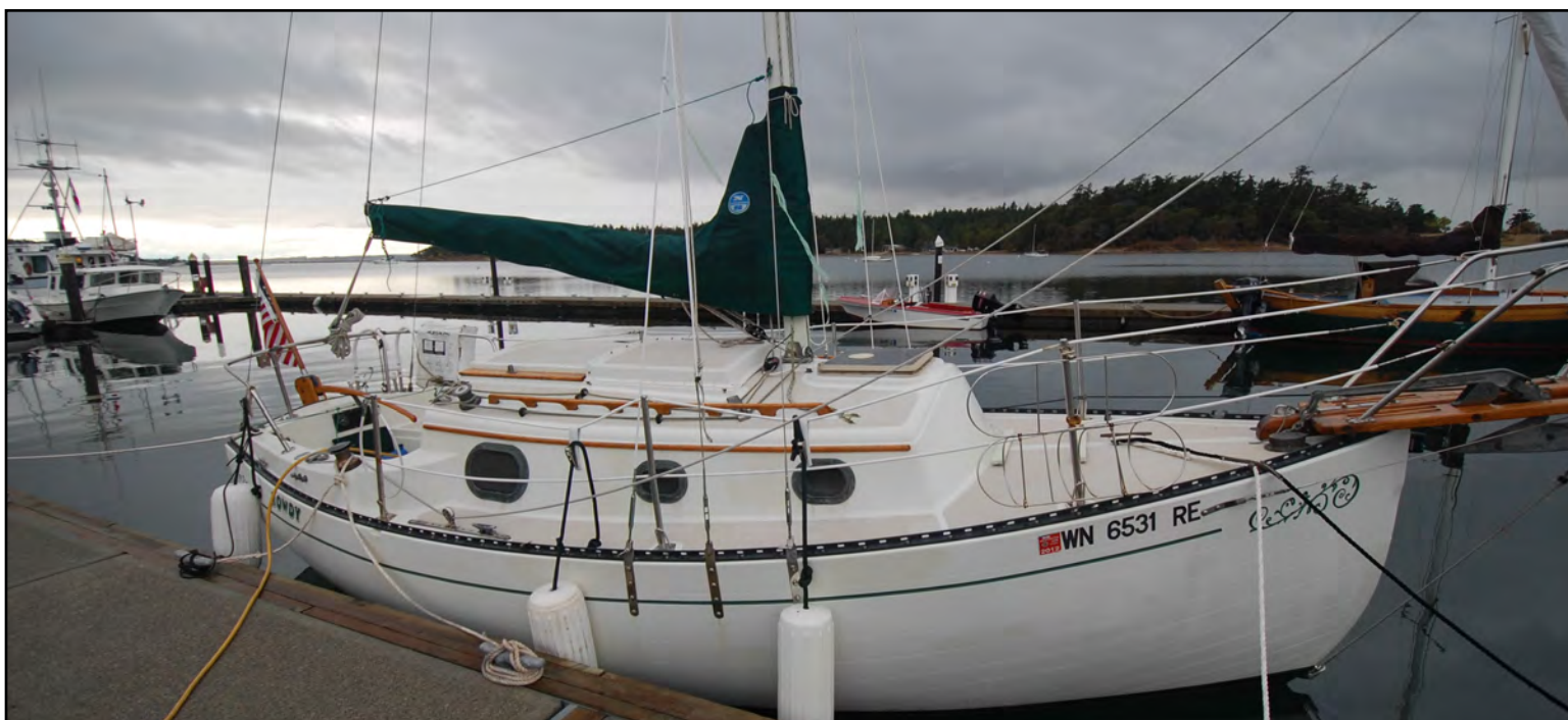
My Flicka at the dock on Lopez Island. The name will be changed in the spring after a proper ceremony.