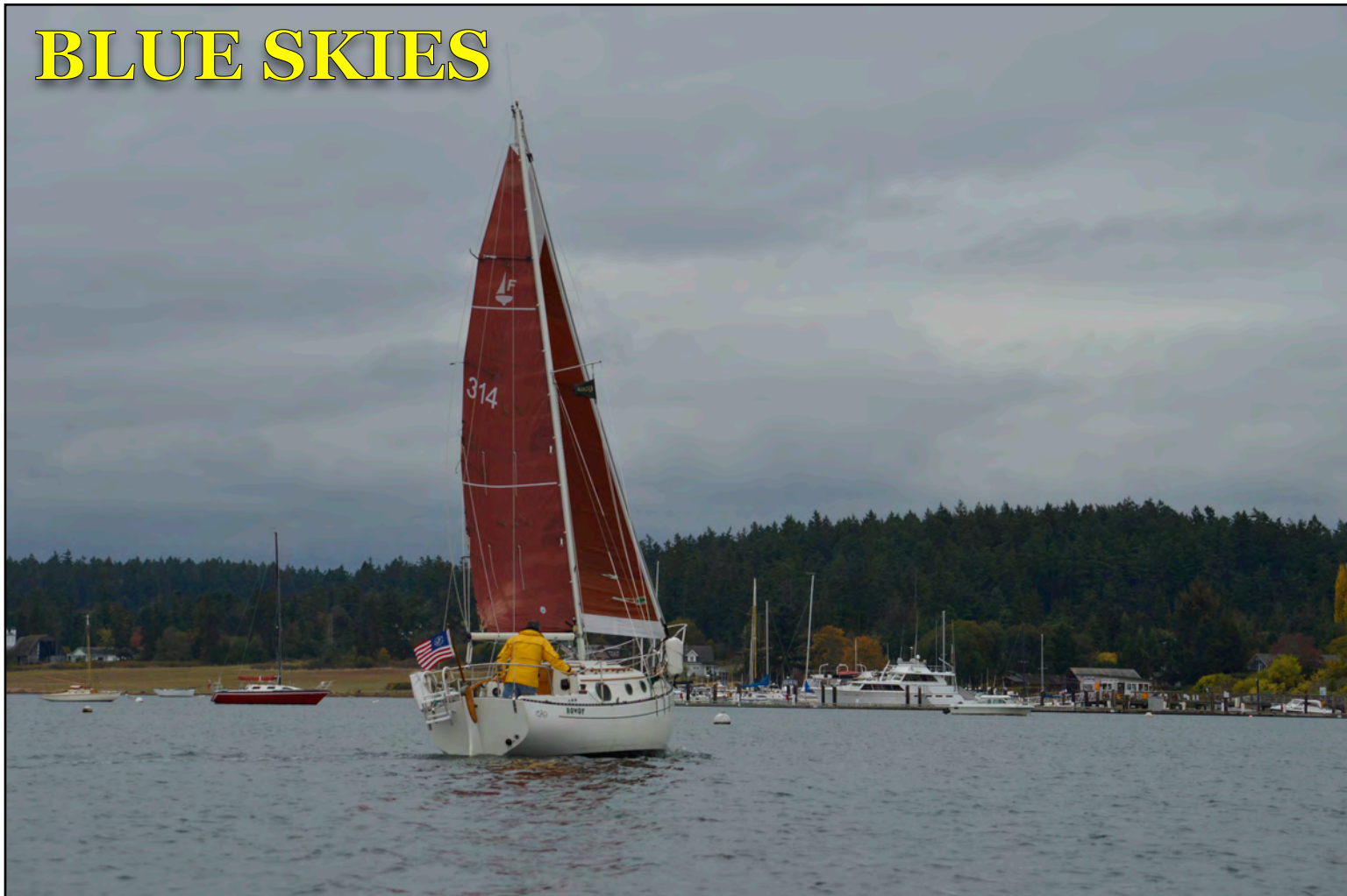
Approaching the dock on my first trip aboard s/y BLUE SKIES in Fisherman's Bay, Lopez Island, Washington.