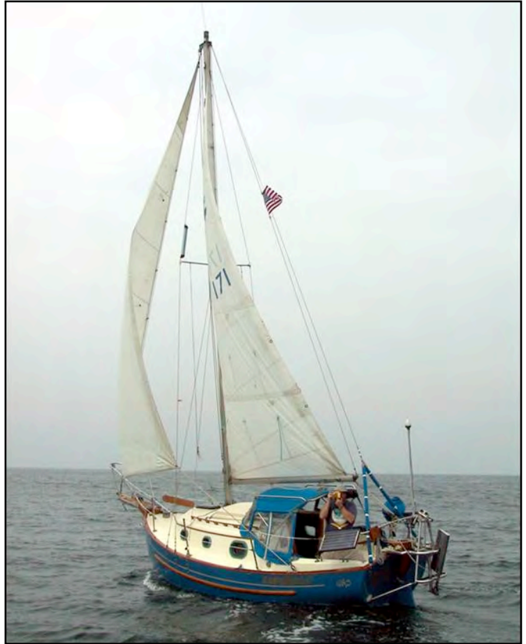
On the way to Catalina: s/y KAWABUNGA . Photo: Charlie Dewell © 2012