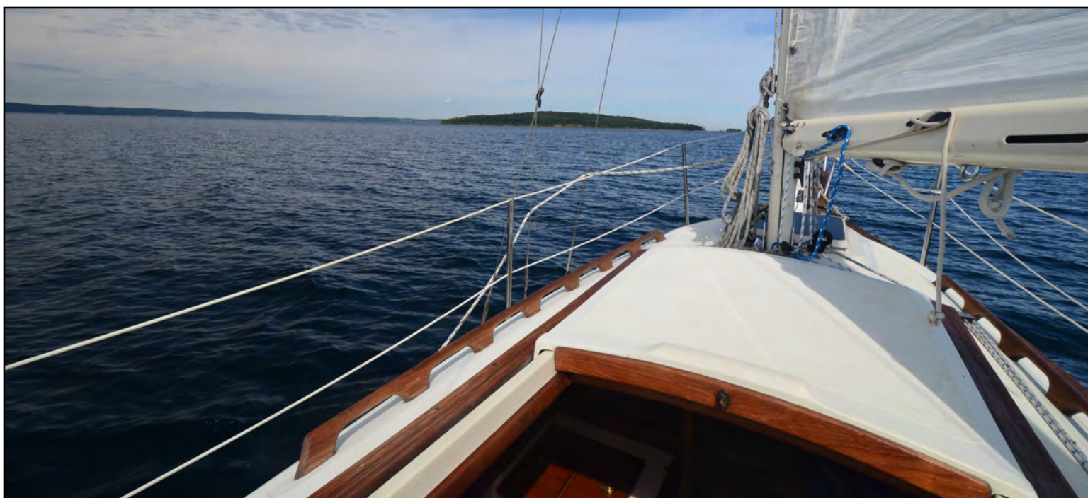
Sailing near Power Island on Grand Traverse Bay, Michigan aboard s/y ZANZIBAR .