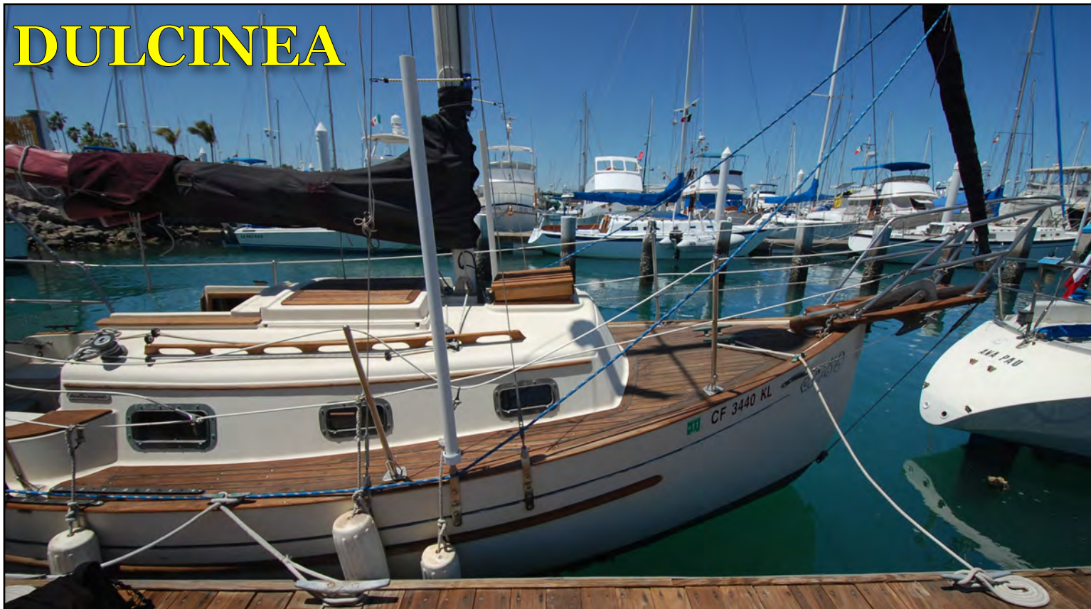
A Flicka in brokerage at the docks in La Paz, Baja California Sur: s/y DULCINEA .