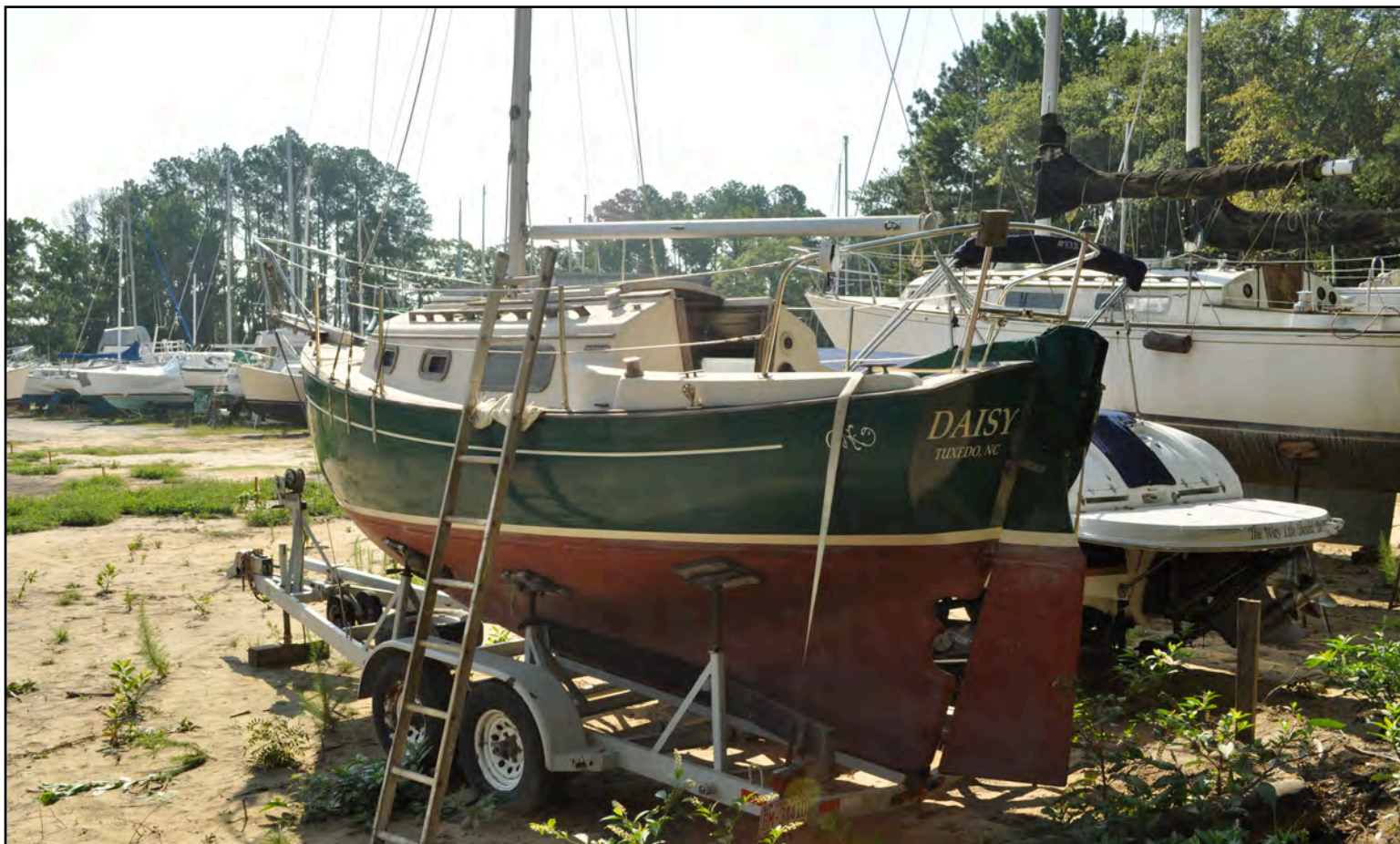
Photo of s/y DAISY on a Triad trailer when she was purchased.