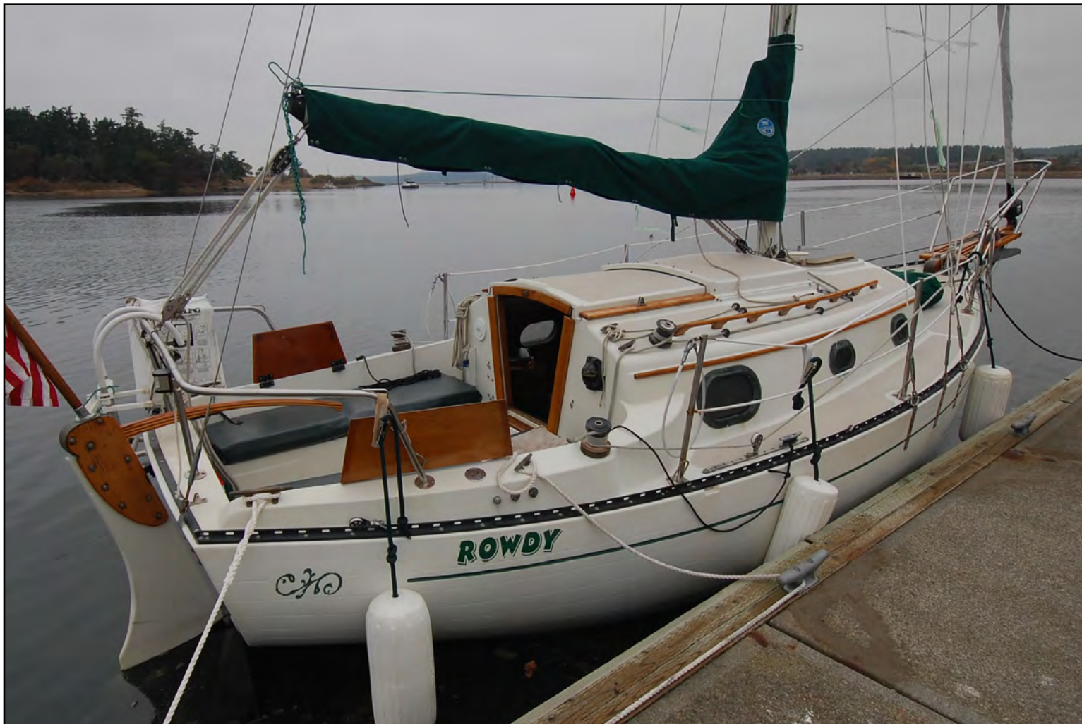
My Flicka at the dock in Fisherman's Bay on Lopez Island.

in the spring, summer, fall and winter with the deadlines as follows: