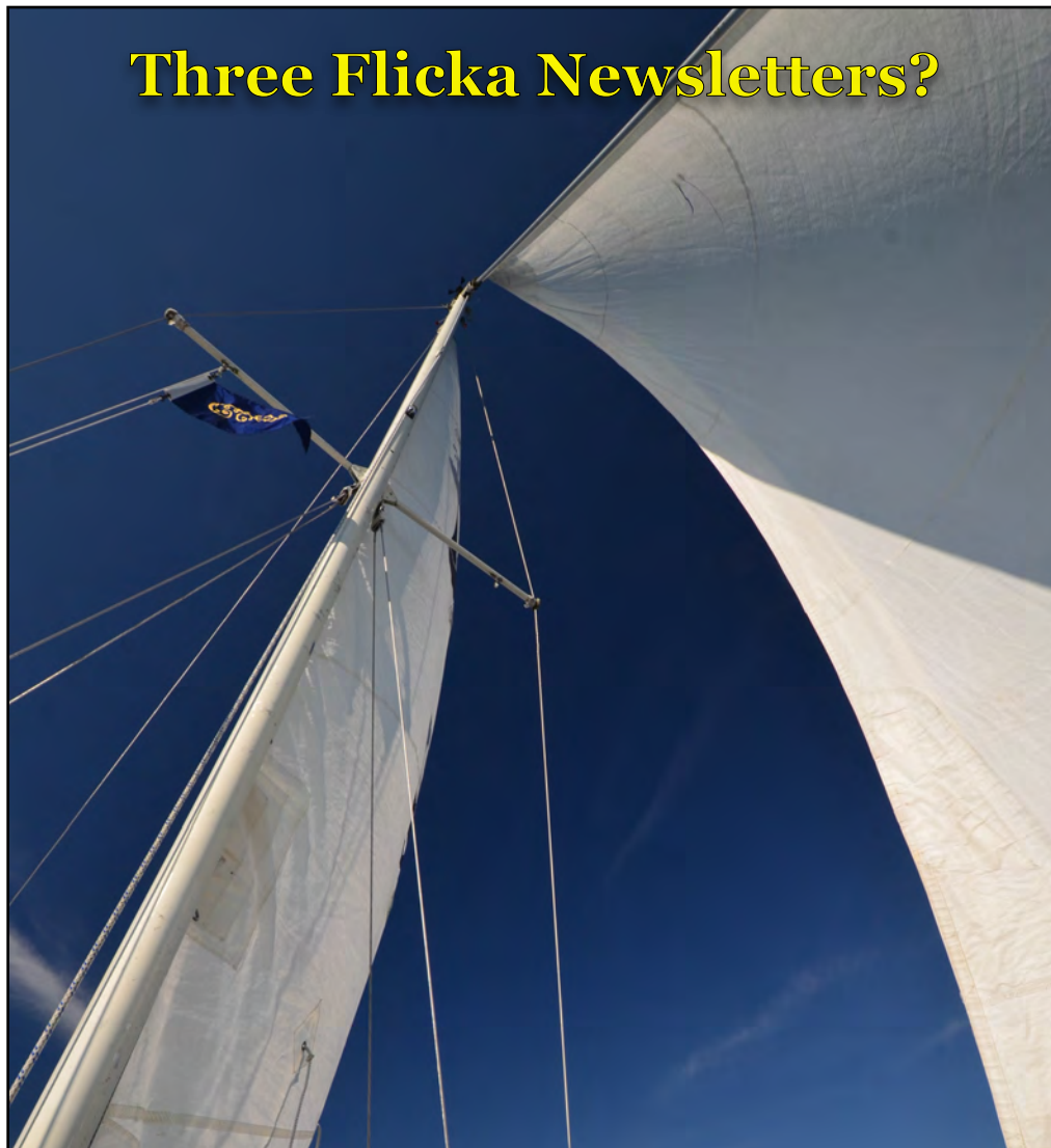
A Flicka bugee flying on the starboard spreader of s/y ZANZIBAR.