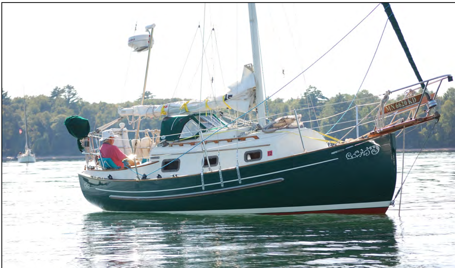
Enjoying a quiet Lake Superior anchorage aboard s/y BALLO LISCIO .