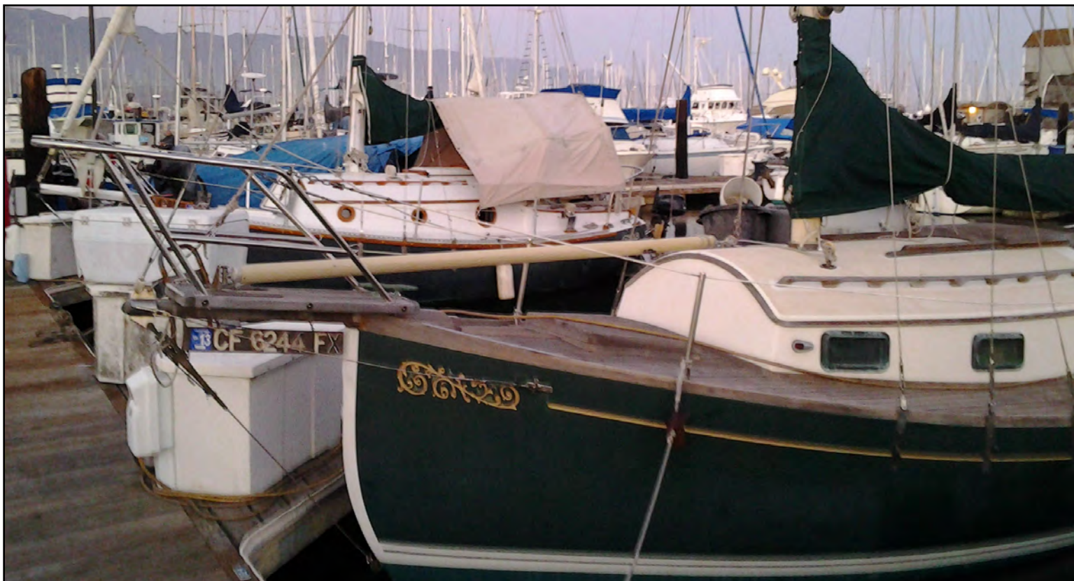
Two NorStar Flickas in Santa Barbara: hull number 19 and hull number 20: s/y MOTU .