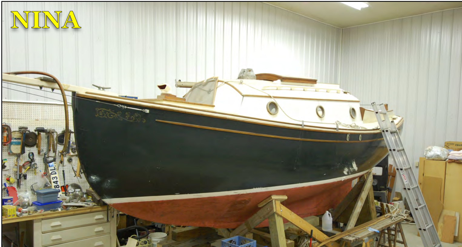
Built by a local cabinet maker from plans, s/y NINA has been stored inside in a heated barn.