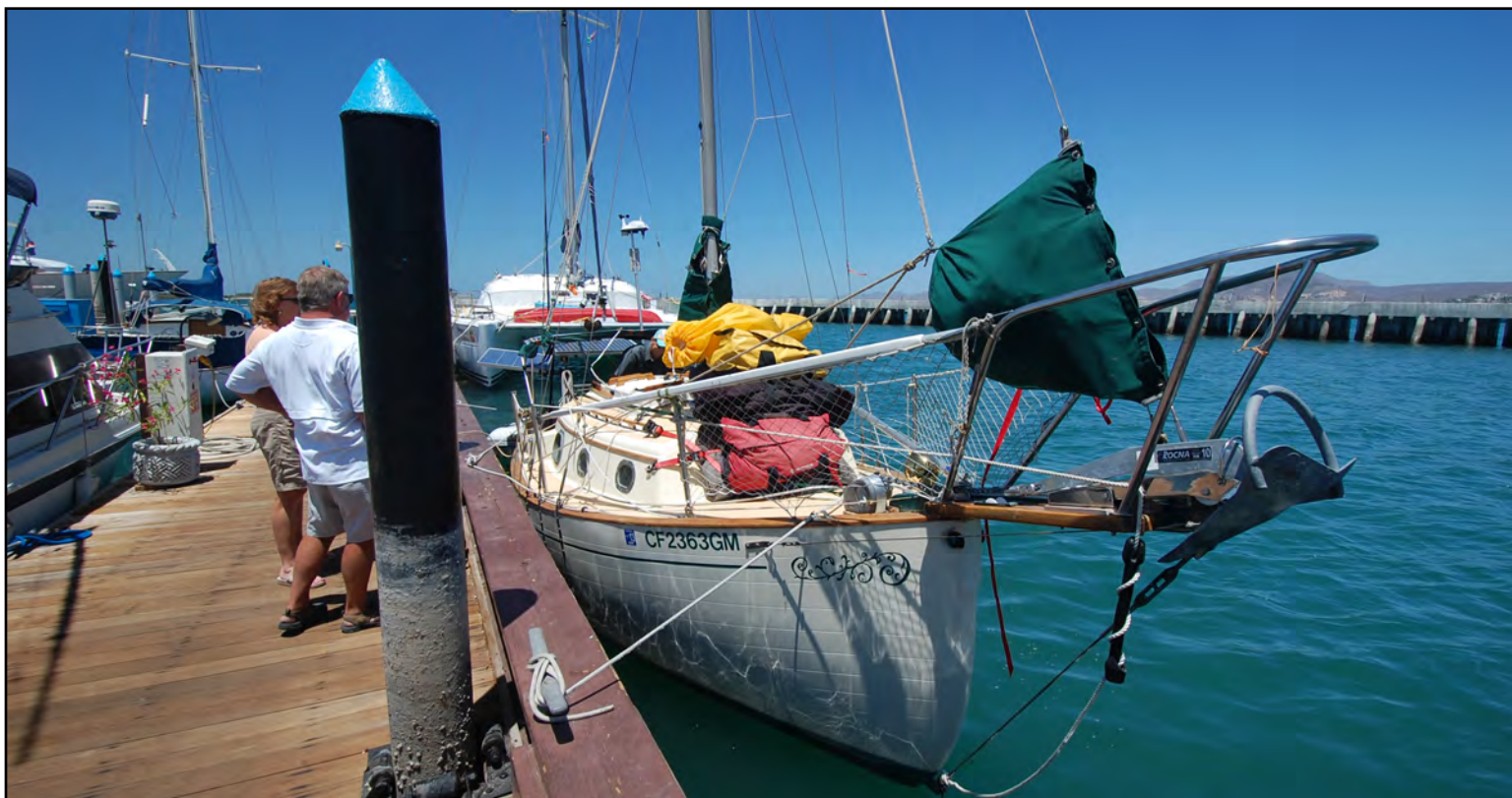
After six weeks of sailing from San Diego, California, s/y NOMAD is at the docks in La Paz, B.C.S., Mexico.