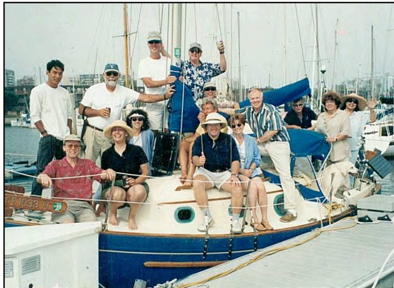
Overloaded Flickr: s/y KAWABUNGA .