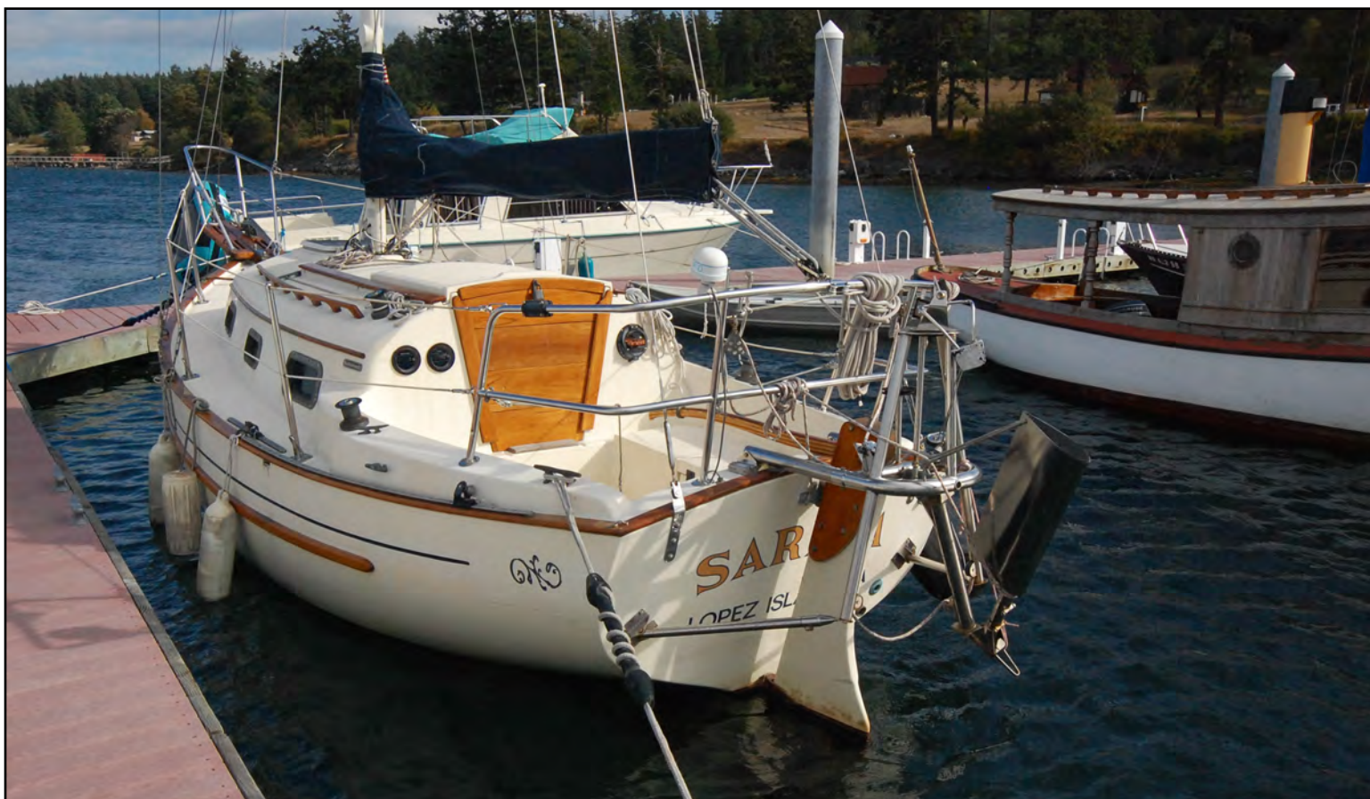
One of the newer Flickas, s/y SARNIA is equipped with a Monitor Windvane.