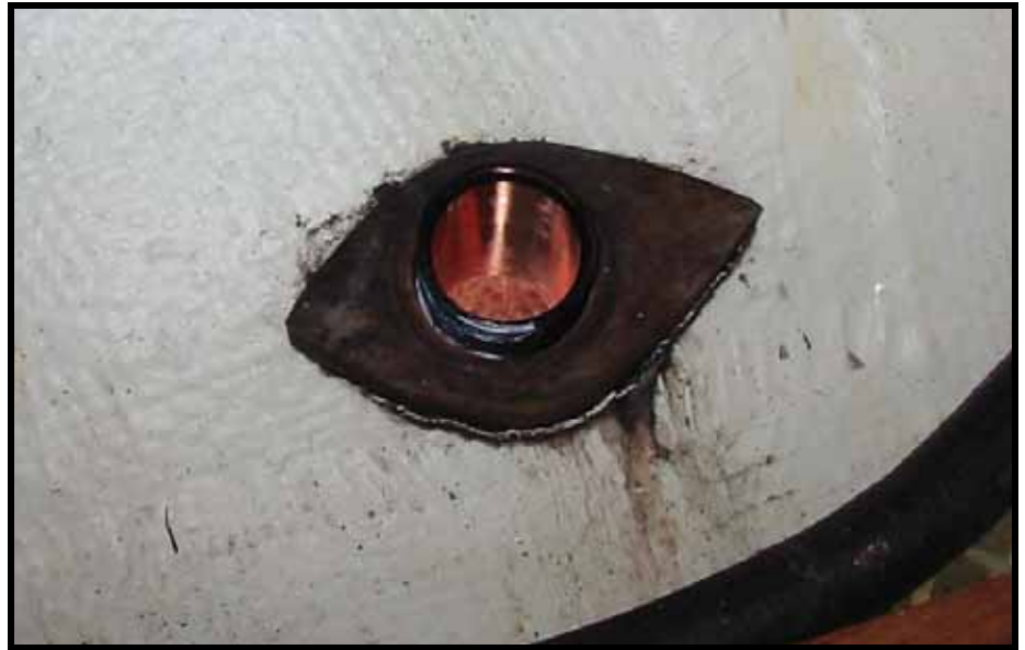
The depthfinder through-hull passed through a wood puck, which is sealed to the bottom of the hull. Being able to remove the transducer is an improvement over the old Datamarine system.

With the instruments in place and the curing time past, it was time to test the installation. BEN MAIN, Jr. was launched in the morning. The seals were good, no water entered the hull.