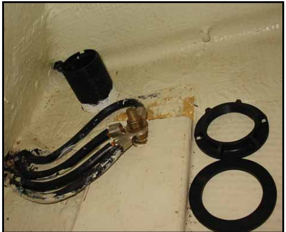
The new Navman speed / temperature sensor through-hull, reducing adaptor, plug, washer and nut.