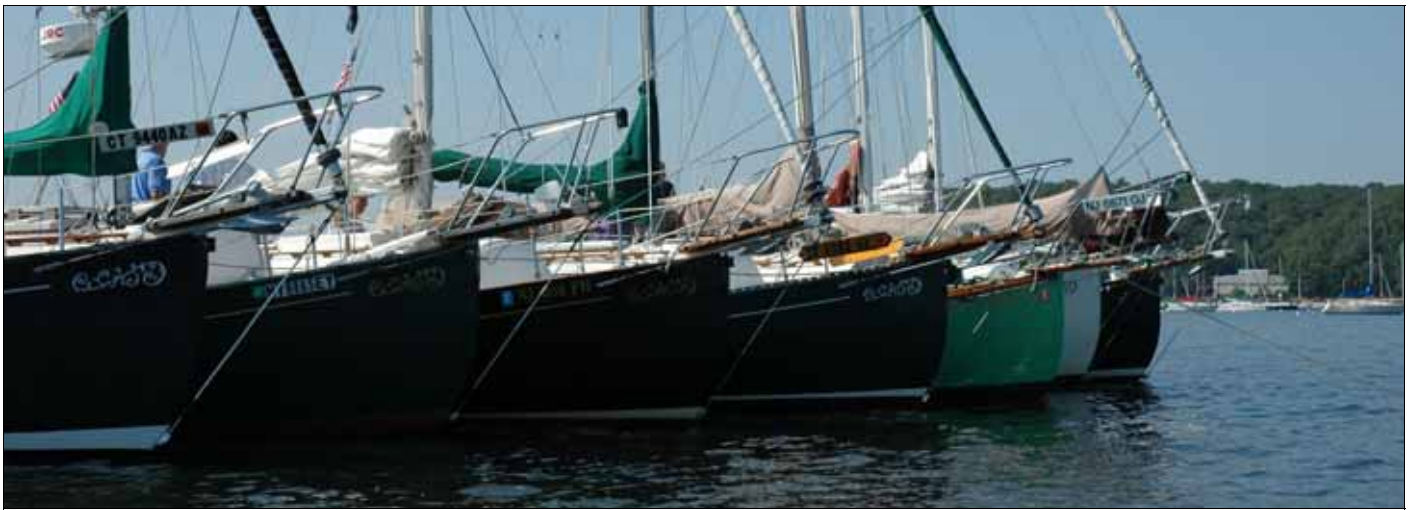
Seven Flickas in a row! Everyone rafted off of s/y SWEET PEA during the Rendezvous.