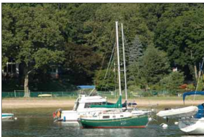
s/y WILLA.