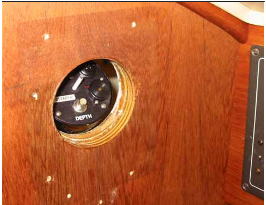
The display hole is through the gelcoat, fiberglass, marine plywood and the interior teak surface.