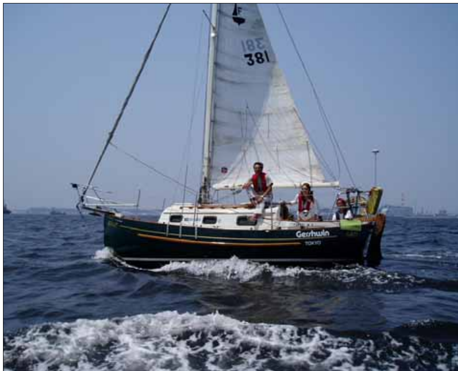
Akihiro Yamakawa aboard Flicka s/y Gershwin in Yokohama Bay.