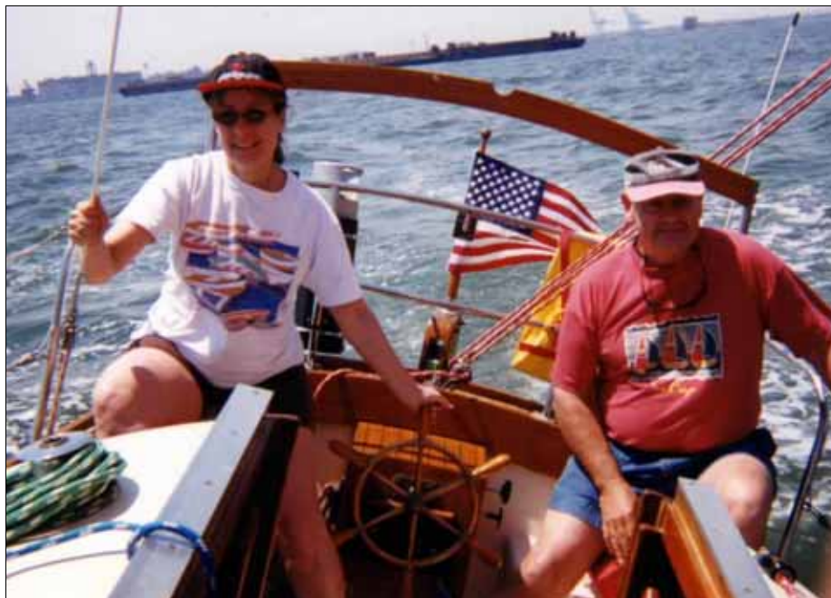
Sailing with friends aboard s/y SWEET PEA.