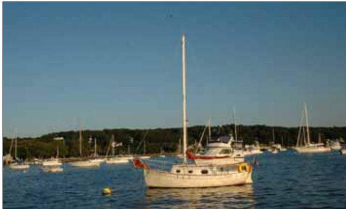
s/y CATHERINE