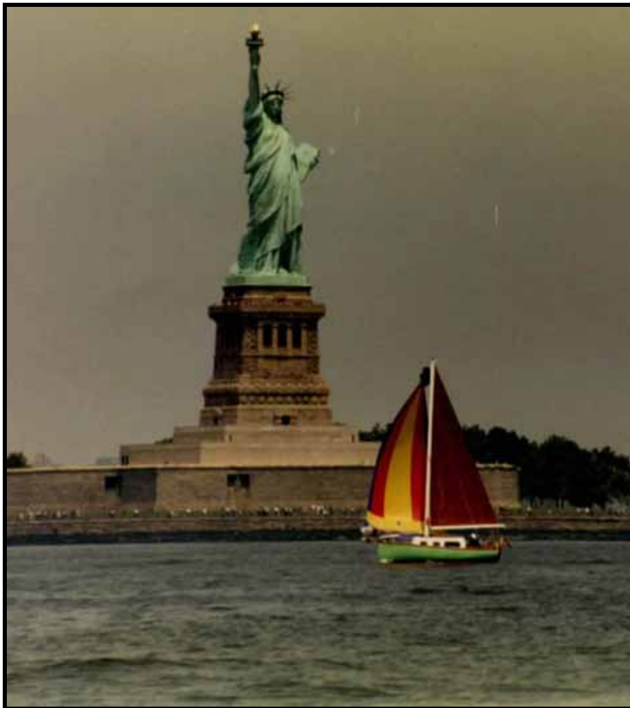
Nor'Star Flicka s/y SWEET PEA sailing near the Statue of Liberty.