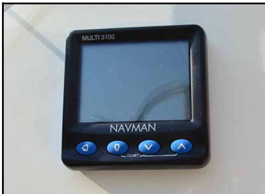
The new Navman display is ready to go. The ability to see the depth and boat speed at the same time may be the best new feature.