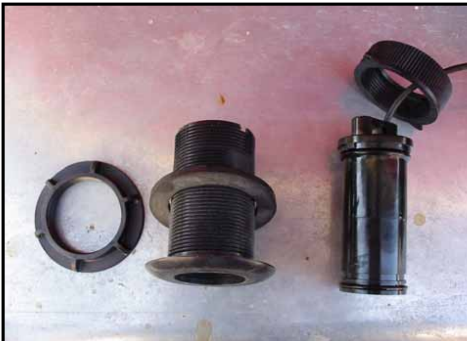
The new Navman depth finder allows the transducer to be removed without removing the through hull. This is definitely an upgrade.