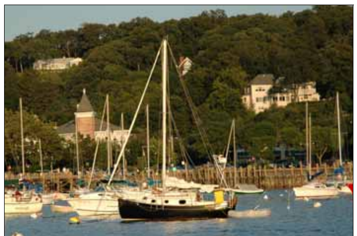
s/y GAMINE