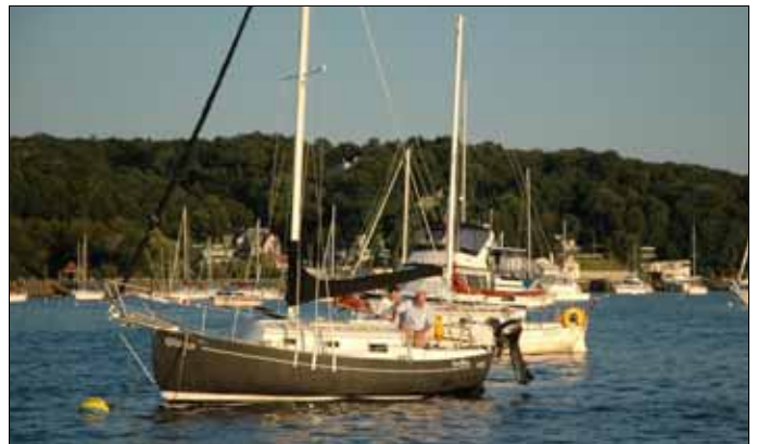
s/y CORY BAY.