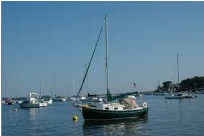
s/y PARADOX.