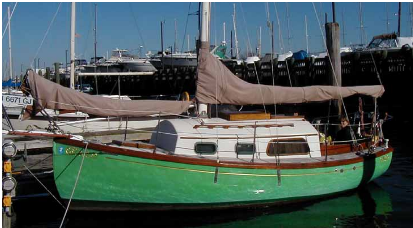
Nor'Star Flicka s/y SWEET PEA.