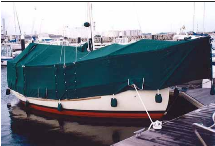
MARITIME's full canvas cover is often a topic for others.