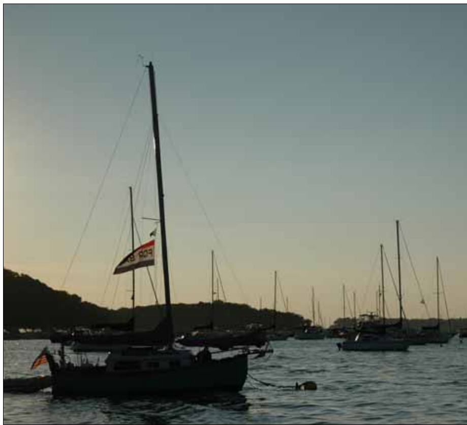
SWEET PEA and the other Flickas spent the night on moorings.