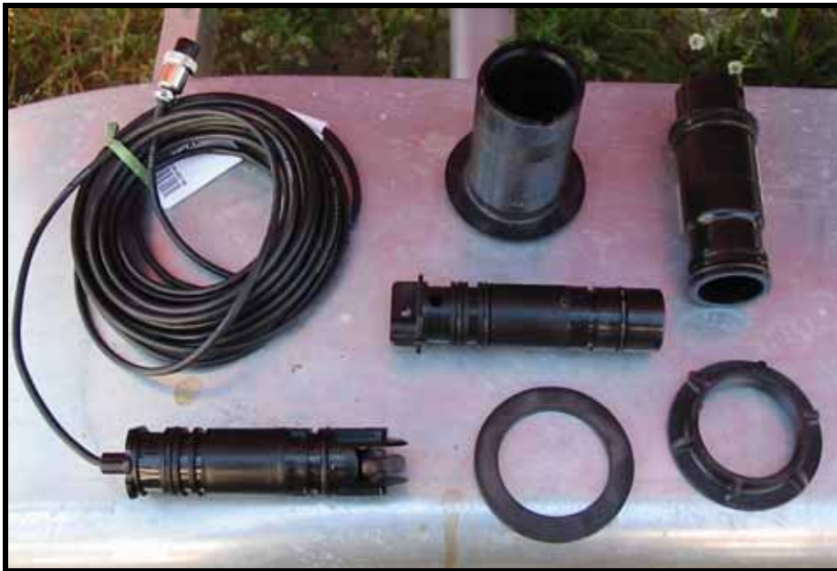
The new Navman speed / temperature sensor, through-hull, reducing adaptor, plug, washer and nut. The adapter has a flap that closes when the sensor is removed thus keeping water out. The plug is in the center of the photo.