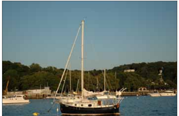
s/y SAN SOUCI.