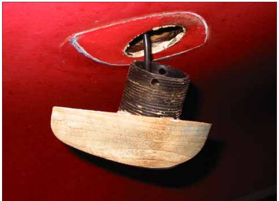
After knocking the depthfinder loose, it was removed. The Datamarine transducer was one piece. The new Navman transducer would fit inside of a through-hull allowing removal while in the water.