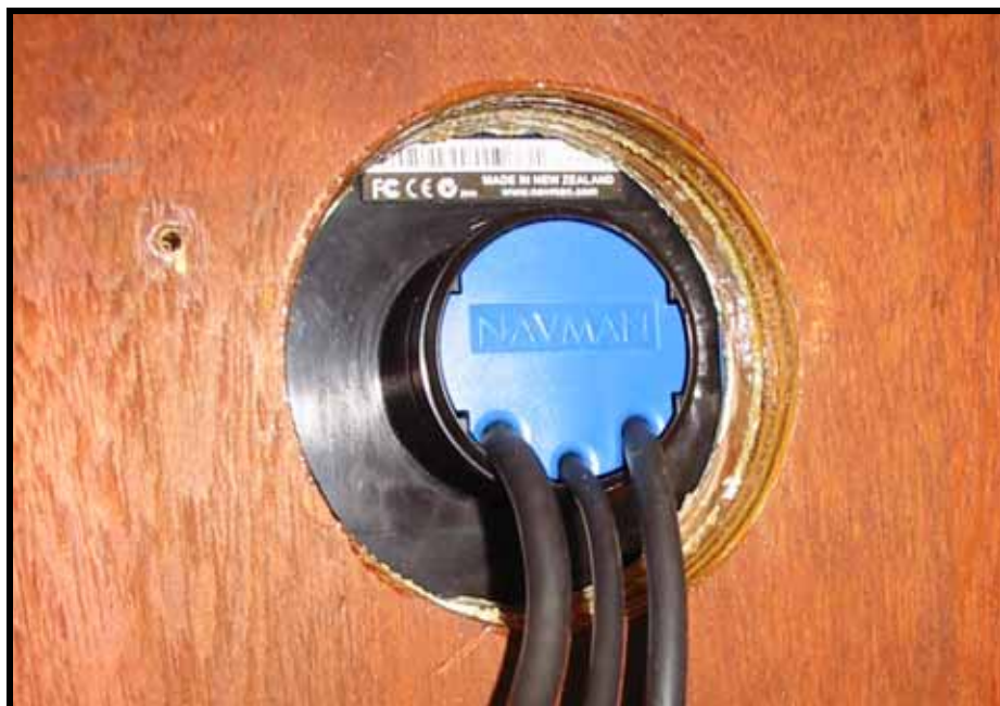
The new Navman display covered the hole through the cabin. An aluminum washer was fabricated to hold the instrument beneath the nylon retaining nut.