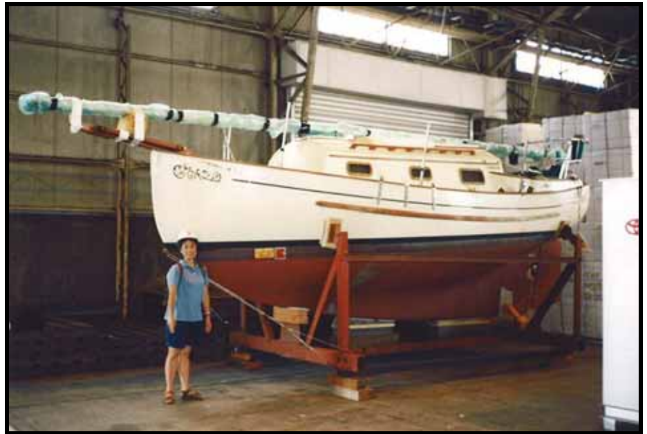
Flicka MARITIME in a bonded warehouse shortly after her arrival in Japan.

Early in morning of August 4th, I waited for WORLD SPIRIT to arrive in Yokohama. Tokyo Bay can be seen