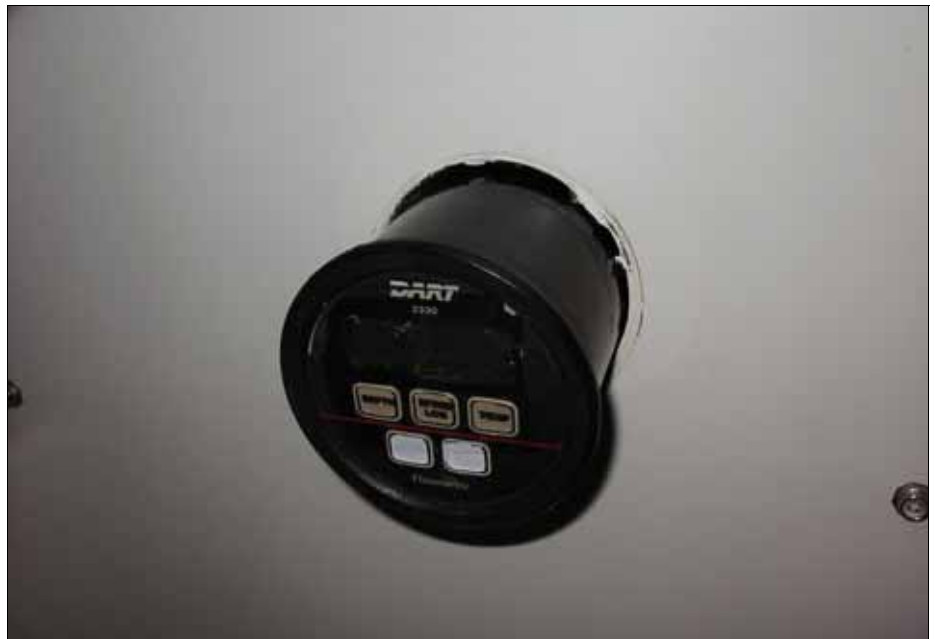
The old Datamarine display required a little force to break the Instrument free from the adhesive.

The first task was to take out the old equipment. Two of the three items of the old Datamarine system were not difficult to remove, but the depth transducer took a little longer and more force. Looking back, this was an easy task. Working around holes in the hull make me nervous.