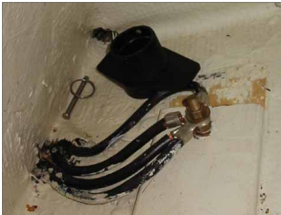
The speed sensor through-hull is located under the starboard seat and shares the space with the grounding system.