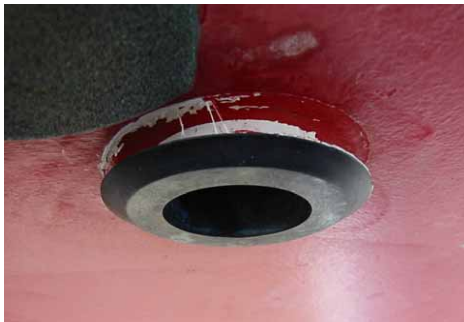
With the application of some direct force, the old Datamarine through-hull separated from the hull.