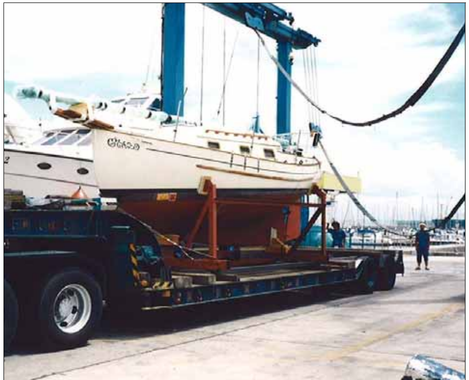
MARITIME arrives at the marina for launching.