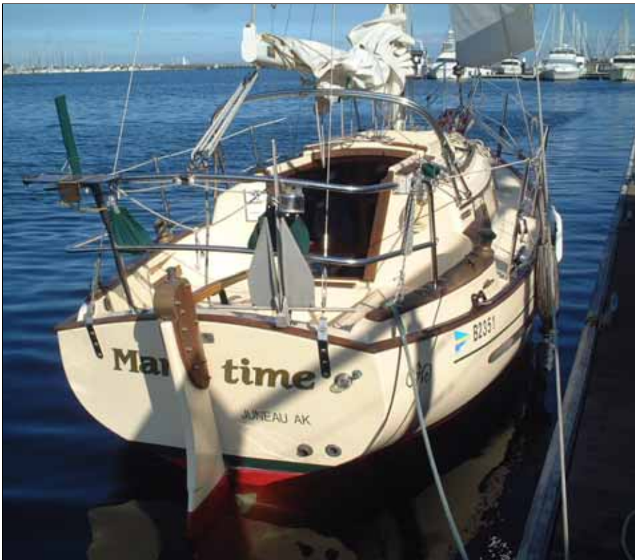
MARITIME in Yokohama Bay Side Marina.