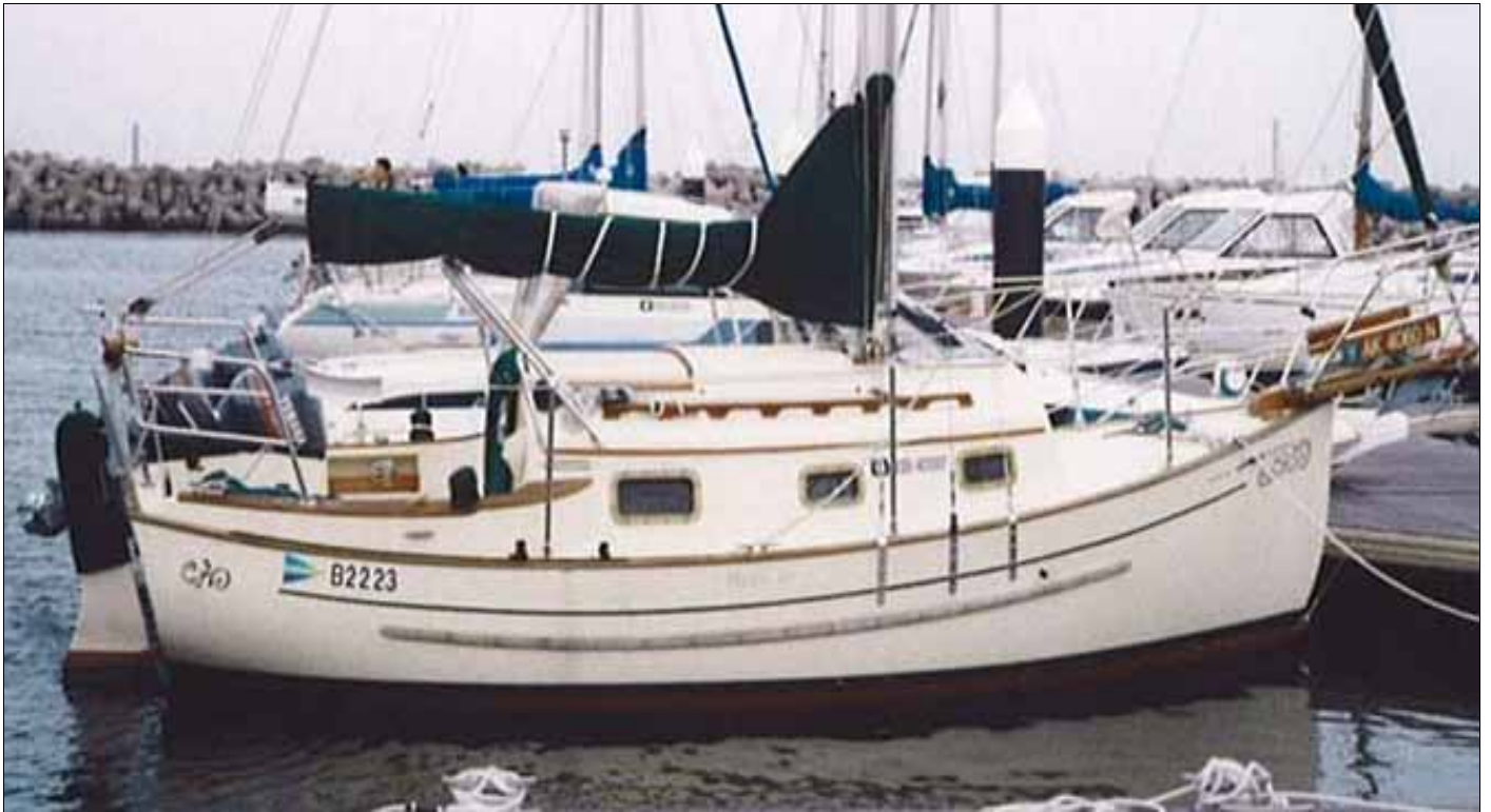
MARITIME in Yokohama Bay Side Marina.