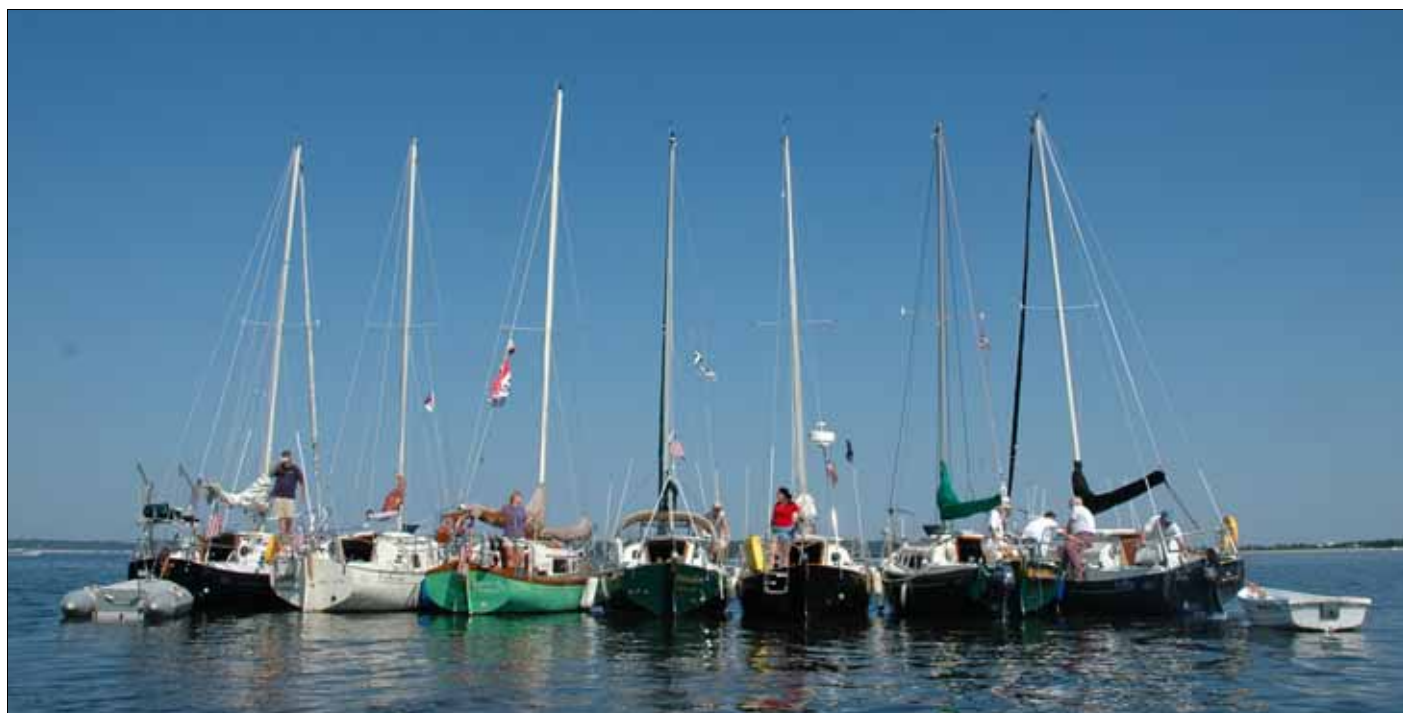
Wineglass view of SAN SOUCI, CATHERINE, SWEET PEA, PARADOX, GAMINE, WILLA, and CORY BAY.