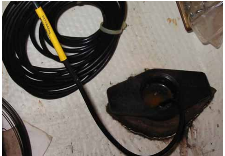
The depth transducer is located beneath the sink on the port side of the hull. A nylon wing nut and adhesive hold it in place.

The wires are hidden from view by the piece of long narrow piece of teak. A slot was cut into the wood to give it a wide u-shape, with just enough room for two cables and one wire. The extra cable length for both transducers is wound in a coil and secured with wire ties in the bottom of the liner.