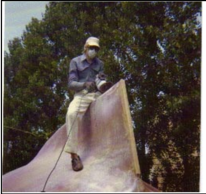
Here I am sanding (again) the hull - notice the long sleeves, gloves, hat, and mask, all in an unsuccessful attempt to avoid the itches.