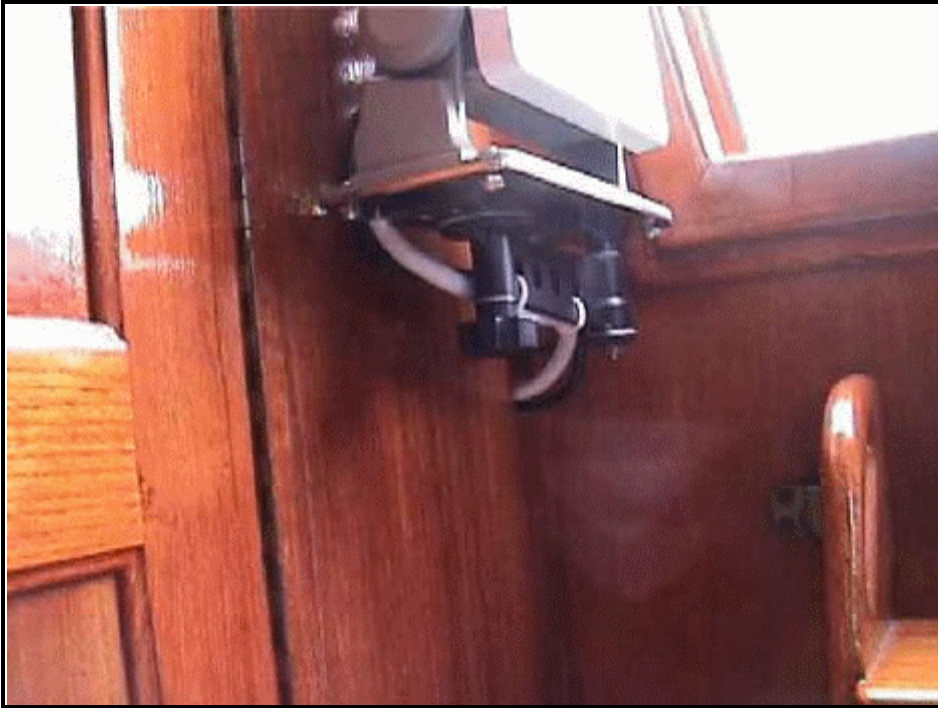
The picture shows the swivel mount for the LCD display. The pivot arm is mounted very close to the companionway bulkhead with just enough room to adjust the arm.