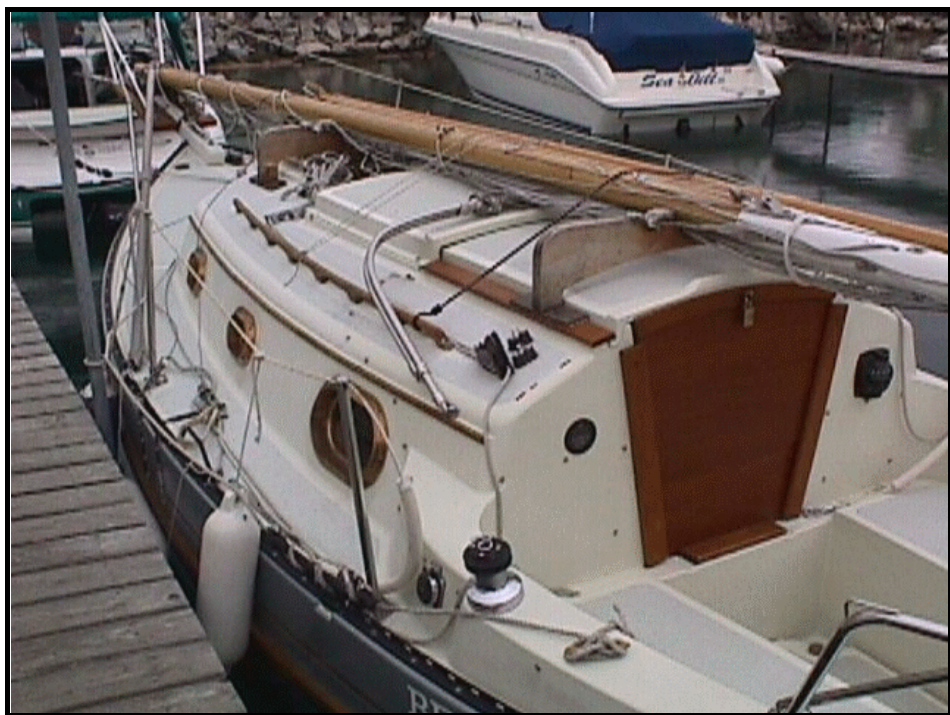
The wooden mast, gaff, and boom rest in the lazy jacks and clear the top of the bimini. The sails are already stored for the end of the season and the boat is being readied for indoor winter storage.