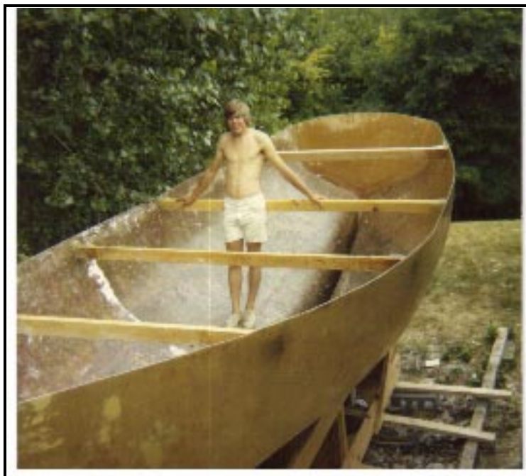
The partially completed hull after removing the mold and rolling it over. My son says I was a lot thinner then!

moved it onto the grass and basically rolled it over into the wooden cradle I had built on top of the upside-down hull. This wasn't actually that difficult with a lot of hands as the hull was relatively light.