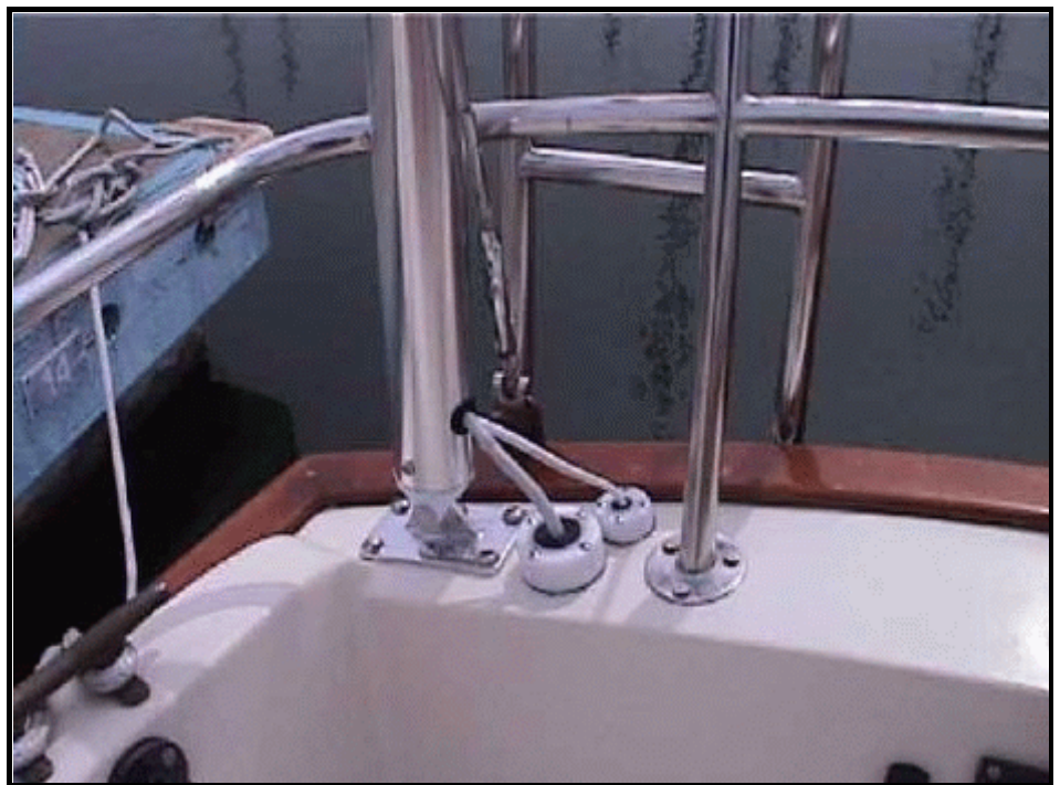
The picture shows the base of the Radome support post and the watertight electrical connections. The wires run forward to the display located just inside the cockpit.