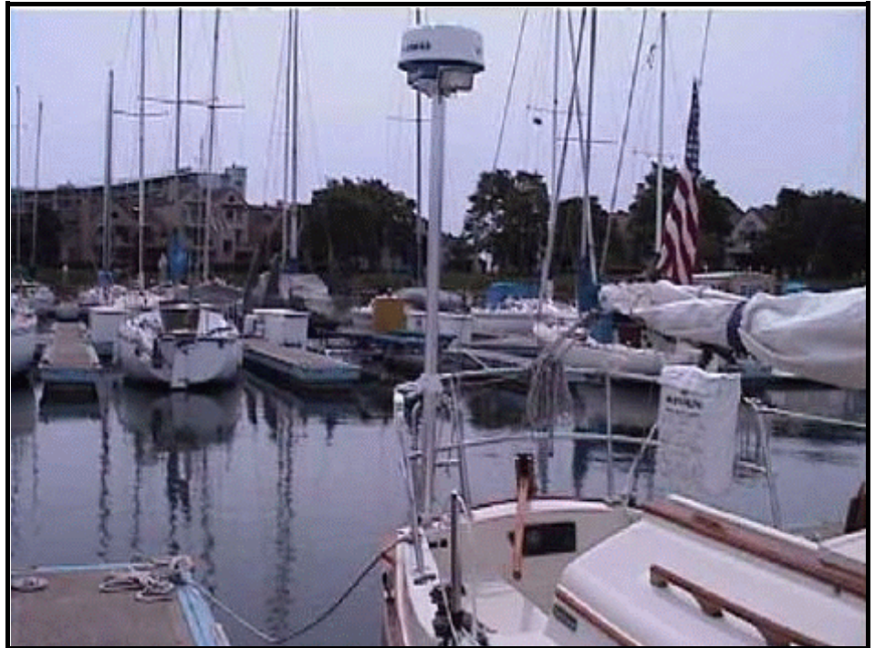
The radar was installed on an Edson post located on the starboard side of the cockpit and is supported by the aft pulpit.

As you can see in the photos, the Furuno 1621 Mark II Radar is mounted on an Edson Standard Radar Mast with an Edson Basic Radar Platform and an Edson cockpit flood light. The low-end radars in general have small radomes, small LCD displays and low power consumption and are also the least expensive! The radar mast is mounted on an Edson Pivoting Mast Mount so it can be stored for trailering or for low bridges with about three minute's effort. The decision for a mast mounted, backstay mounted or tower mounted radar is a series of tradeoffs. I like the idea of a tower mount, particularly on canals or rivers, so that the radar can be used independently of the mast being up. Also, the windage aloft is reduced and the installation is a little easier. But I can also understand the approach for a mast-mounted radar including lower overall weight and greater radome transmission visibility.