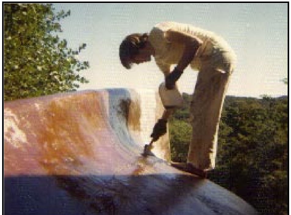
Wetting out the cloth with resin requires quick work and a proper mixture of resin to hardener - too slow and it does not set properly, too fast and it hardens in the jug.