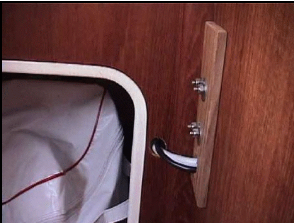
The picture shows the backing plate for the LCD mount. The cable routing into the locker just behind the head. The excess cable is coiled there next to the holding tank hoses.

One aspect of a tower mount is the decision of what height to mount the radar. Each radar will have an angle of transmission that must be taken into consideration. Ideally, the higher the mast, the better the installation but there are real world tradeoffs. Since the Flicka is initially tender, a taller mast increases the weight aloft in terms of absolute weight and position. Also, a taller mast needs greater support. I have the mast relatively low but at a height that still keeps the heads of crew out of the radiation near the radome. Equally, we feel that while the radar is on, the crew will be in the cockpit or below, probably seated or the radar will be off or in standby mode. These are all tradeoffs that each owner needs to take into consideration.