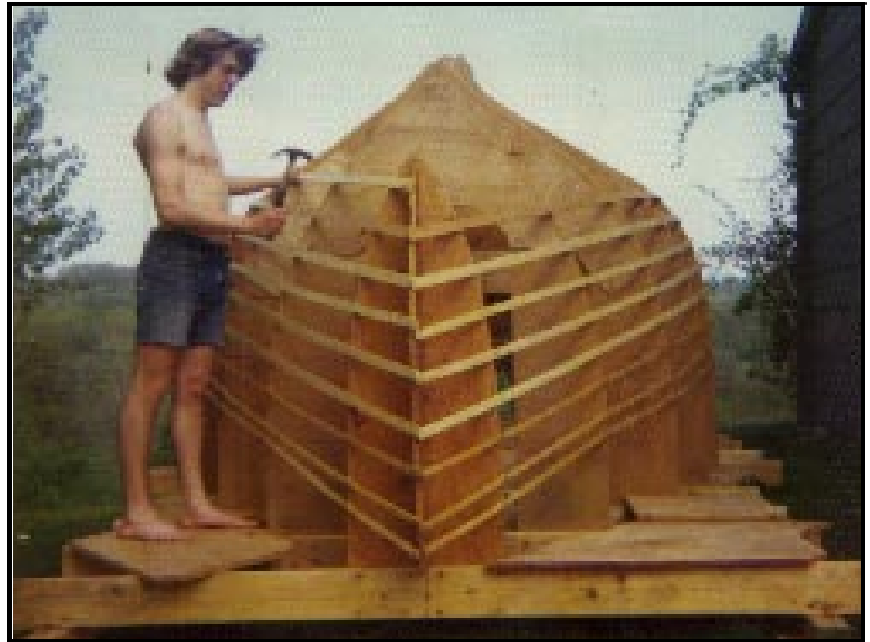
Attaching the lathe to the mold frames - the QED begins to take shape, but there is still a long way to go to complete the mold (let alone the boat).

I saw a homebuilt Flicka about the time I started (I think it was in Annapolis) and decided to build the hull out of fiberglass, rather than ferro-cement. Ferro-cement is obviously very strong, however, you have to lay up the cement in one day and then you can't make any changes,