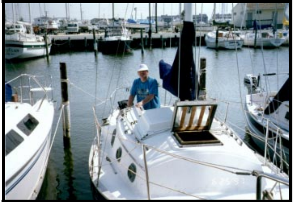
Completing my final preparations before my son gives his "crazy" dad a hug good-bye.

Two problems came up. My compass was off by 30 degrees. I think it's the anchor I have in the locker under it. The other was the smell of diesel fuel. I'll check for a leak before dark. I also had my first injury. A rouge wave hit the starboard side and knocked me down into the opposite bench. I took a hard hit with on left thigh and lay in the cockpit for awhile until the pain stopped. There will be swelling for many days. I plan to take my position at