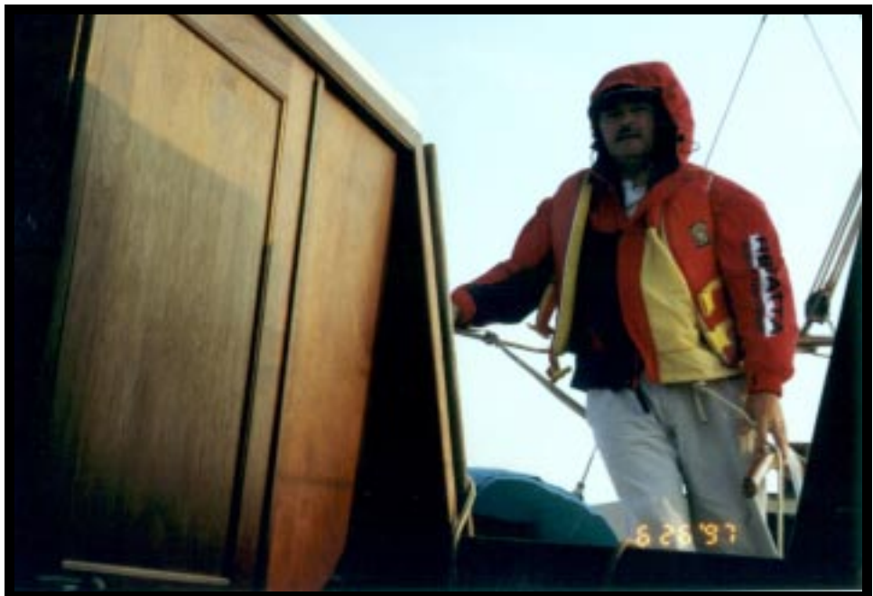
Dressed in foul weather gear while waiting out an Atlantic storm.