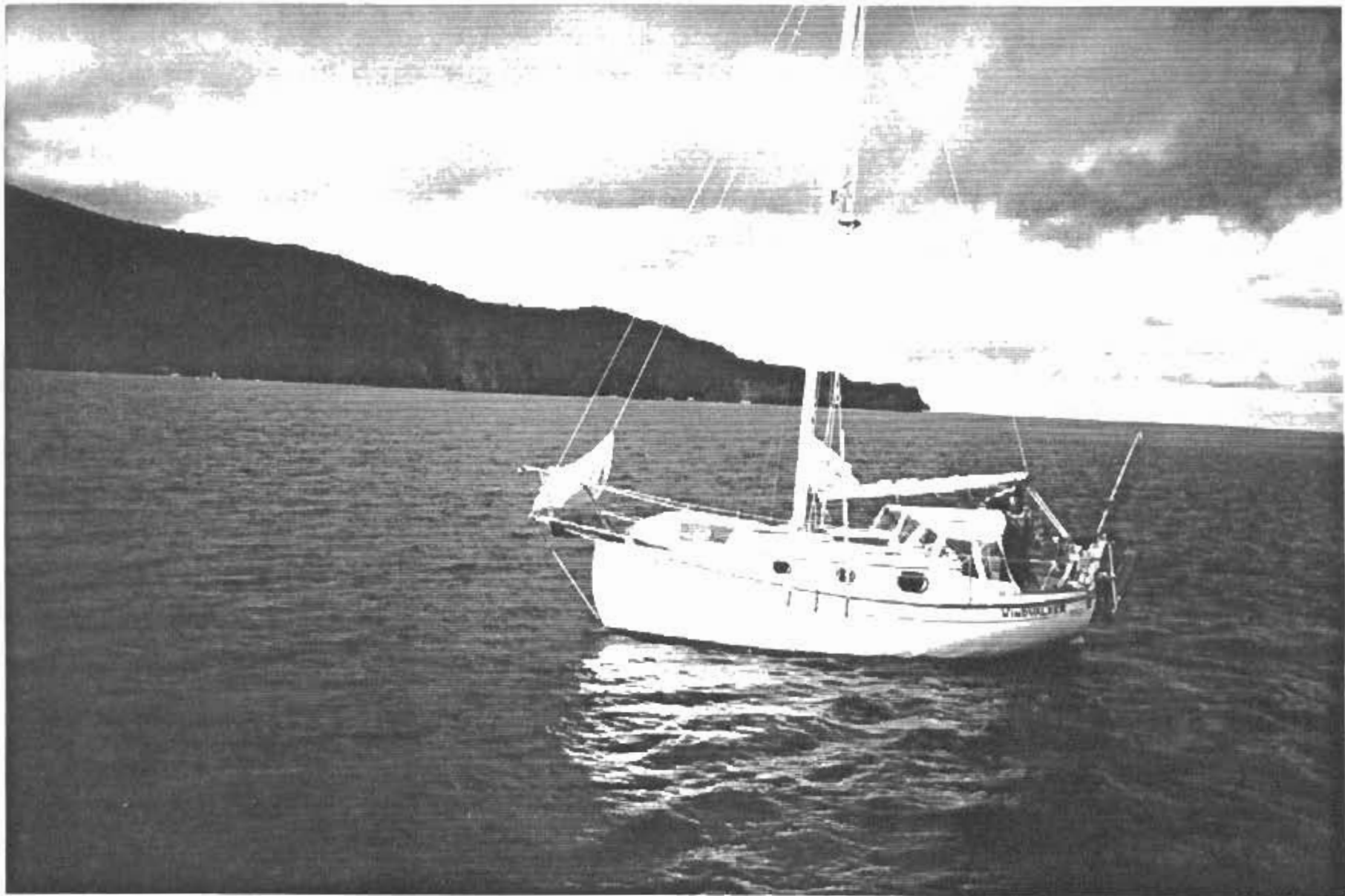
Dave Laws aboard WINDWALKER (including surfboard) near Catalina Island.