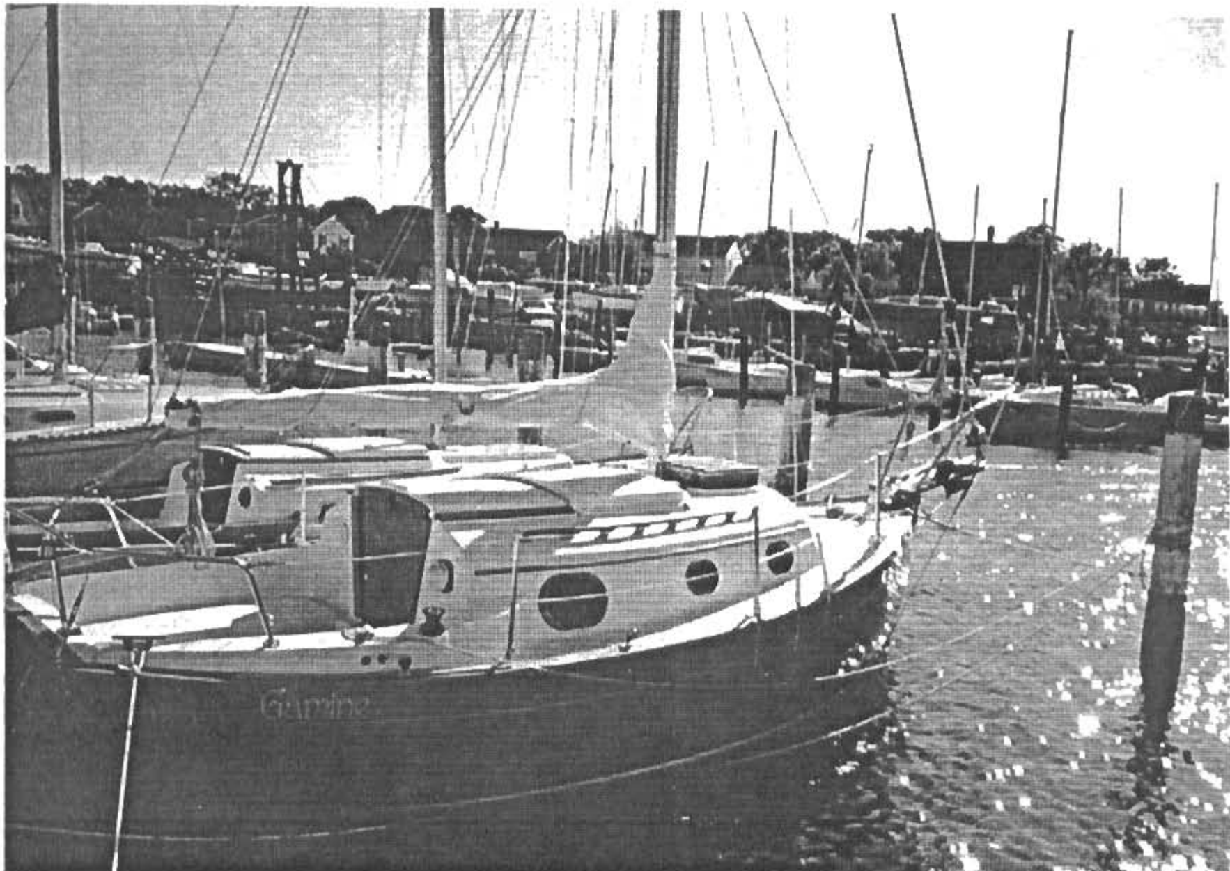
Saul Hershenov's GAMINE at Monmouth Beach, N.J.