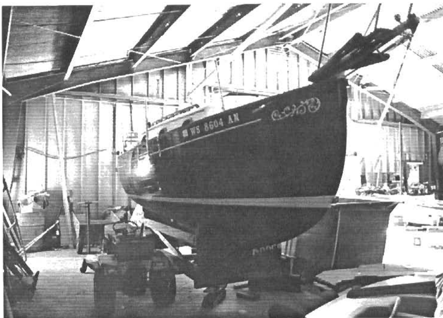
SOMEWHERE IIB in storage at Anchor Marine in Door County.