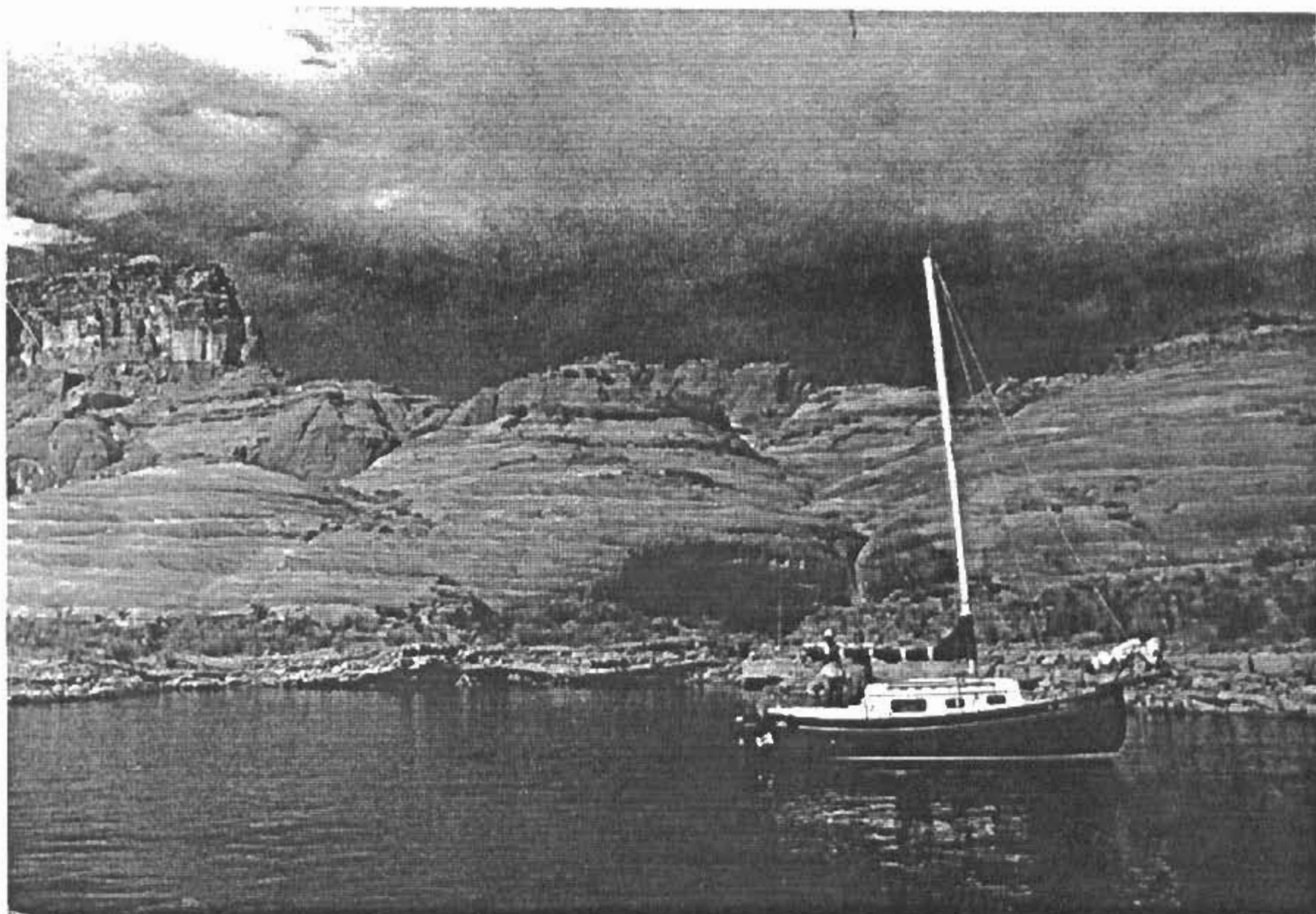
Pacific Seacraft Flicka ( WINDSHIFT ? ) in Klondike Cove on Lake Powell, in Utah.