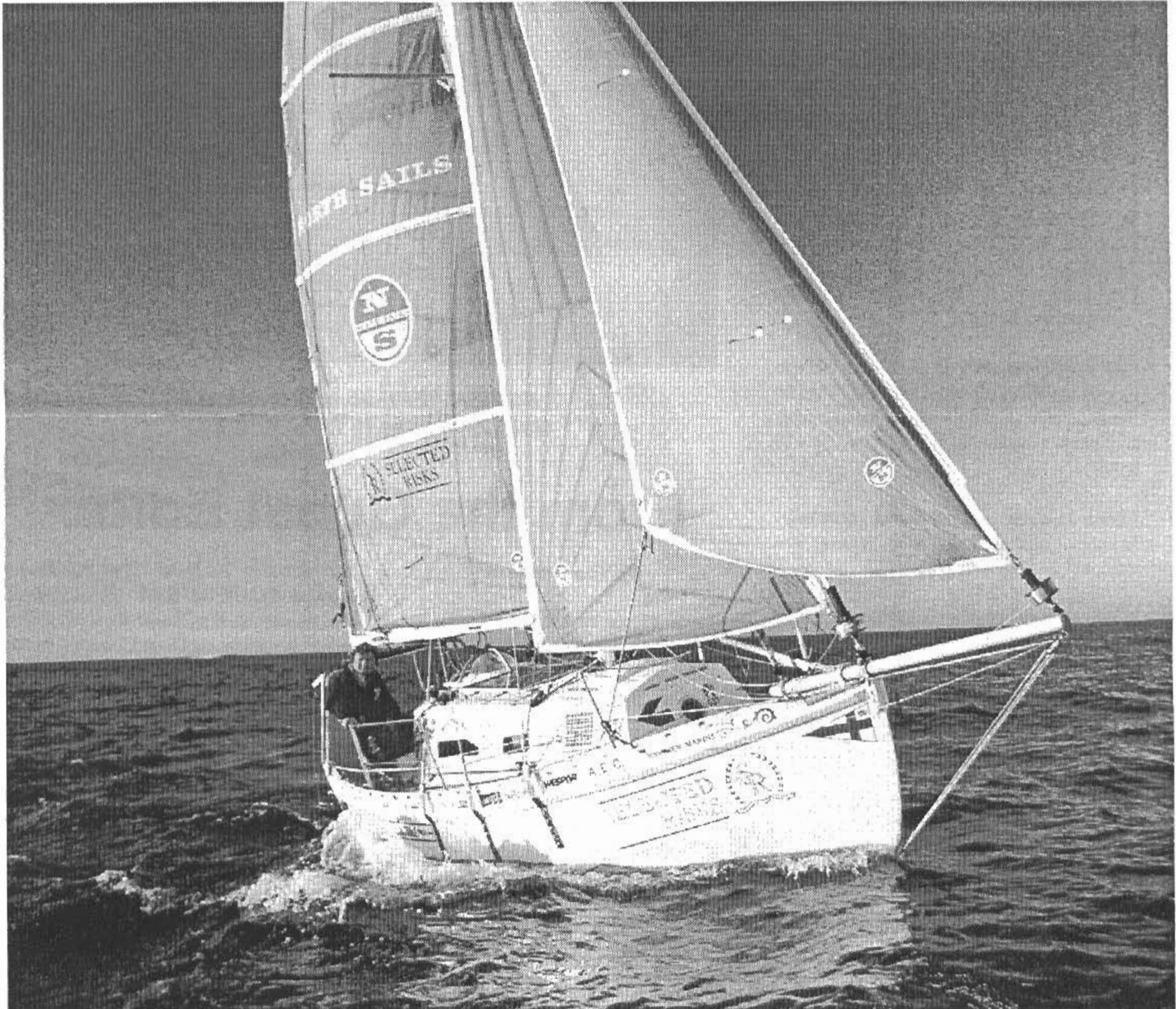
Anthony Steward aboard SELECTED RISKS near Cape Point, South Africa.

We need articles and photos for the next issue!