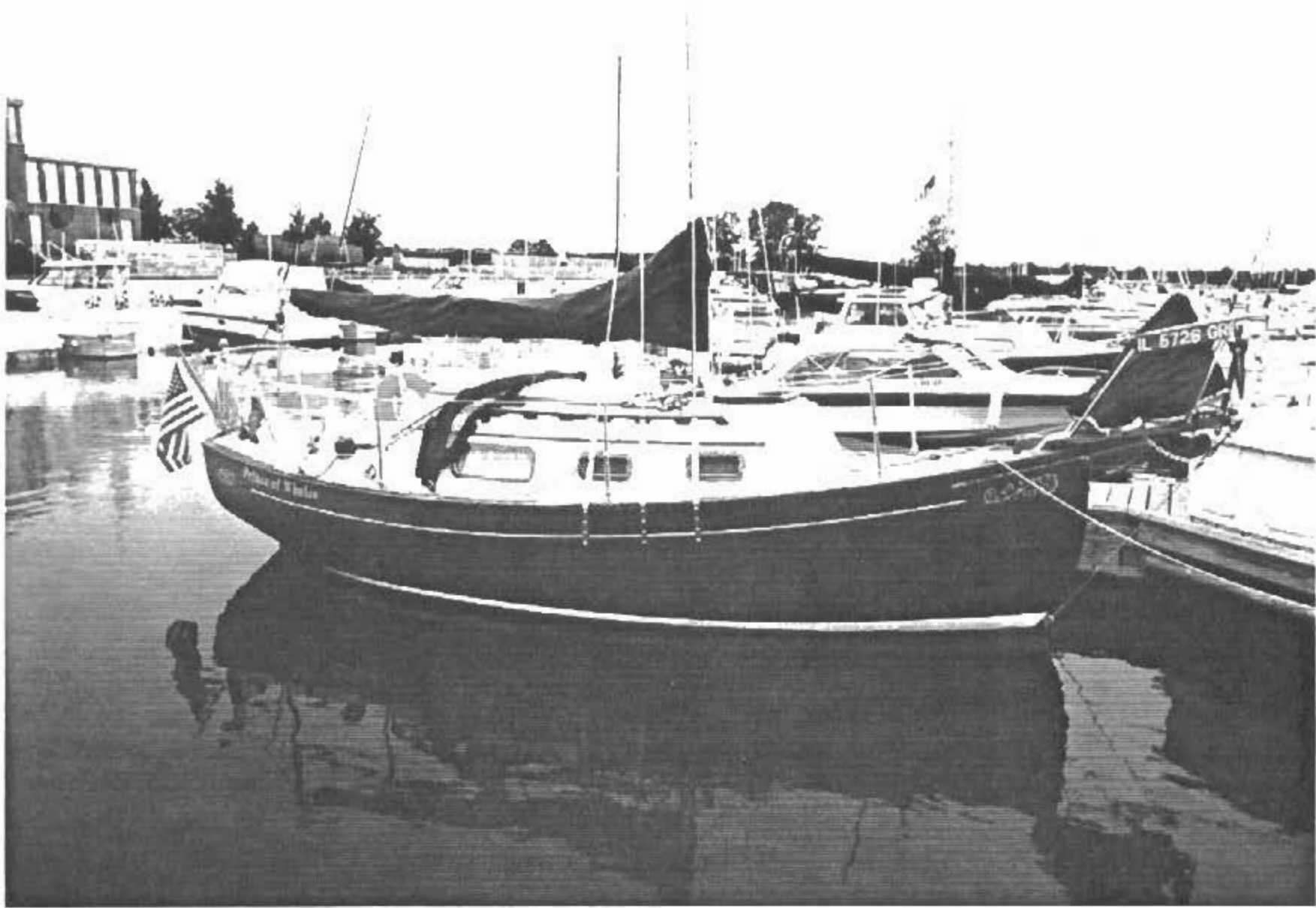
PRINCE of WHALES docked at North Point Marina in Illinois