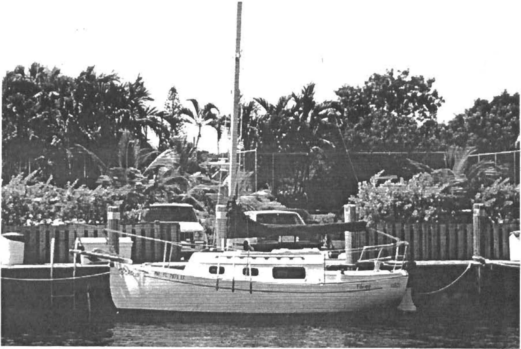
CLUNY docked in Florida.