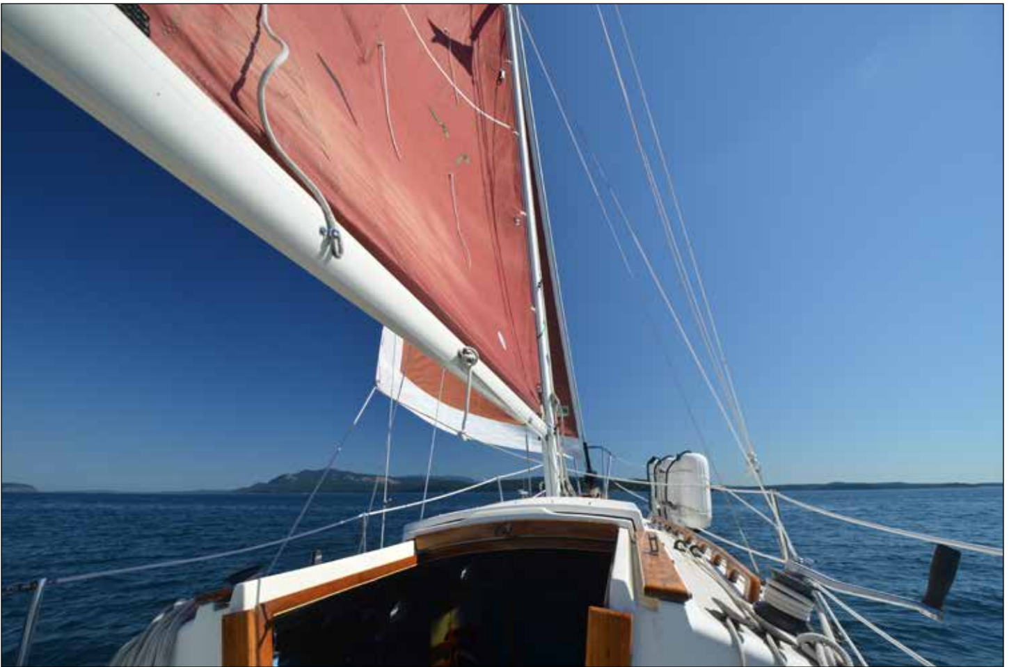
Flicka # 314 under sail in the Spieden / San Juan Channel area of the San Juan Islands.