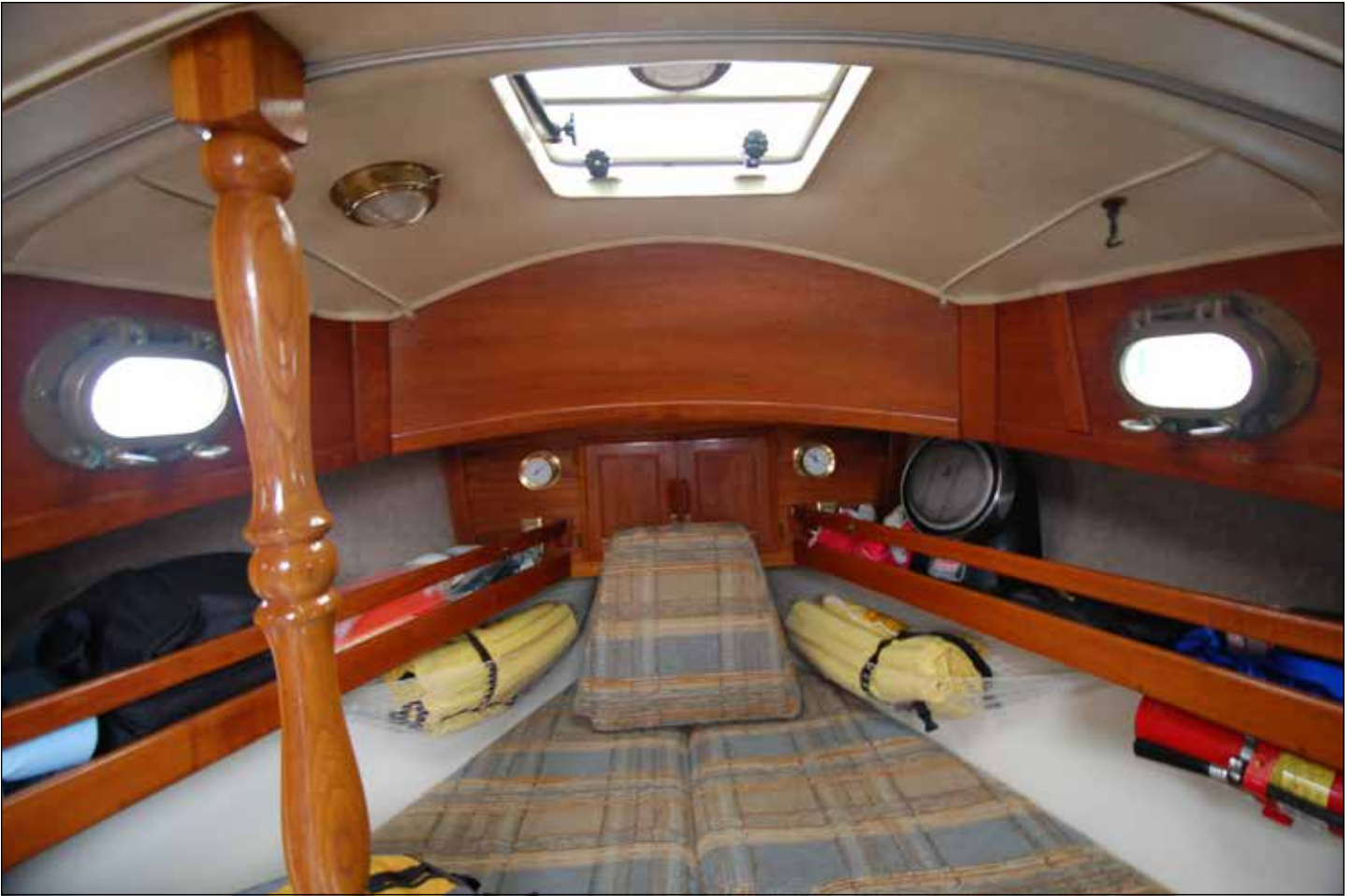
V-Berth of Pacific Seacraft Flicka # 314.