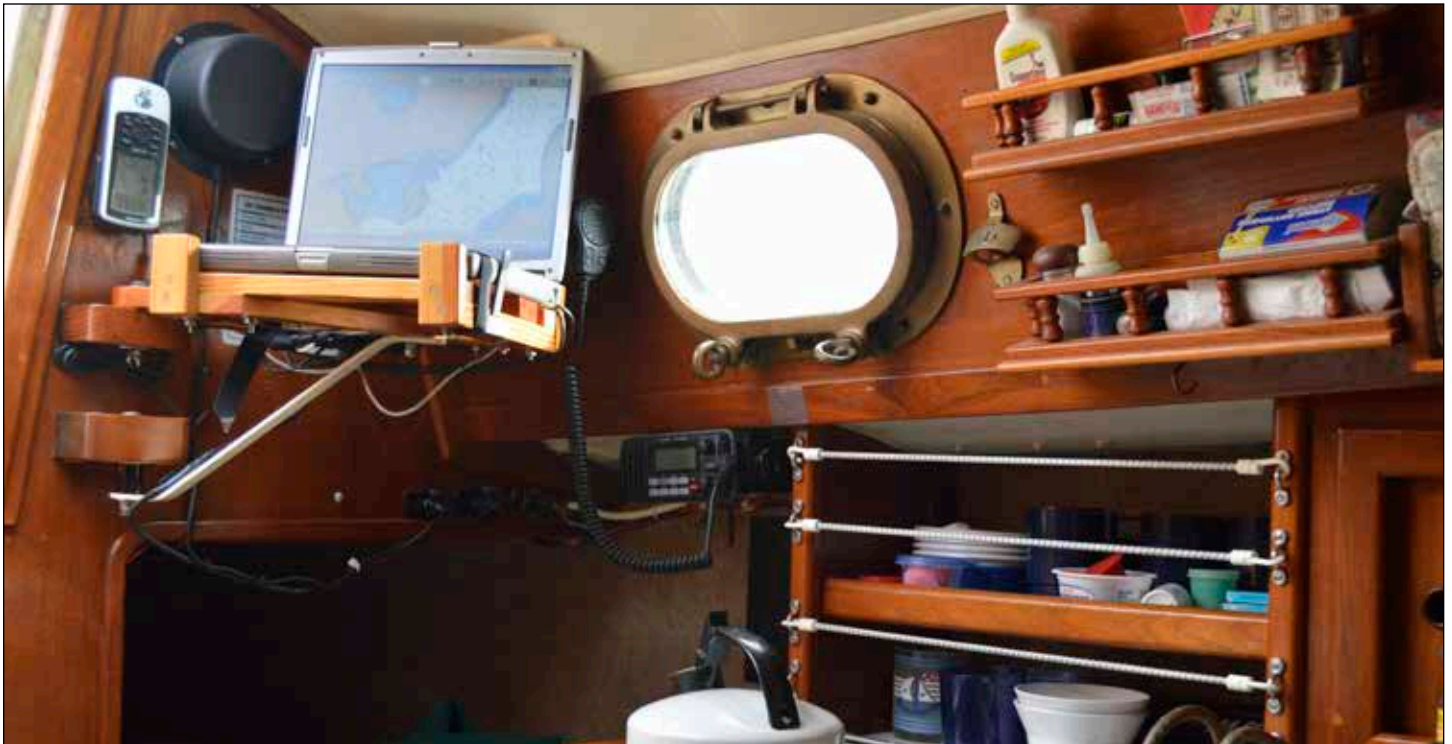
Old Navigation arrangement before the purchase of the Garmin 441s GPSmap.