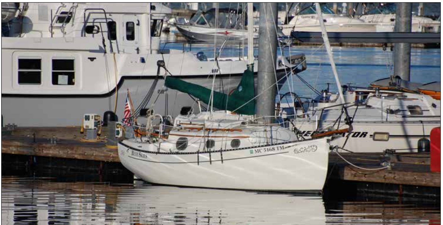
Flicka # 314 at the dock in Roche Harbor Marina.