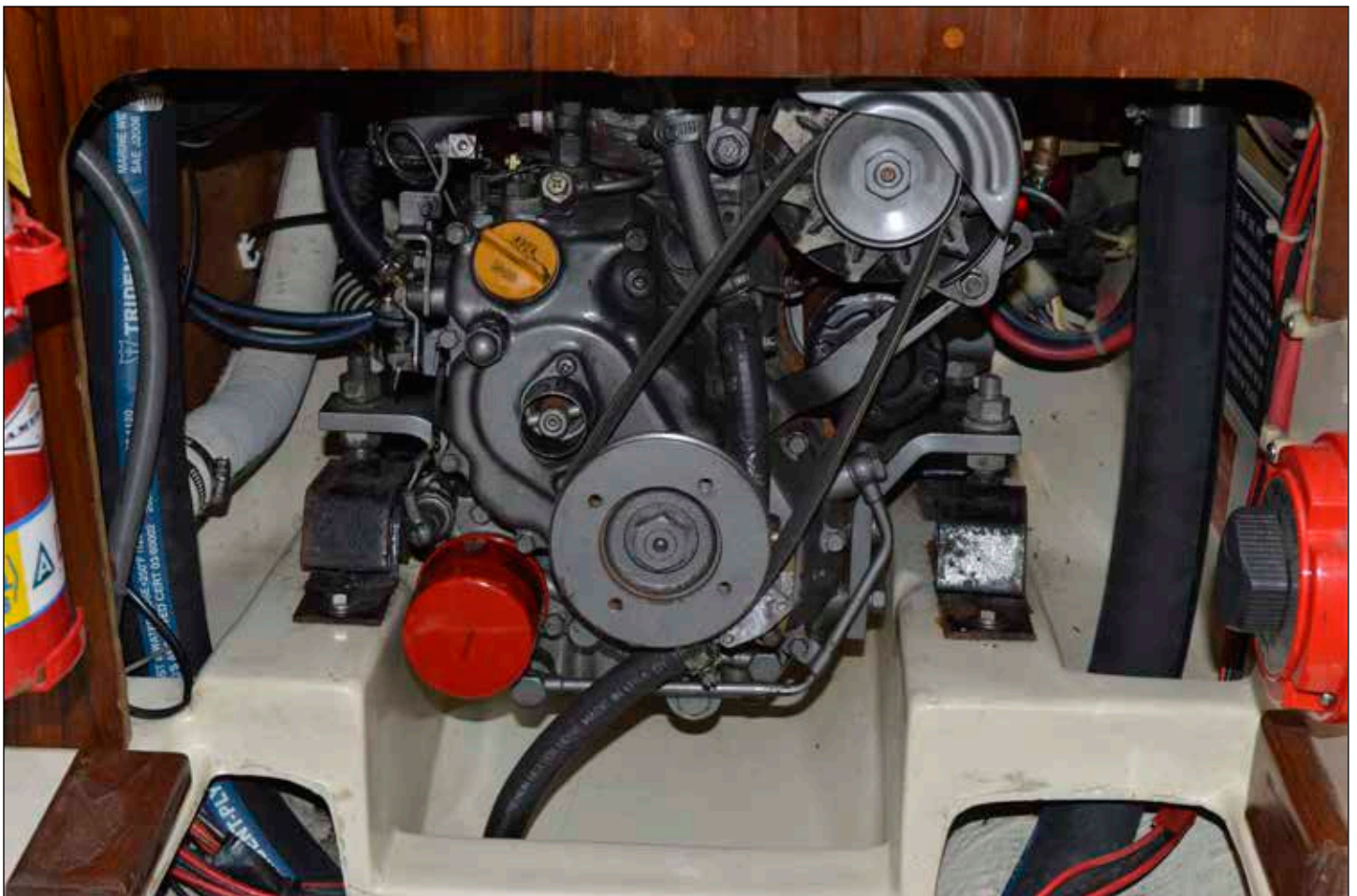
The Yanmar 1GM10 Inboard Diesel Engine aboard Flicka # 314.