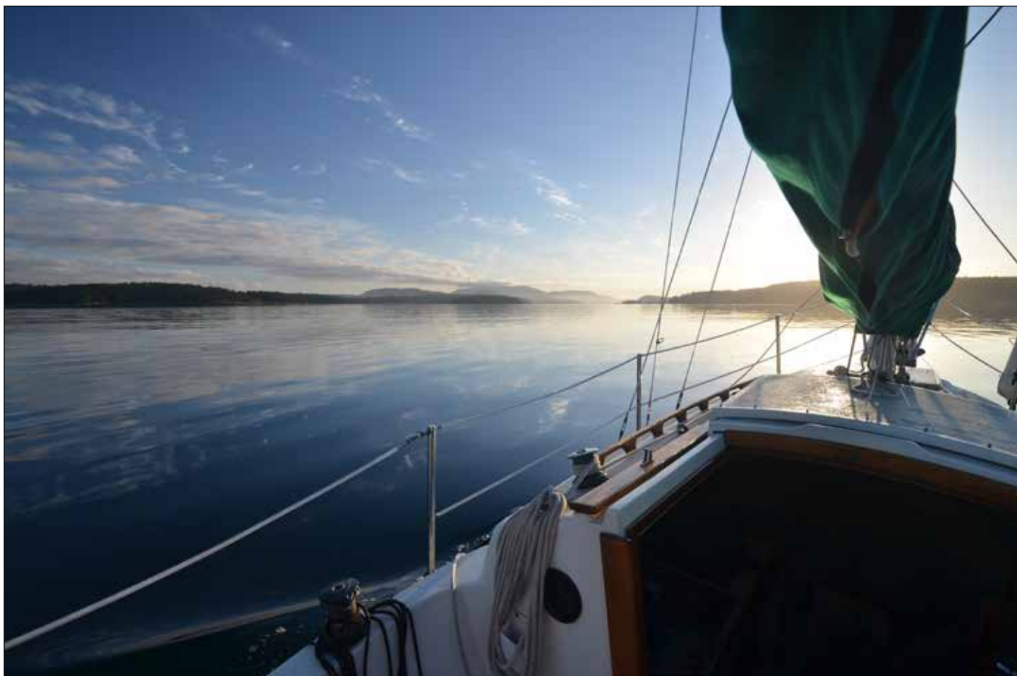
Early Morning Crossing of the San Juan Channel.