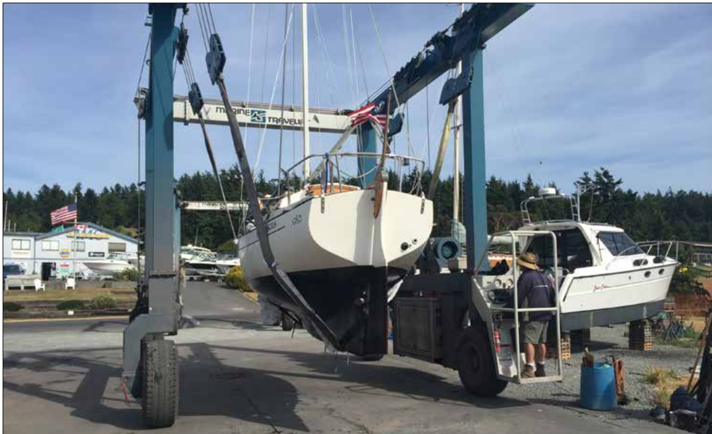
Hauling s/y BLUE SKIES after another trip in the Salish Sea.