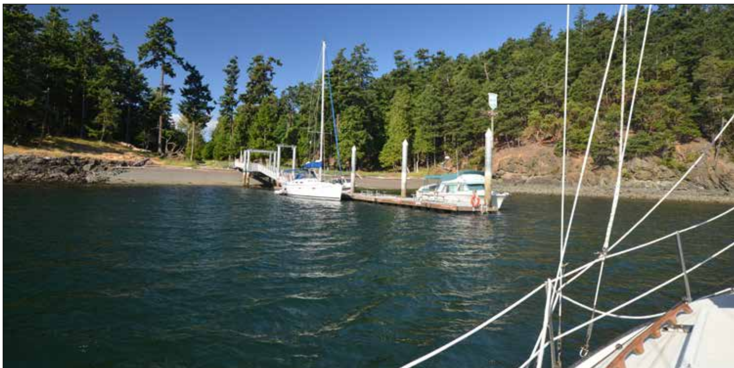
Approaching the dock on Jones Island.