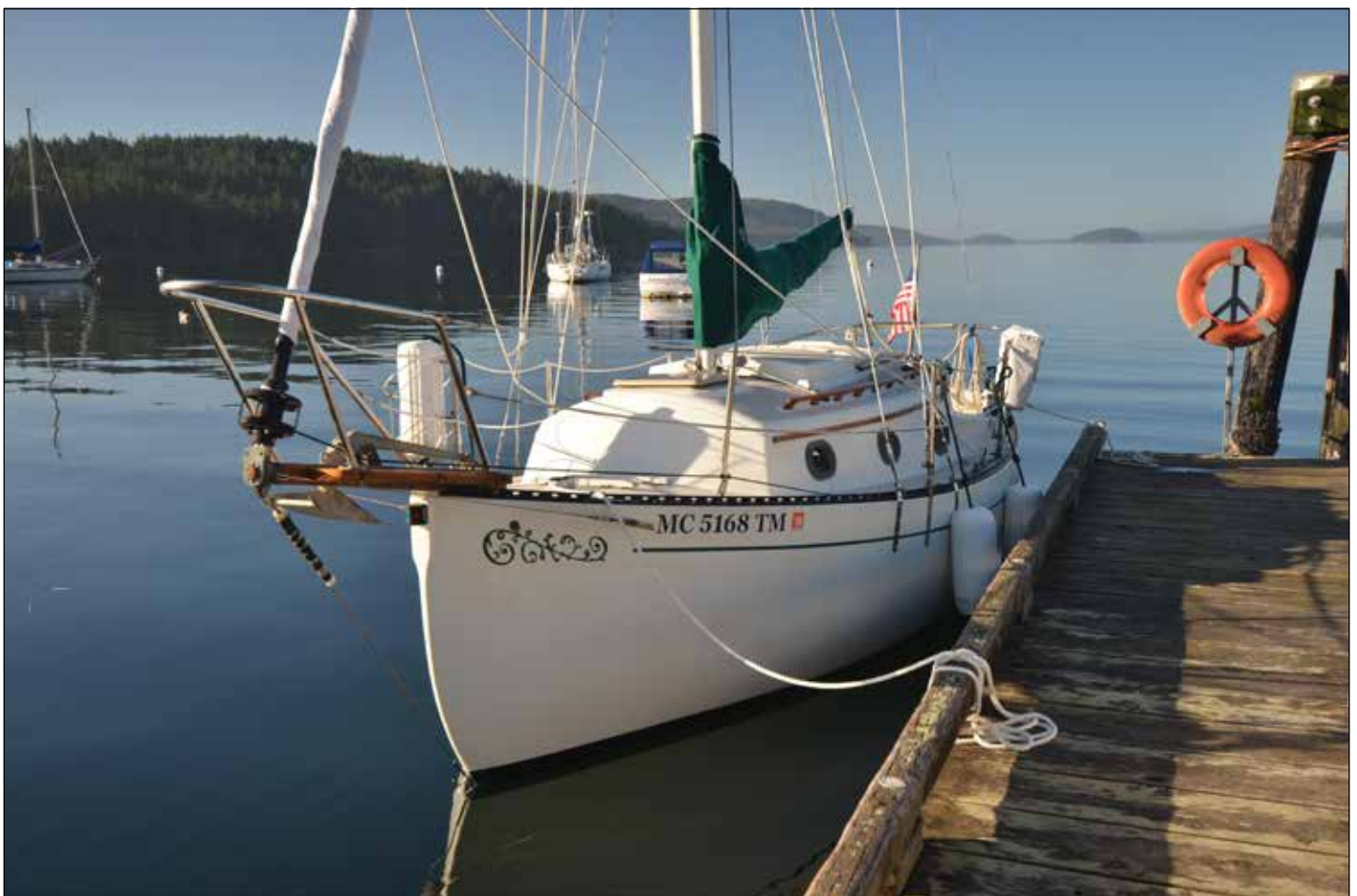
Stopping at the Olga Dock on the way to Rosario Resort.