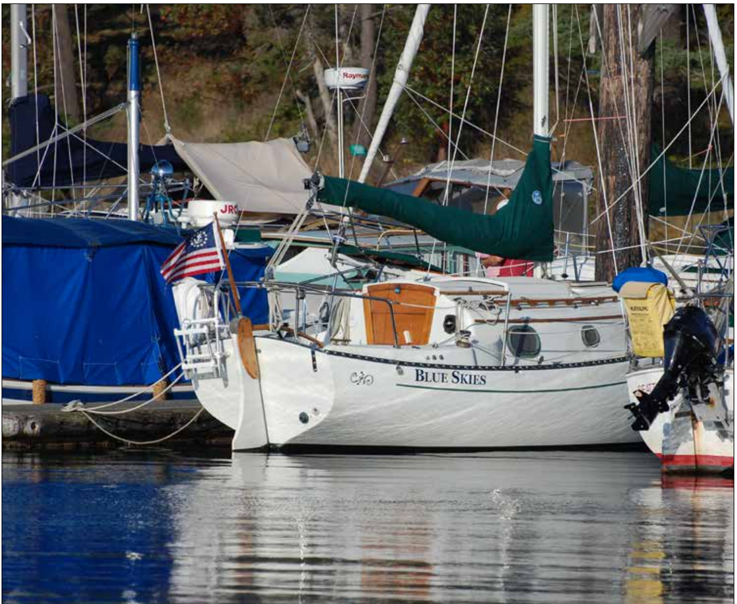
At the Port of Friday Harbor, San Juan Island.