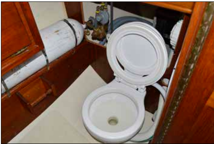
CNG Tank and Lavo Vacuum Head