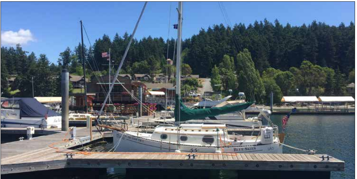
At Deer Harbor Marina on Orcas Island.