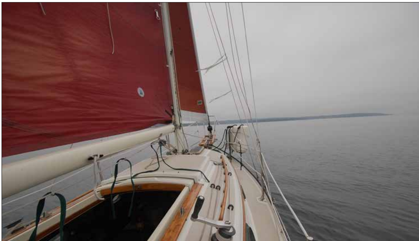
Sailing in the San Juan Channel between Lopez and San Juan Islands.