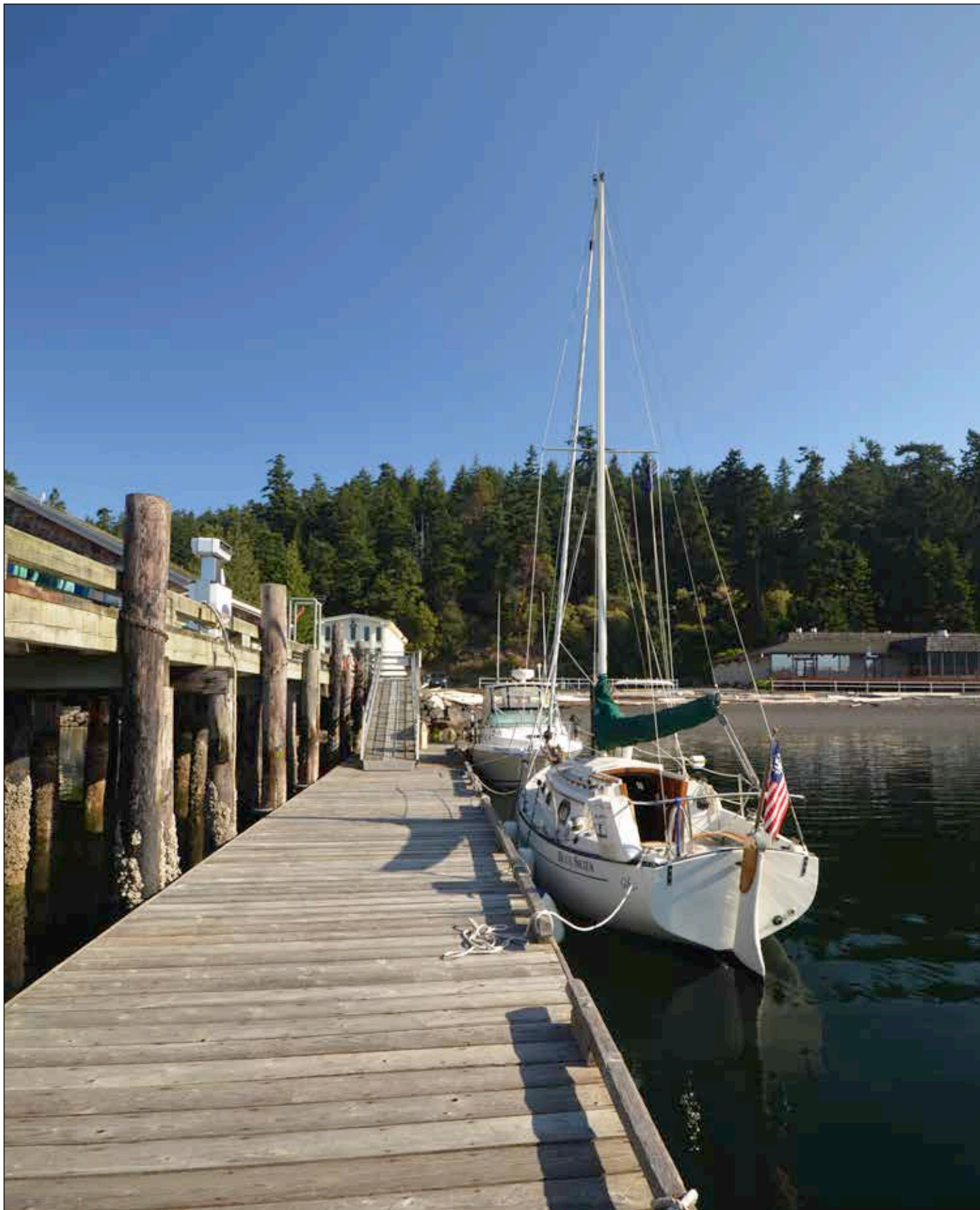
At the fuel dock at Rosario Resort Marina in the San Juan Islands in the Salish Sea.