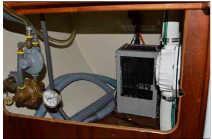
Lavo Manual Pump and Refrigeration System