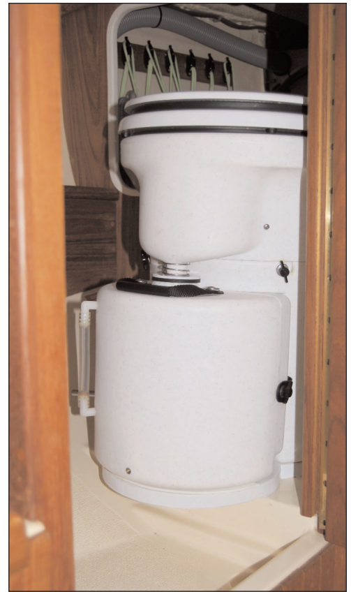
The gauge on the urine tank tells you how full it is.

The urine tank fits under the the front edge of the Air Head. It's held in place by knobs on either side. The liquid enters through a rigid tube on the underside of the Air Head, which fits into a hole in the top of the urine tank. This tube is fitted with a spring and gasket so the two components — Air Head and urine tank — are compressed together.