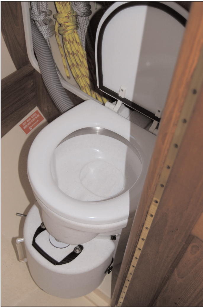
Clean and odor-free.

I've never encountered a macerator that didn't stink. I have had them uninstalled and cleaned vigorously, and still they exude a nasty waste smell. I had my doubts that we could eliminate the odor from the system, no matter what we did, if the macerator remained.