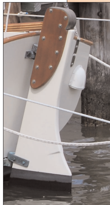
The vent emerges through the transom near the top. A marelon thru-hull and clamshell vent cover complete the installation.