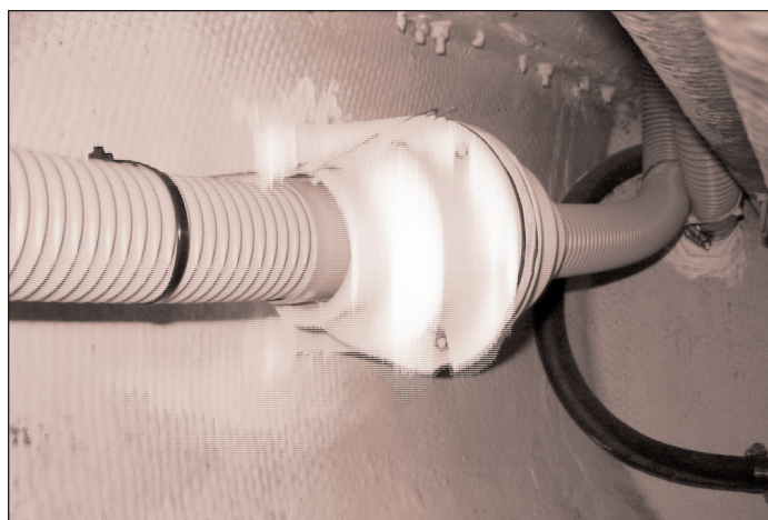
The vent hose. Note the loop tucked up into the coaming (upper right).

Although we could have run a vent hose straight up from the Air Head, we thought that the cabin top was too cluttered for a nice installation. And we could have run it out the side of the cabintop but didn't want a vent sticking out onto the narrow side deck. A vent out to the hull was