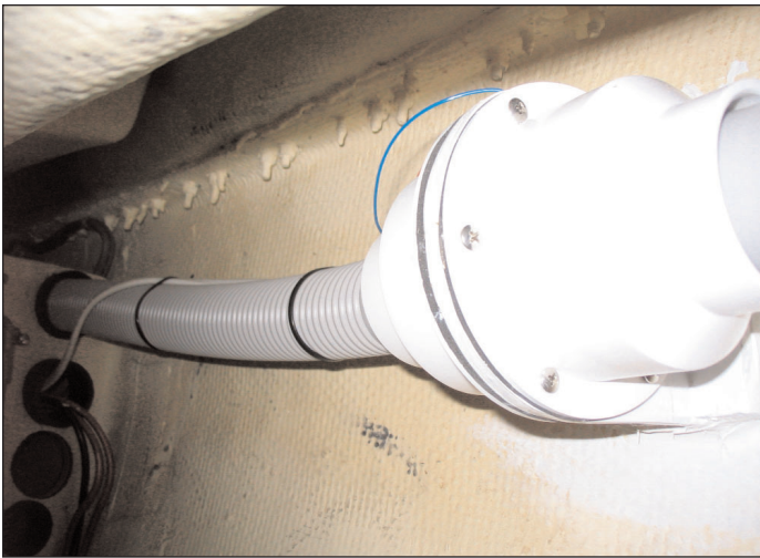
The vent hose and fan wiring are supported by wire ties screwed into the hull. Note the plywood pad behind the fan.

holes in that bulkhead; we may install a cover over them later for cosmetic purposes, but they'll be left in place in case re-installation of a traditional system is desired in the future.