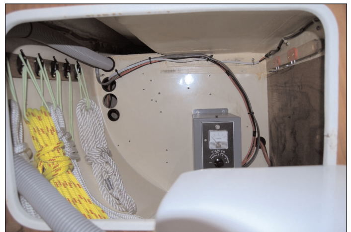
The wet locker has been freed up to hold other things.