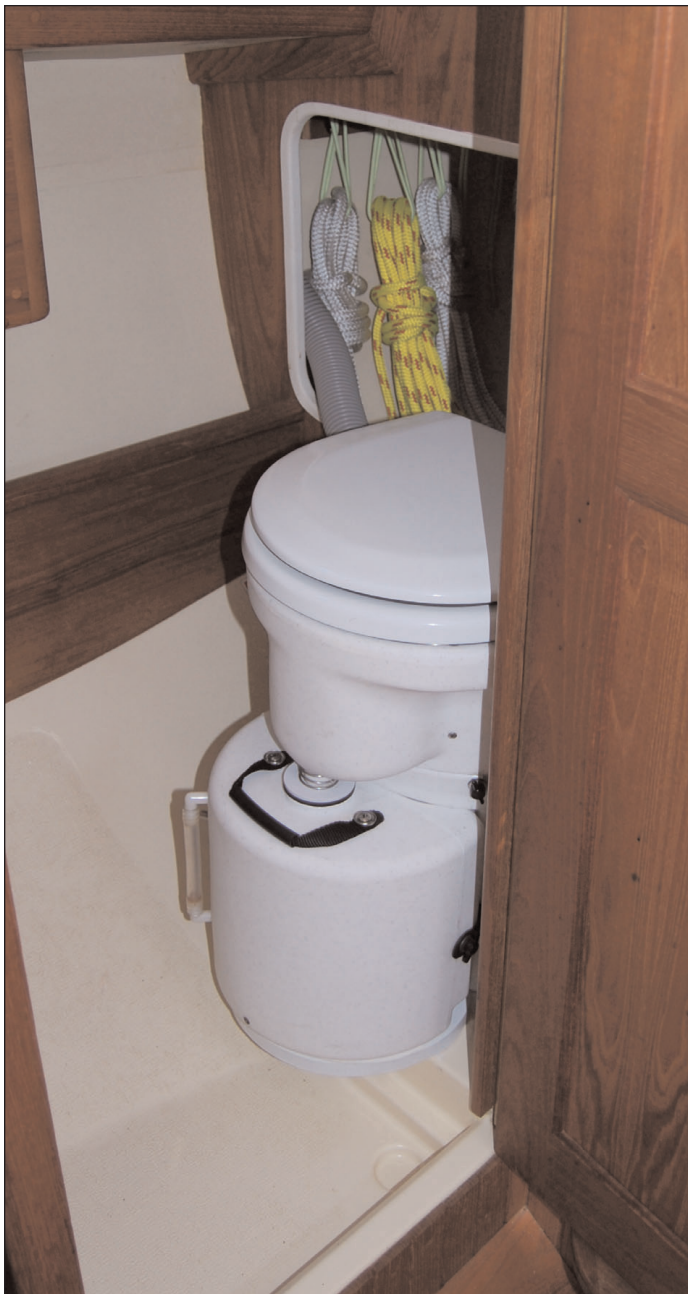
The Air Head,™ installed on Nina

It's discouraging to open the companionway hatch and smell the pent-up odors of waste from the boat's sanitation system. Eating supper and trying to fall asleep are unpleasant with the odors wafting through the cabin.